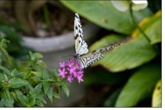
A giant wood nymph enjoys a moment of rest on a flower at Hiroshima City Forest Park's insectarium. Wood nymph's are said to have a vibrantly colored golden cocoon.