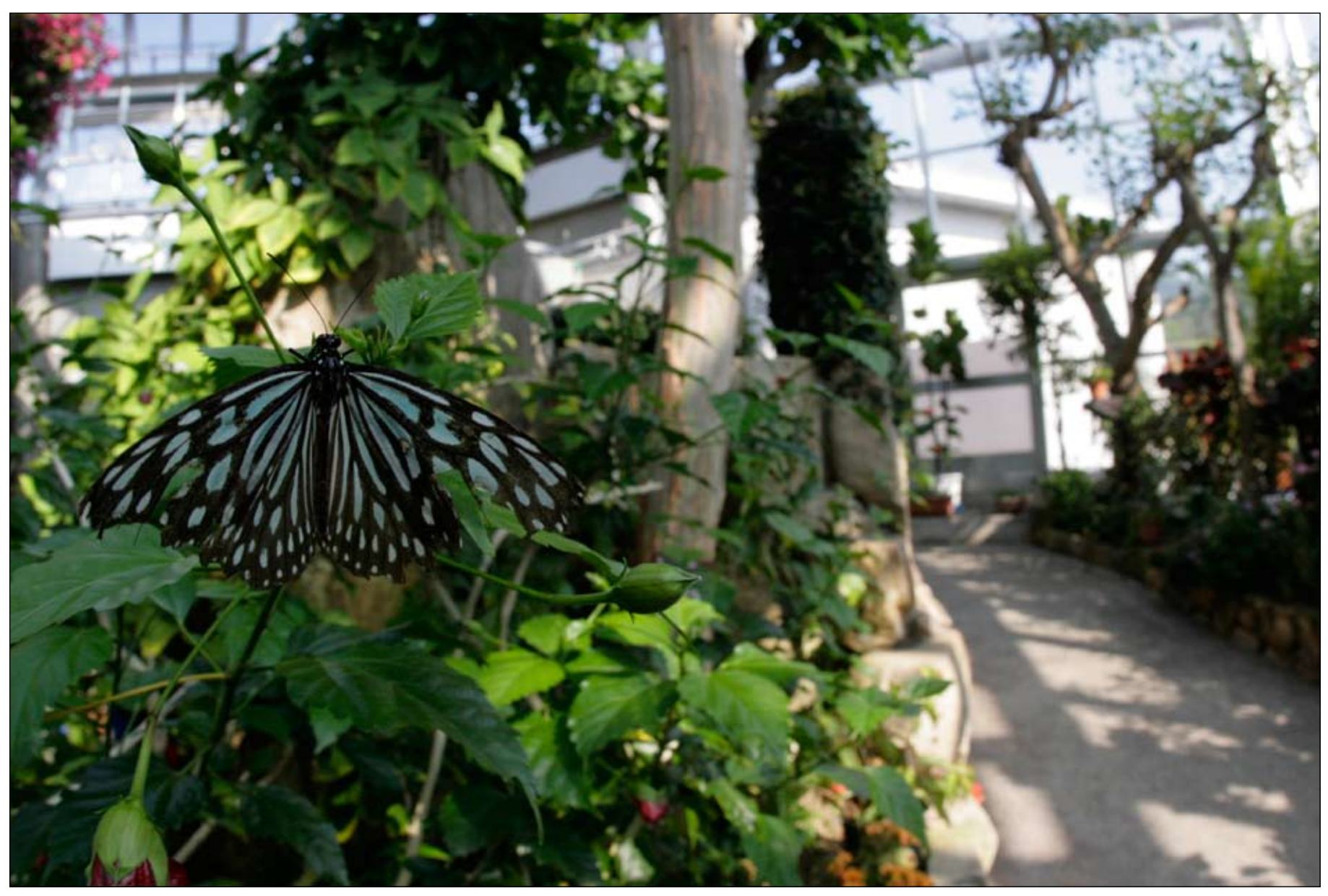
A Blue Glassy Tiger butterfly shows off it's spotted wings at Hiroshima City Forest Park's insectarium. Blue Glassy Tigers come from India and fall into the Nymphalidae butterfly family, which contains over 5,000 species. They are very popular in Okinawa according to Hiroshima City Forest Park's insectarium.

Pages 6 & 7 The Iwakuni Approach, May 30, 2008 Features