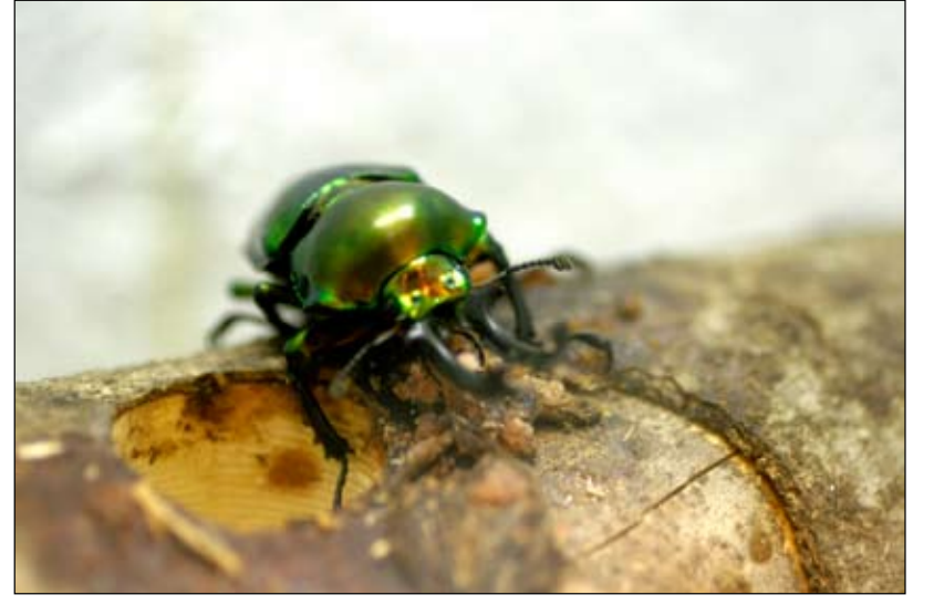
(Above) A Rainbow Stag Beetle rests comfortably in it's simulated natural environment in Hiroshima City Forest Park's insectarium. This species of stag beetle is said to be the most beautiful in the world. (Left) The butterfly garden at Hiroshima City Forest Park's insectarium is filled with a variety of foliage for the butterflies' consumption. The garden is home to over ten varieties of butterflies.