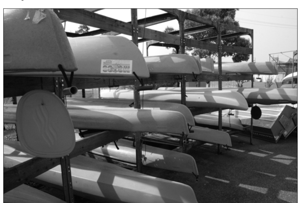
The station's outdoor recreation department offers a variety of canoes and kayaks for river-going fun. The equipment is offered for three-day rentals free of charge to all service members. Fish Tales Marina is located at the station's port facility adjacent from the control tower.

To sign up for any of the trips or for more information, contact Fish Tales Marina at 253-4617 or Outdoor Recreation at 253-3822.