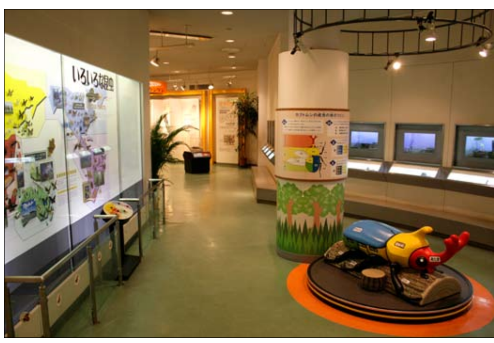
The insectarium at Hiroshima City Forest Park has a variety of educational displays mixed in with the insect display cases. Even though most of the information is written in Japanese, the visual illustrations are very intuitive.