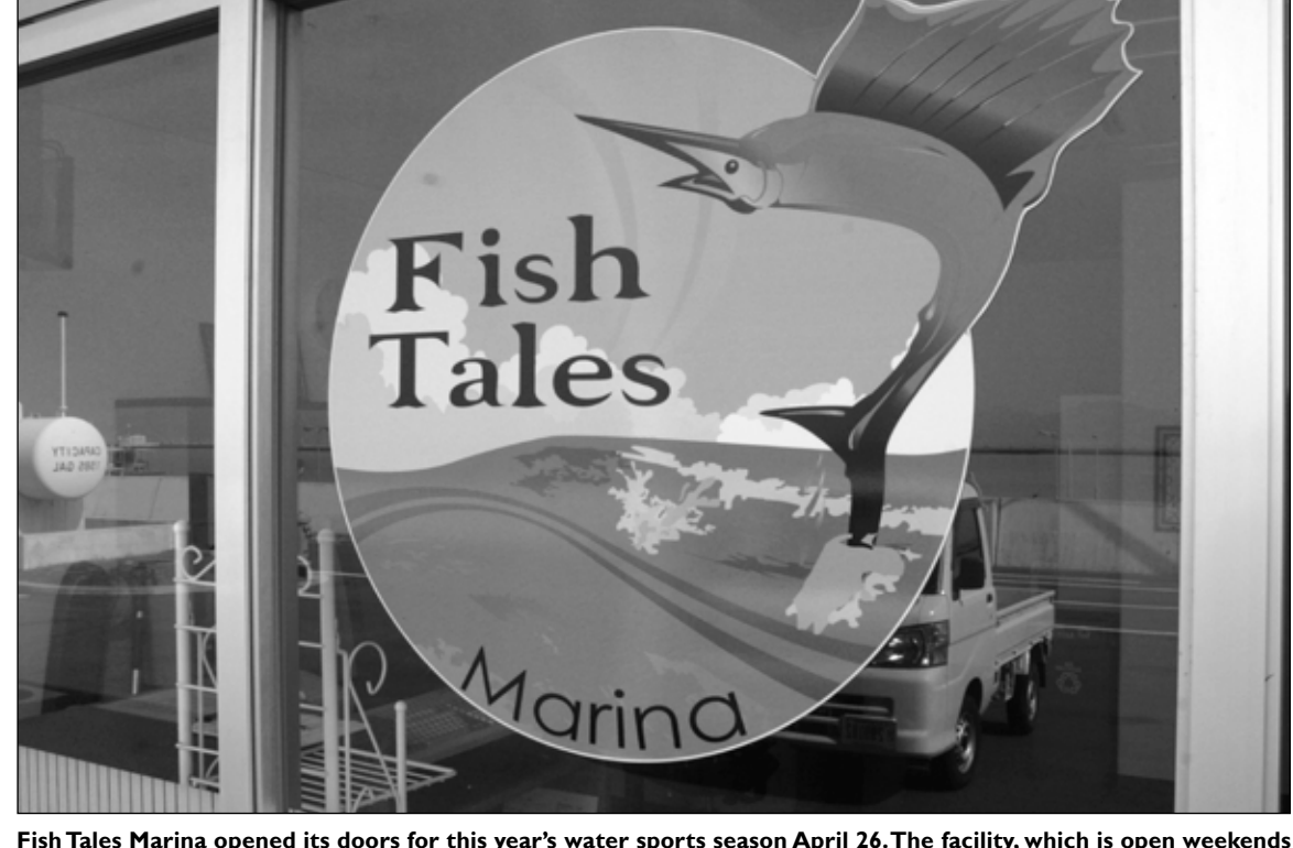
and holidays from 9 a.m. to 5 p.m., rents jet skis, sailboats, windsurfing boards, kayaks, canoes and a pontoon boat to

Along with brief required instructional and safety courses, the Marina, which is located adjacent to the control tower at the station's port facility, provides all the gear one needs to be safe and comfortable,