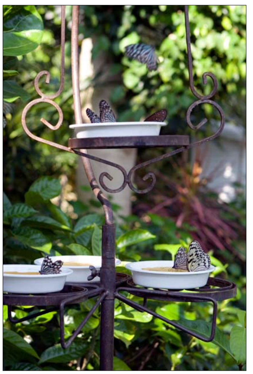
Butterflies enjoy a few water dishes at Hiroshima City Forest Park's insectarium. The Butterfly garden in the insectarium has at least 10 varieties of butterflies.