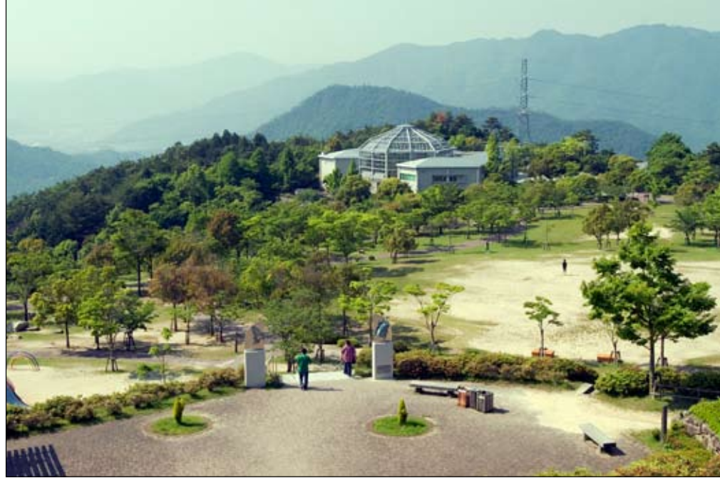
The insectarium at Hiroshima City Forest Park is nestled in the mountain area just outside city proper. The insectarium is just one of the many places to visit at the park.