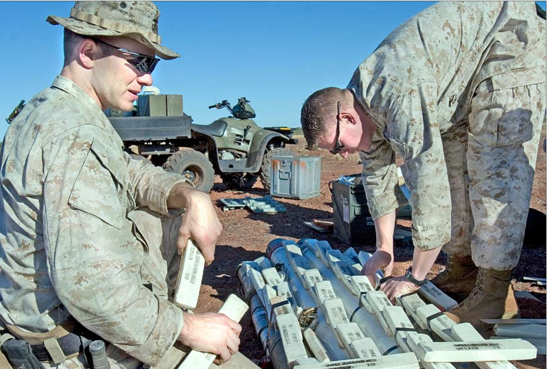
Explosive ordnance disposal technicians with Marine Wing Support Squadron 171 apply C-4 explosives to rockets, high-explosive warheads, and fuses at Delamere Range here Aug. 8 during exercise Southern Frontier 2008. The C-4 explosives were stacked to direct the force of the explosions downward and to burn the rockets from the tip to the back. Destroying the rockets from the tip back prevents them from potentially firing off during detonation.