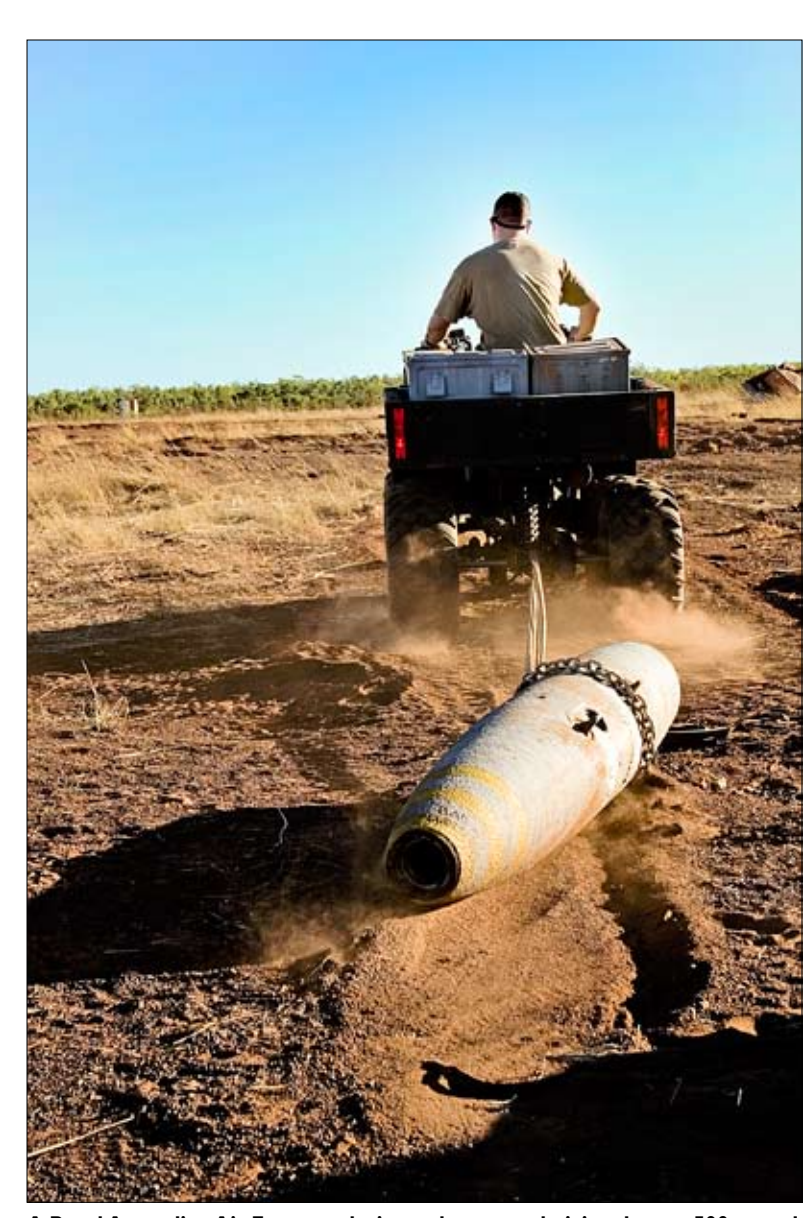
A Royal Australian Air Force explosive ordnance technician drags a 500-pound, high-explosive bomb to a detonation site on Delamere Range here Aug. 8 during exercise Southern Frontier 2008. EOD technicians separated the ordnance to be detonated into five sites with each comprised of more explosive poundage than the previous site.

Pages 6 & 7 The Iwakuni Approach, August 29, 2008 Features