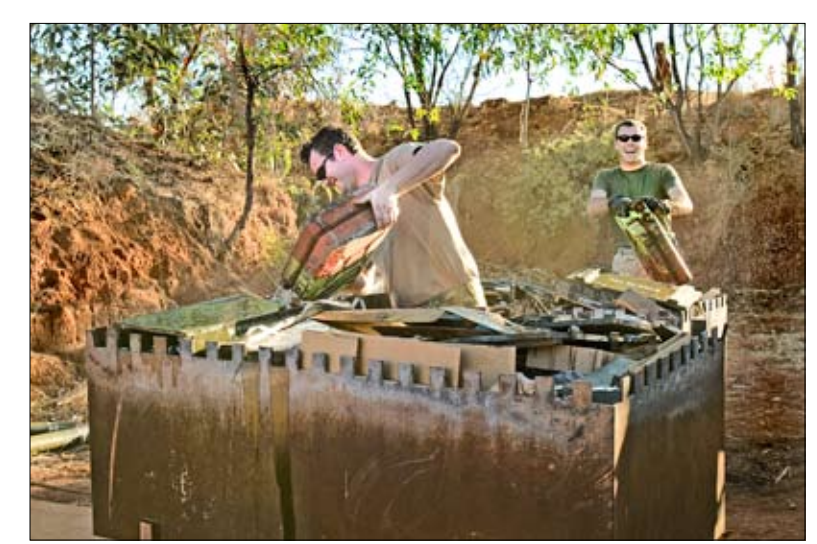
A Royal Australian Air Force explosive ordnance technician and a Marine Wing Support Squadron 171 EOD technician dump diesel fuel onto ordnance to be burned at Delamere Range here Aug. 8 during exercise Southern Frontier 2008. Most of the ordnance in these burn pits was surplus ammunition that the squadrons were not able to take upon departing the exercise.