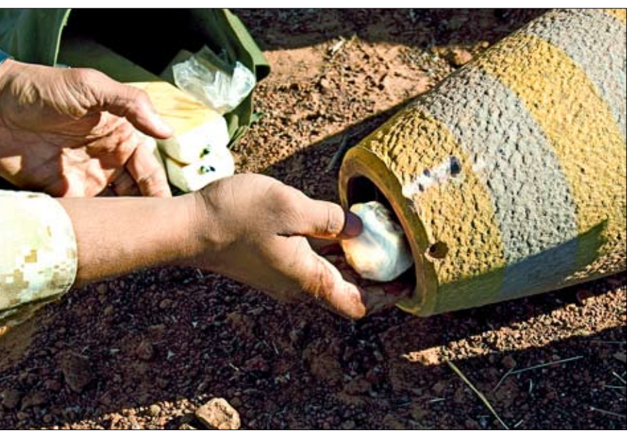
A Marine Wing Support Squadron 171 explosive ordnance disposal technician packs C-4 explosive into the tip of a 500-pound, high-explosive bomb at Delamere Range here Aug. 8 during exercise Southern Frontier 2008. This packing technique involves molding the C-4 inside the tip cavity; however, a stick of C-4 can be cut in half and placed into the cavity as well.