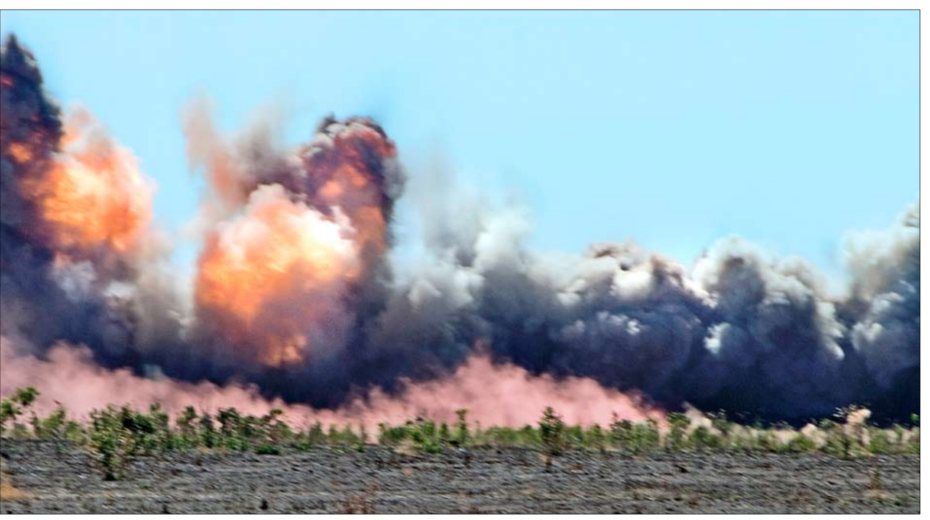
Fireballs fill the sky over Delamere Range as ordnance the explosive ordnance disposal technicians of Marine Wing Support Squadron 171 and the Royal Australian Air Force detonate here Aug. 8 during exercise Southern Frontier 2008. The five detonation sites were wired to the same line with less than a second of delay between each explosion. The blasts destroyed more than 10.000 pounds of ordnance.