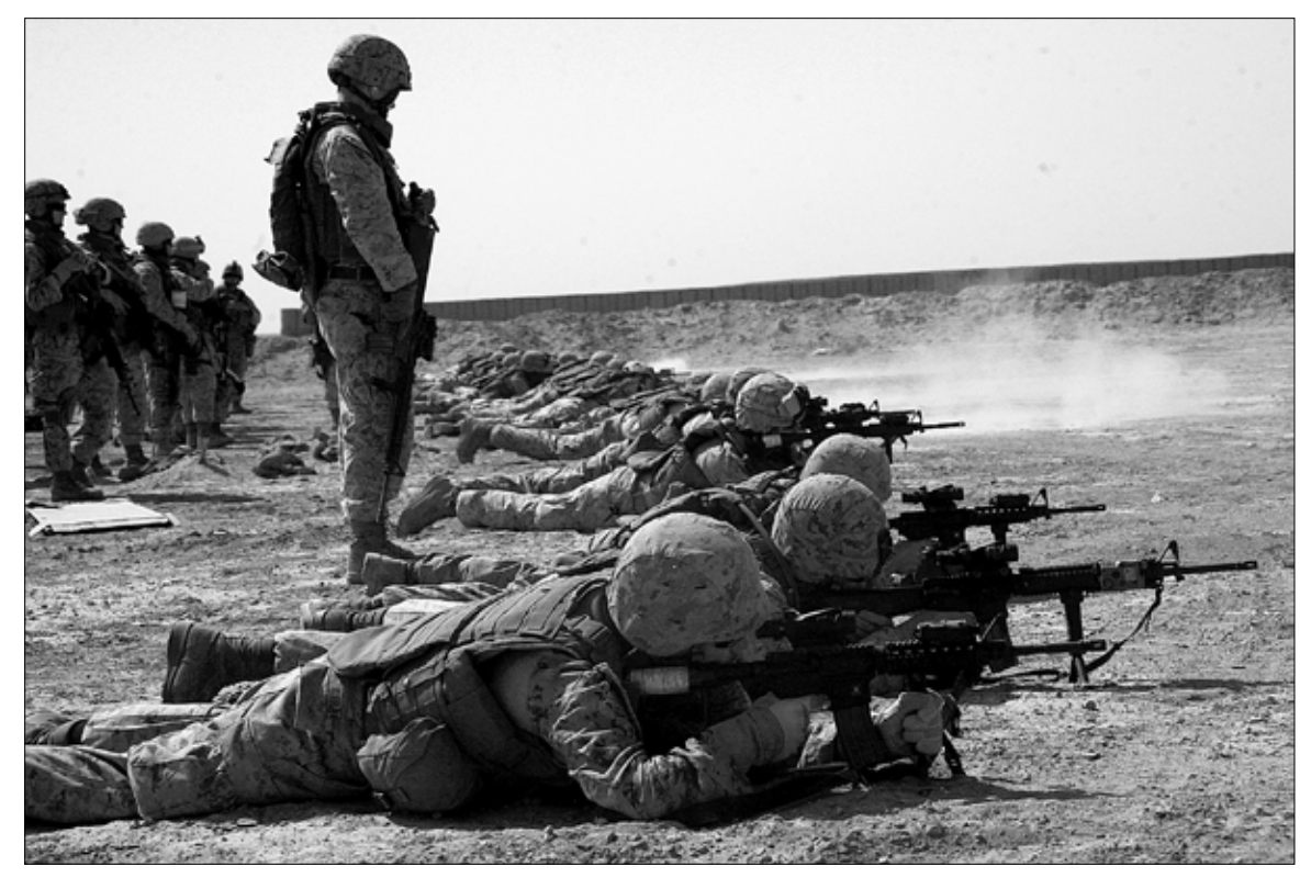
Shortly after arriving in Afghanistan, the Marines who volunteered to serve as combat replacements set the battle sight zero on their weapons. In order to fill in for combat losses suffered by TF 2/7 since deploying in early April, 146