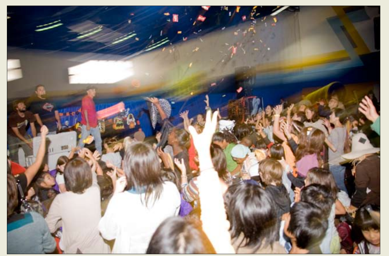
Children scramble for loads of candy hurled from a stage at the Marine Corps Community Services Halloween Party at Ironworks Gym Here Oct. 25. The party invited children from on and off base. Read the full story on page 6.