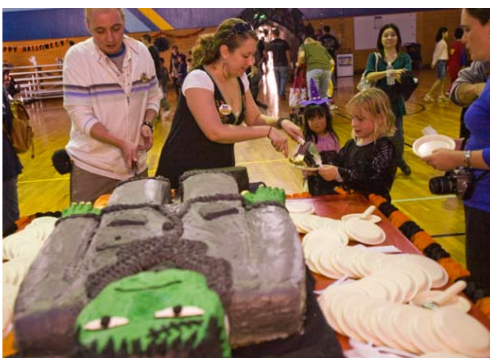
Cake servers make the first incisions into the six-foot Frankenstein cake served at the Marine Corps Community Services Halloween festival at Ironworks Gym here Oct. 24. After more than 600 adults and children attended the party, only the head and shoulders remained. The cake took three days to make according to MCCS officials.