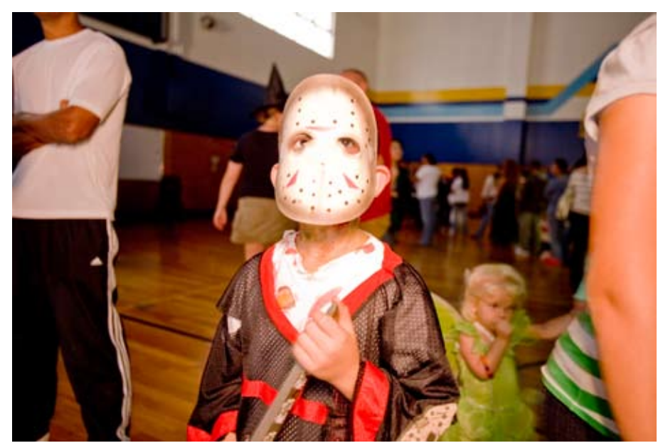
Jason Voorhees meets Wayne Gretzky on a child's Halloween costume at the Marine Corps Community Services Halloween party Oct. 25.