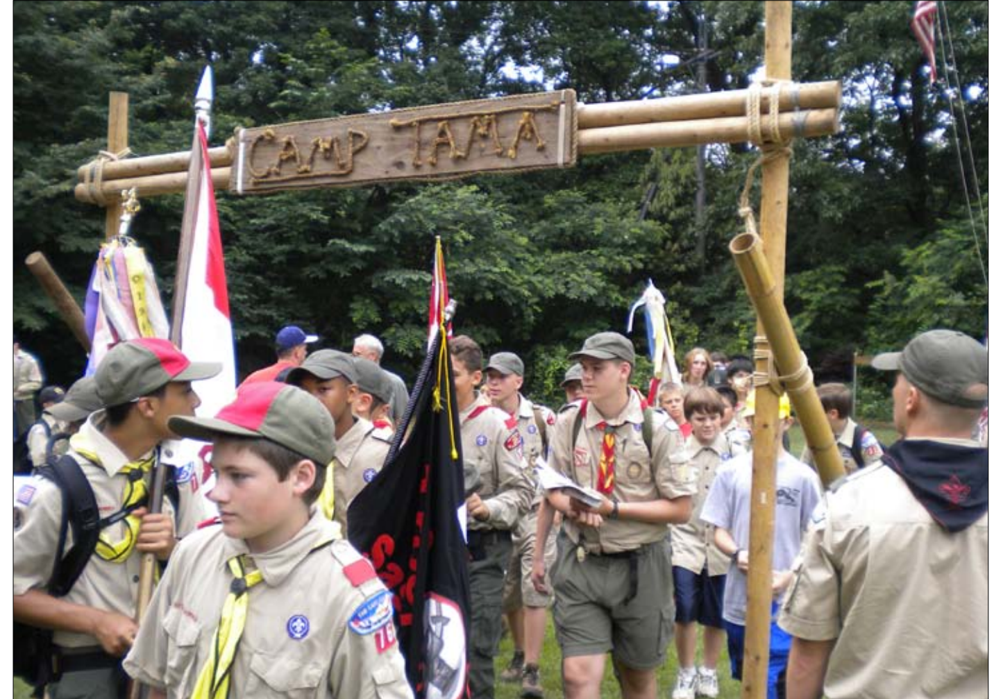
Boy Scouts of America Far East Council Troop 77 break from morning assemblies and hike to begin the remai ning activities for the day during their one-week su Camp Tama in Yokota, Japan. For their outstanding effort in their summer camp project, Troop 77 was titled the honor troop for the seventh year in a row. The troop's su camp project was a staircase made out of trees and rocks to help future troops walk down the steep hills around Camp Tama.