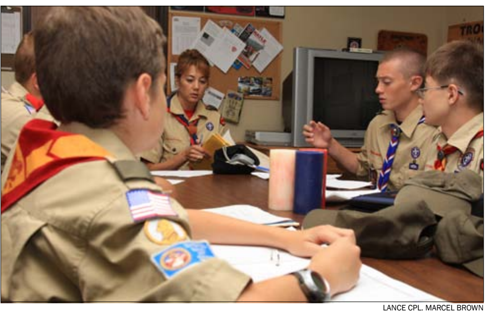
Scouts from Boy Scouts of America Far East Council Troop 77 discuss future plans for the upcoming months at the Troop 77 facility here July 12. The troop discussed future recreational events for the troop and ways to give back to