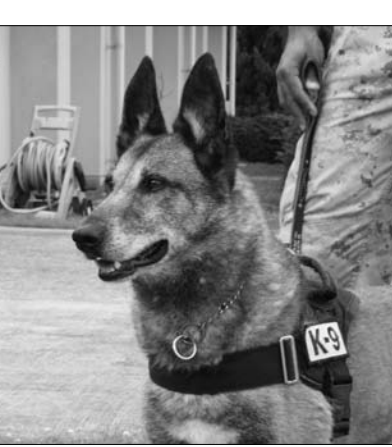
The Provost Marshal's Office military working dog section here has six handlers, four explo detector dogs and two narcotics-detector dogs