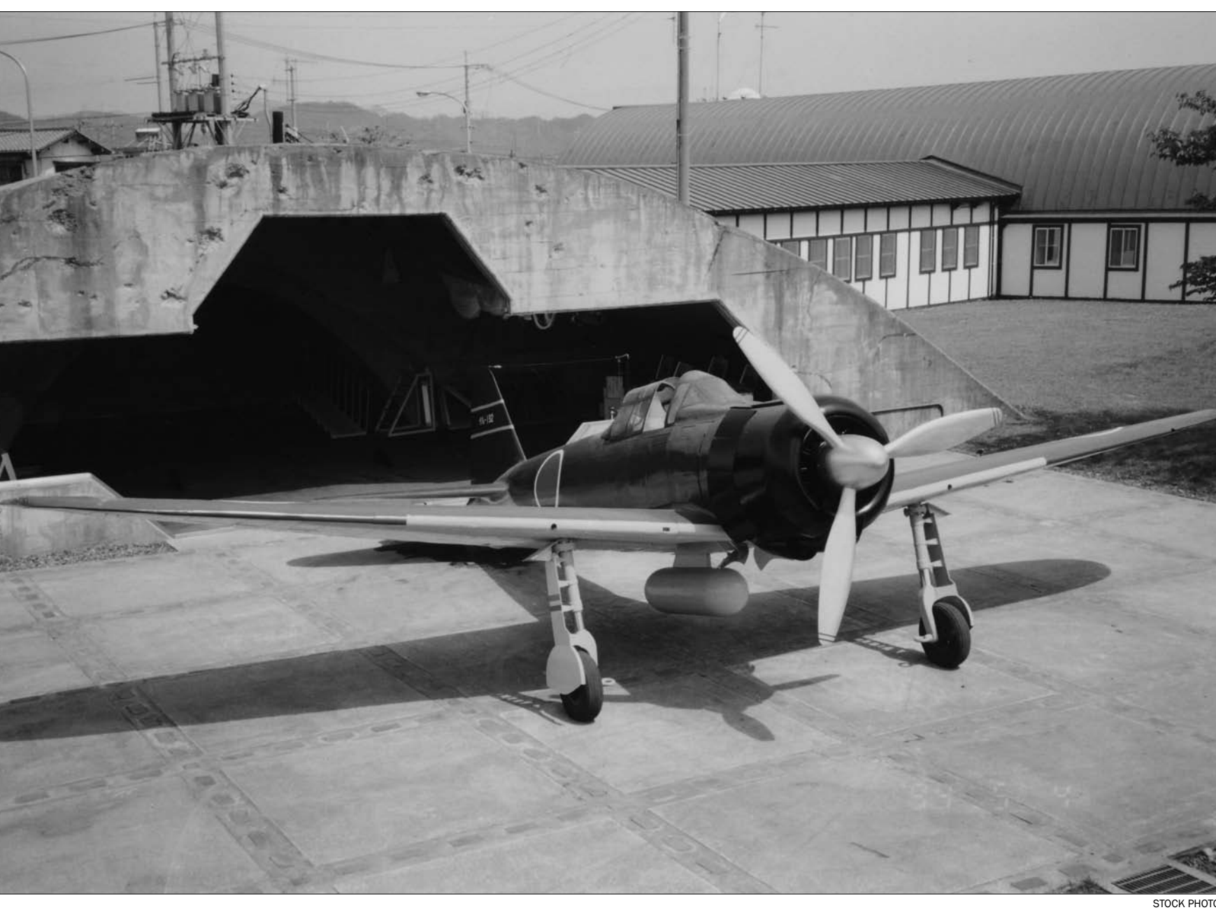
The replica Mitsubishi Type 0 Carrier Fighter sits in front of the Zero Hangar here May 4, 1993. The Zero was a long range fighter aircraft used by the Japanese Imperial Army from 1940 to 1945. The shrapnel-scarred Zero Hangar across the street from the Provost Marshal's Office here is one of the last few reminders on the air station of the presence the Zero had during the last world war.