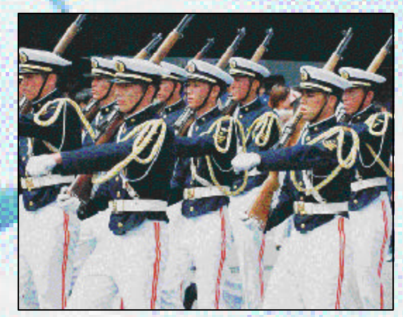
The Japanese Maritime Self Defense Force Ozuki aviation cadet training school drill team marches with precision during their performance at Sunday's open house.