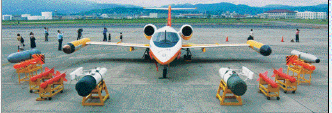
A U-36A Learjet is exhibited at Sunday's open house. The small aircraft is used by the Japanese Maritime Self Defense Force for air training support.