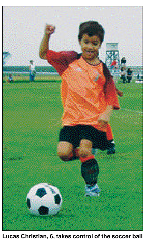
during the first soccer game of the season at Penny Lake.