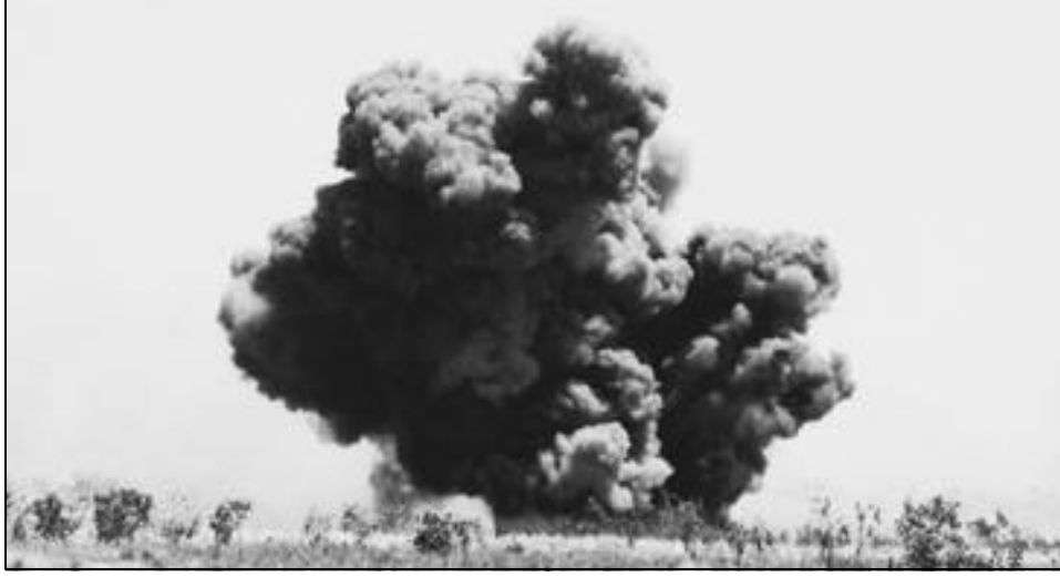
Marine Fighter Attack Squadron 212 and Marine All Weather Fighter Attack Squadron 533 drop live ordnance Sept. 9, 2004 while in support of Southern Frontier. Southern Frontier is a Marine Aircraft Group 12 deployment of Marines, aircraft, and associated support to Australia.

over, the Marines ate lunch and were given a tour of the scoring tower where the RAAF personnel keep score of the ordnance dropped. Two cameras set out at different angles display the bombing area and let the pilots know if they have hit their