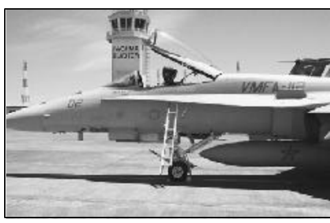
An F/A 18A rests on Iwo Jima's flight line during VMFA-112's recent historic visit.

VMF-112's action at Iwo Jima was historic because it marked the first time that carrier based Marine aircraft flew in support of Marines attacking on the ground. On February 20, 1945, 24 hours after the first Marine landings on Iwo Jima, eight Corsairs from VMF-112 attacked Japanese pillboxes and mortar gun emplacements near Iwo's Number 2 airfield as Marines on the ground closed in to capture the airfield. The next day VMF-112's Corsairs pounded Japanese gun emplacements with 5-inch rockets, helping clear a path for Marines to advance further up the island. The air coordinators on the ground radioed a "well done" as the squadron returned to the Bennington after the attack. On the third day, the squadron's pilots once