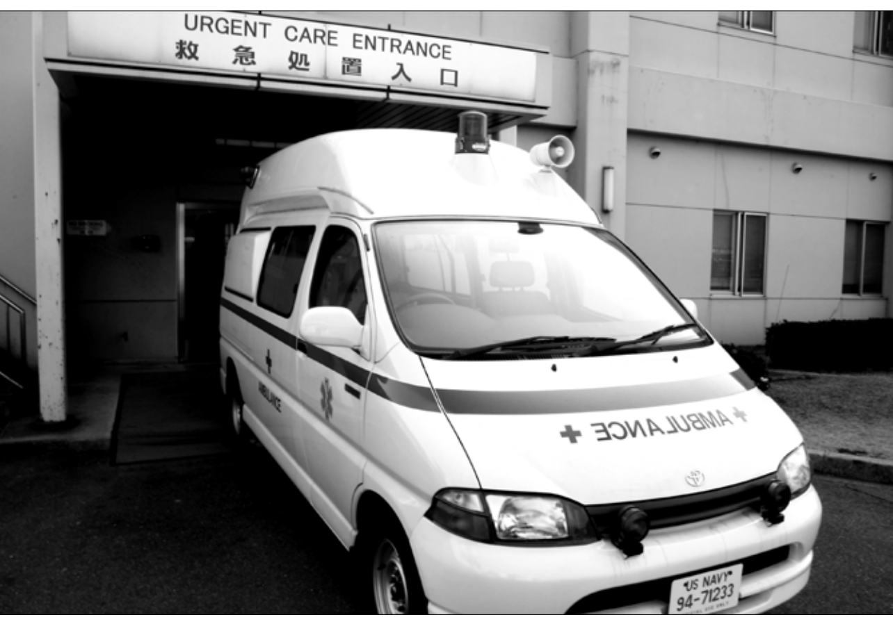
Iwakuni Branch Health Clinic patients will be taken off base for anything the clinic cannot provide, such as MRIs, CAT scans, diagnostic tests, IV antibiotics or surgeries. Family members and unit representatives will be notified and kept up to date on the patients' condition by clinic staff.