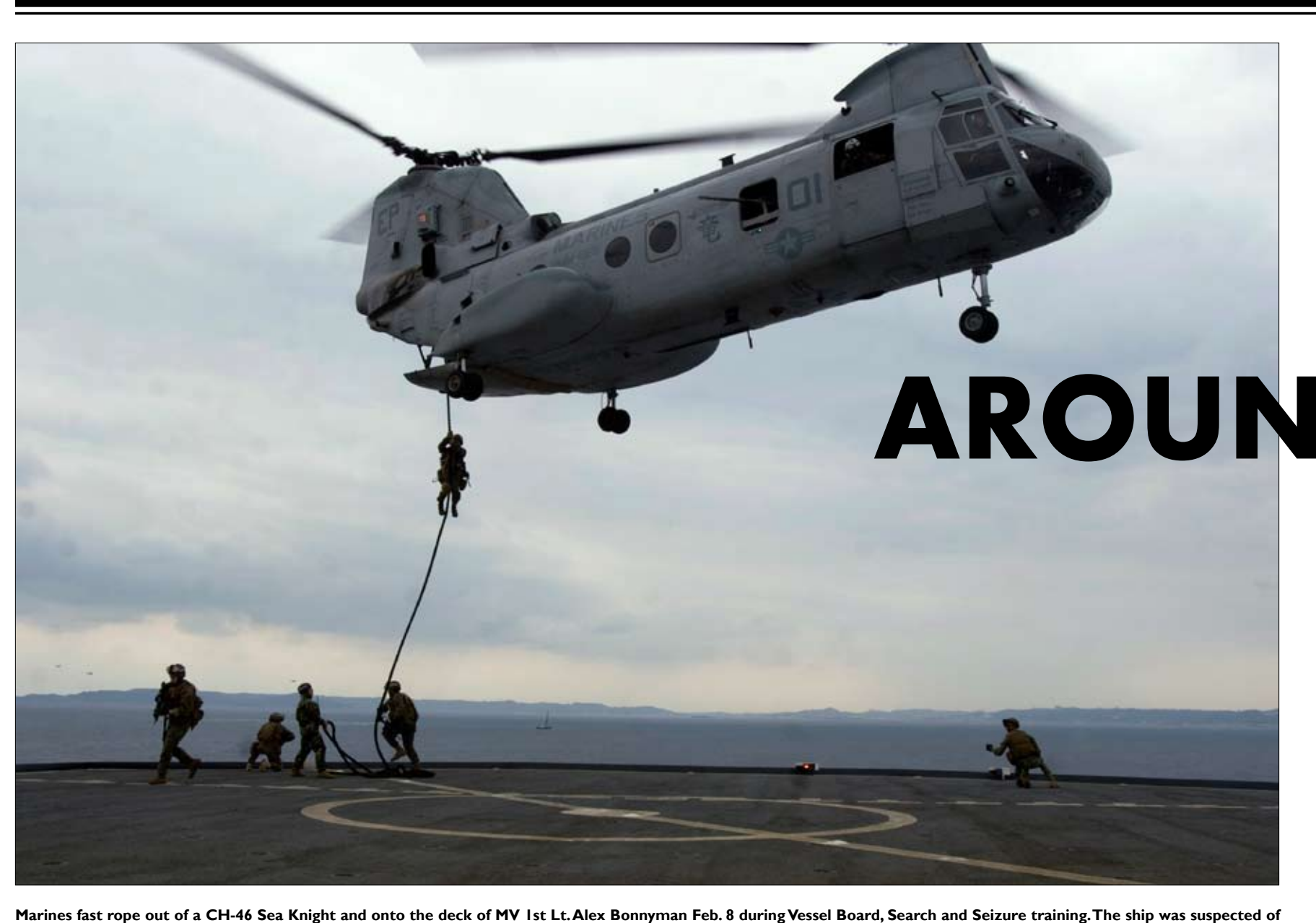
carrying suspicious cargo.

BOARD THE MV 1ST LT ALEX BONNYMAN, OKINAWA, Japan (Feb. 15, 2008) A group of role players took control of the ship MV 1st Lt. Alex Bonnyman (T- Marines rapidly approached the ship. AK 3003) when they threw the captain and the crew overboard during a training exercise Feb. 8.