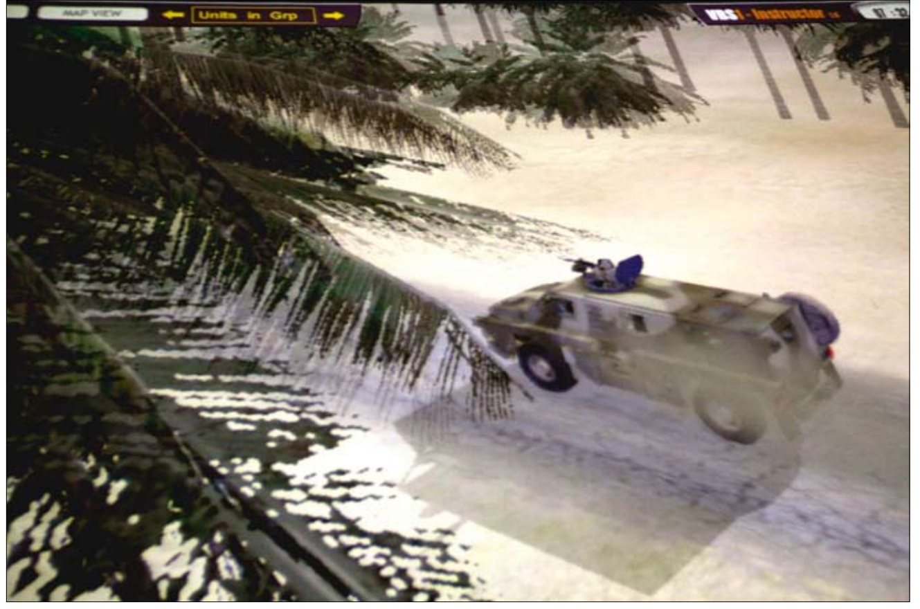
DIGITAL WARRIORS Resembling a modern role-playing video game, a screen grab from Training and Education Command's (TECOM) newly-implemented Virtual Battlefield Systems II software simulates chaotic combat scenarios in a pixilated environment for trainees and veterans alike. The software made its debut at the Indoor Small Arms Range (ISAR) here Feb. 12 and is described by ISAR personnel to be "closest to the real thing."

Issue No. 7, Vol. 1 Friday, February 22, 2008 Marine Corps Air Station Iwakuni, Japan