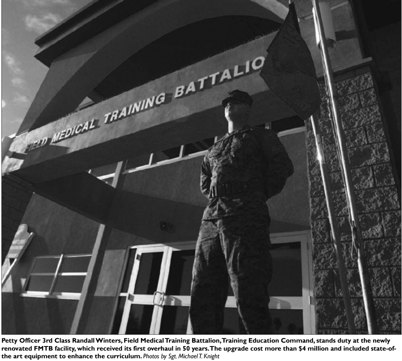
renovated FMTB facility, which received its first overhaul in 50 years. The upgrade cost more than $4 million and included state-ofthe art equipment to enhance the curriculum.