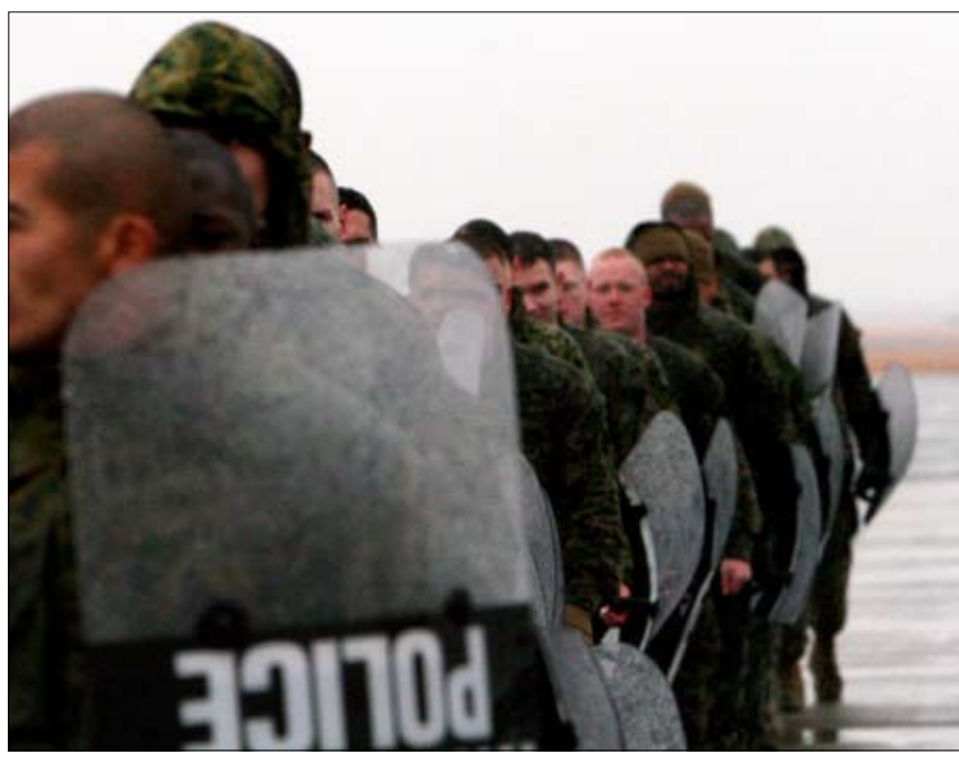
(Left) Aircraft rescue firefighters remove a pilot from the site of his mock downed aircraft. (Above) Auxiliary Security Forces personnel march in a column of files while preparing to respond to a simulated hostile crowd near the site of an assumed downed aircraft.