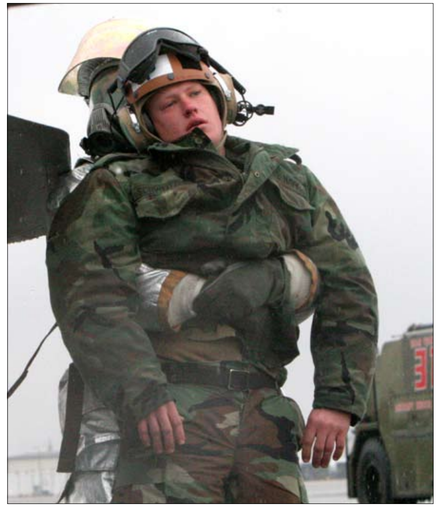
(Far left) Aircraft rescue firefighters tread through a simulated jet crash scene, preparing to extinguish hazardous flames in the area as part of a mass casualty drill. (Left) Aircraft rescue firefighters lower a pilot from his mock downed aircraft.