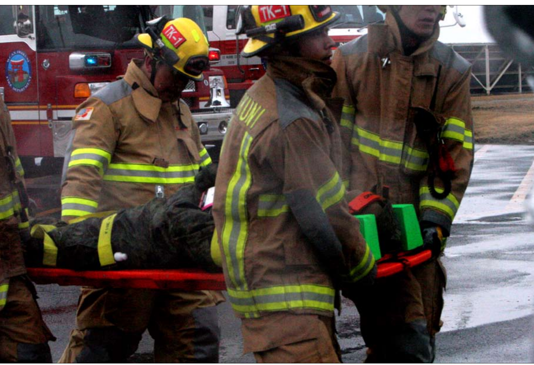
Simulated casualties are removed from the scene of an assumed downed aircraft by station aircraft rescue firefighters as part of a mishap exercise.