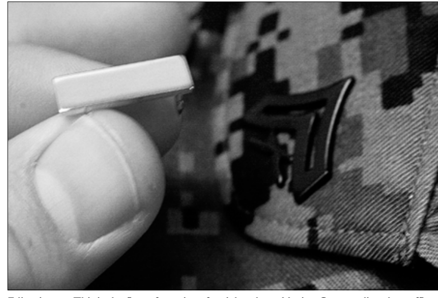
Editor's note: This is the first of a series of articles about Marine Corps enlisted-to-officer commissioning programs. The next article will highlight the Enlisted Commissioning Program (ECP).