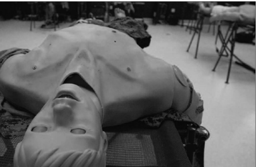
New combat trauma patient simulators sit in the lab of the Field Medical Training Battalion, Training Education Command. The dummies breathe and bleed, and the lab is equipped with a sound system and smoke machine. These recent additions add realism to training scenarios for the corpsmen in training.

There is a rededication ceremony planned for the building in March, and