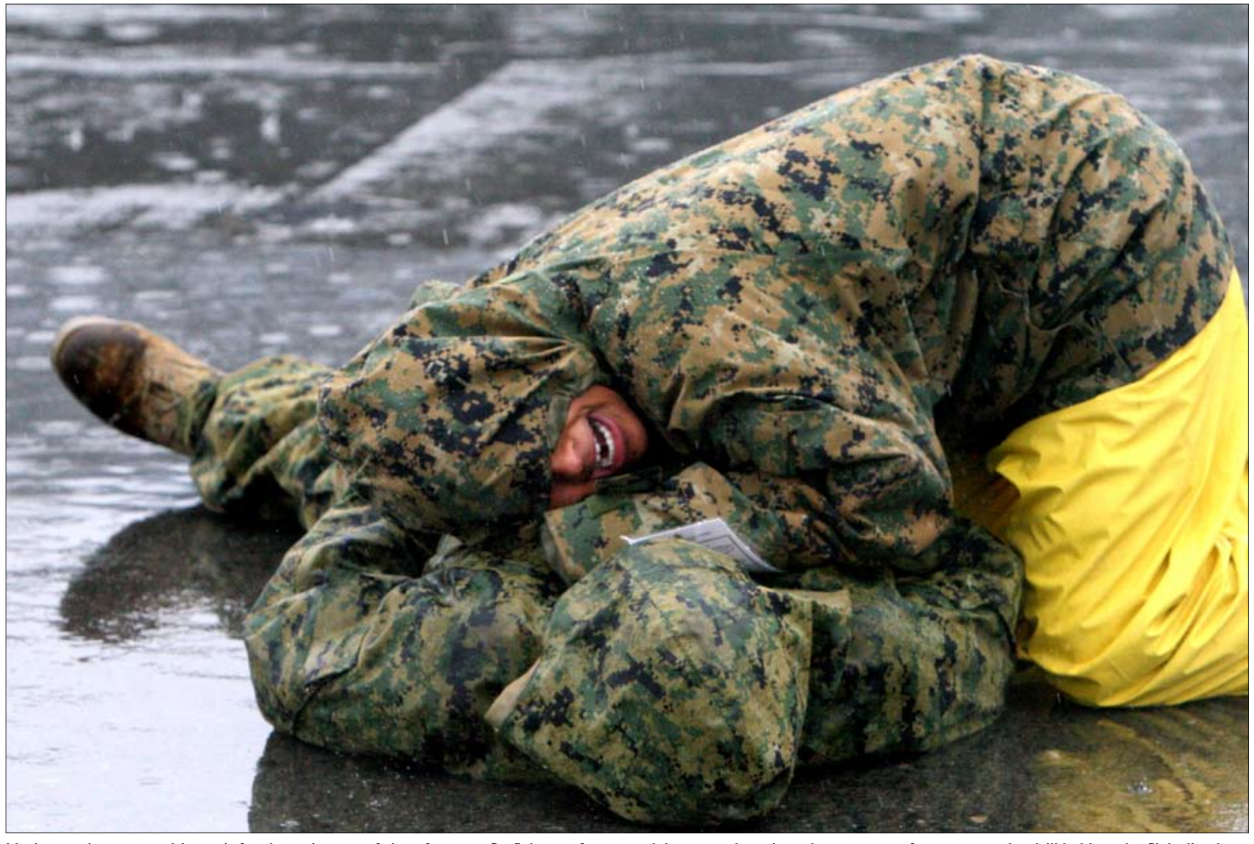
Marines acting as casualties wait for the assistance of aircraft rescue firefighters after a mock jet came down into them as part of a mass casualty drill held on the flight line here Tuesday. Training officials said the training is preparing them for a possible contingency on Iwakuni's upcoming Friendship Day.