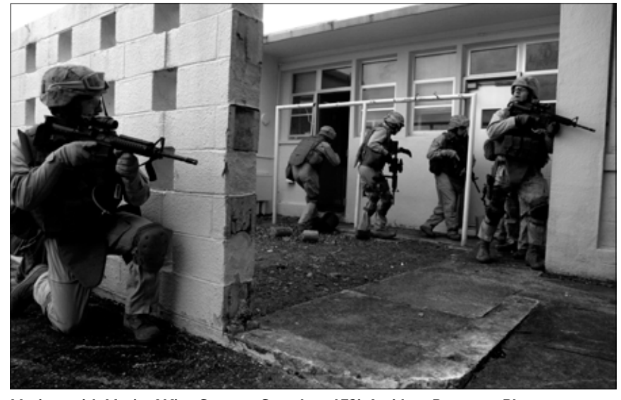
Marines with Marine Wing Support Squadron 172's Incident Response Platoon prepare to enter and clear a house during mock patrolling and local populace handling at an

They then patrolled the neighborhood and tried to accomplish different missions while role players, dressed in imitation traditional Middle Eastern garb, interacted with the Marines, basing their actions on