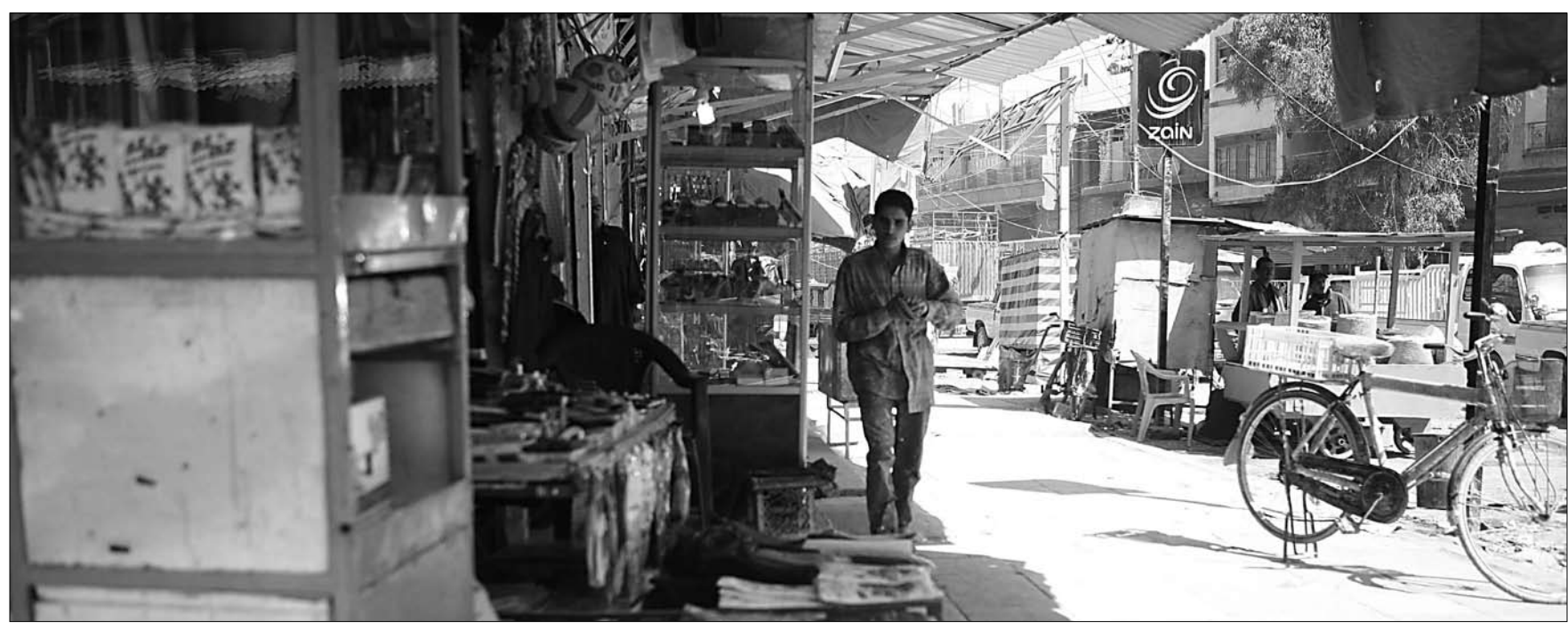
A local resident shops for goods at the Andaloos market. The market has begun to thrive as the city of Fallujah becomes more peaceful.