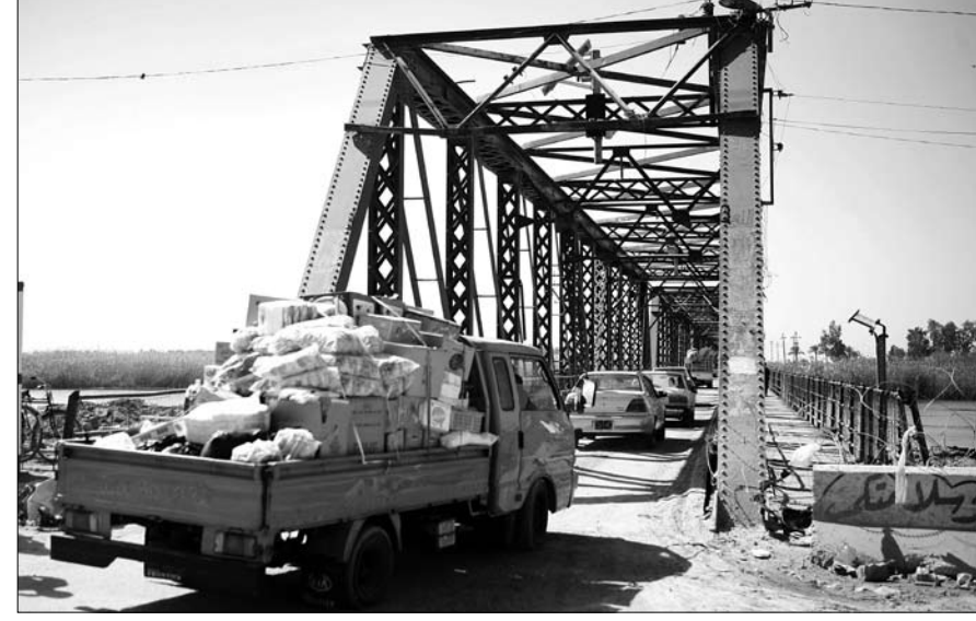
A truck loaded with goods drives onto the infamous "Blackwater" bridge.The bridge, once the sight where insurgents hanged the bodies of mutilated American contractors, now acts as a gateway into a thriving marketplace.