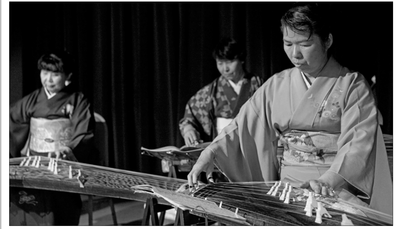
Female koto musicians from the local community send good vibrations to an audience at the Club lwakuni ballroom here during the annual Women's Art Women's Vision event March 11. As part of Women's History Month, the event recognized women's accomplishments and contributions to society especially in the area of visual arts. Guests walked around tables displaying works in painting, photography, textiles and graphic design with the traditional "cherry blossom" music filling the air.