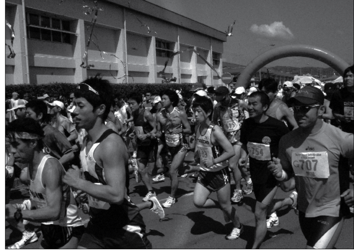
Japanese and American runners start the 42nd annual Kintai Marathon in front of IronWorks Gym here Sunday. Exactly 1,000 people participated in the event which featured a marathon, half marathon and five-kilometer walk.