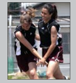
Samurais end season on high note