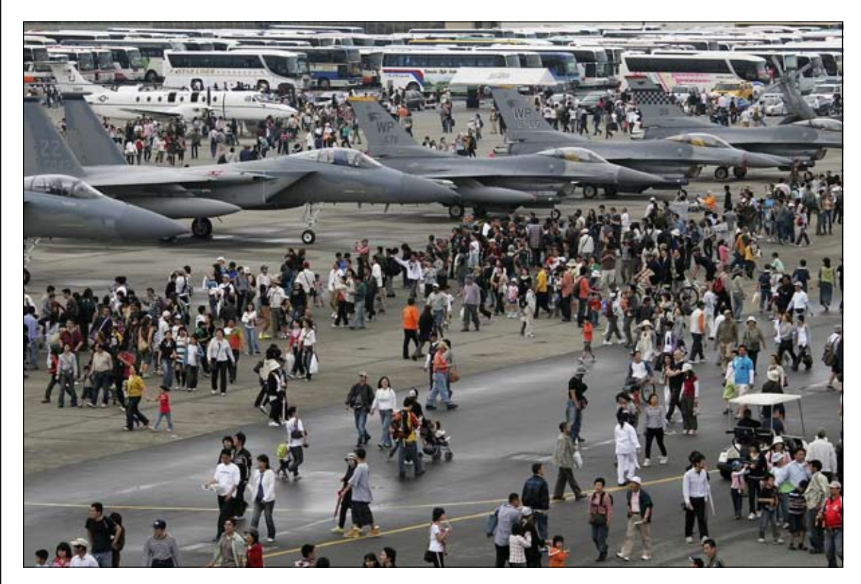
Visitors tour the Japanese and American aircraft on display at the Marine Corps Air Station Iwakuni apron line during Friendship Day 2008 Monday. Despite the overcast morning, the annual open house and air show drew more than 93,000 attendees before noon. SEE STORY ON PAGE 6