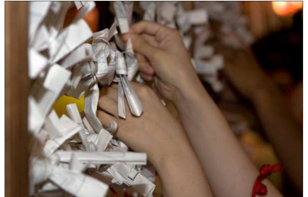
Fortunes written on slips of paper are tied onto metal bars during the Yukata Festival in Hiroshima City Sunday. People will tie fortunes onto bars or tree limbs as a sign of prayer that either the fortune comes true is good or does not come true if bad.