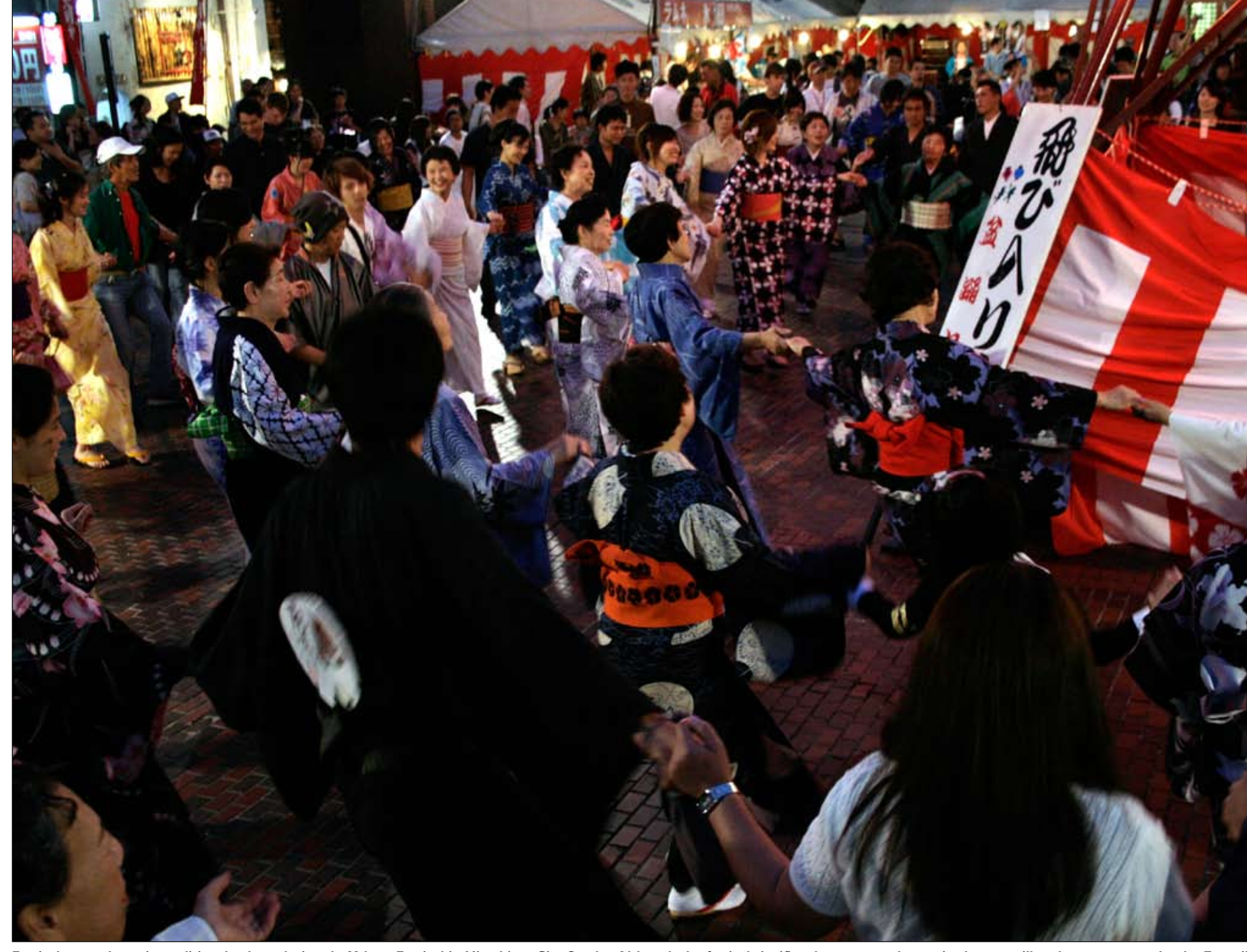
Festival goers dance in traditional yukata during the Yukata Festival in Hiroshima City Sunday. Although the festival signifies that summer has arrived, most will make sure to stop by the Enryuji Temple to make an offering, receive a blessing or receive their fortune.

The festival concluded at midnight on Sunday with yukatas still streaming off into the night.