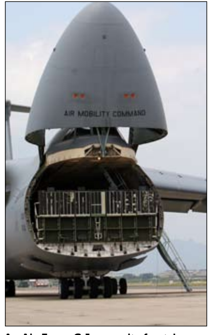
An Air Force C-5 opens its frontal cargo space preparing to unload a 45,000 lb. Sonar dome rubber window, a large navy ship part, June 6. The part was taken to the port facility to be loaded onto a ship for further travel to Yokosuka the next day.

Issue No. 22, Vol. 1 Friday, June 13, 2008 Marine Corps Air Station Iwakuni, Japan