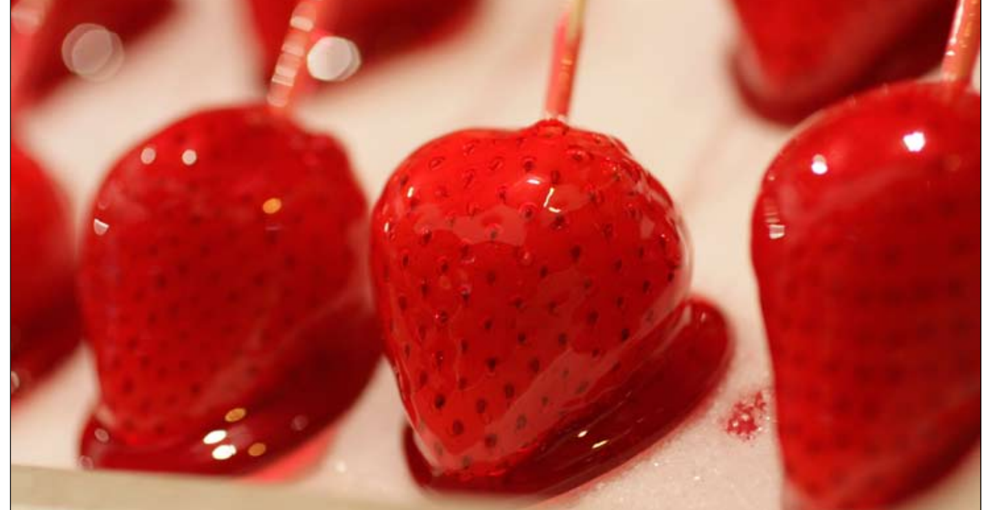
Candied fruits, such as strawberries, pineapples, cherries and apples, are one of the many snacks offered by vendors during the Yukata Festival in Hiroshima City Sunday. Besides the food stalls, goldfish scooping and balloon fishing are intertwined amongst the myriad of snack vendors.