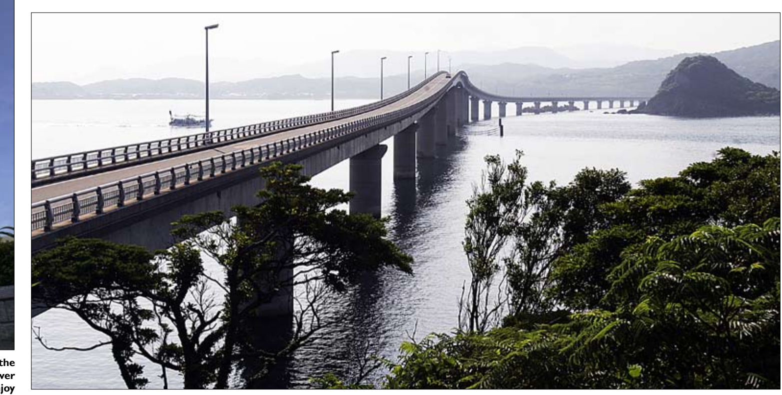
To reach Tsunoshima island visitors must cross the second longest no-toll bridge in Japan. Drivers can park in the turnouts halfway across the bridge to snap photos or take in the view.