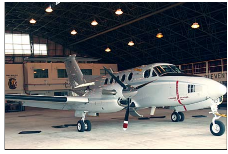
The C-12 transporter aircraft is a seven-passenger plane capable of carrying its contents around the world. Headquarters and Headquarters Squadron C-12 Operations is currently looking for air crew chiefs to assist the pilot in maintaining the wellness of passengers and aircraft cargo.

can be fun. How many Marines can say that they've visited five or 10 different countries in their four-year career?"