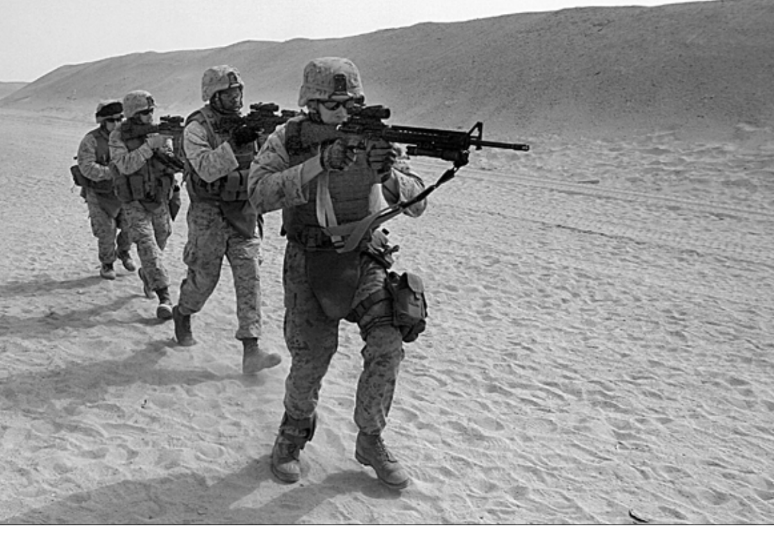
Light Armored Vehicle Scouts with Weapons Company, Battalion Landing Team 2/5, 15th Marine Expeditionary Unit, advance toward an objective during a live fire Military Operations in Urban Terrain exercise in Northern Kuwait. Weapons Company came ashore to Kuwait in late June to conduct sustainment training, ensuring vital war fighting skills are not lost. Kuwait provides open space for the company to practice combat driving skills and ranges to conduct live fire exercises. The Camp Pendleton, Calif. based 15th MEU is comprised of approximately 2,200 Marines and Sailors and is a forward deployed force of readiness capable of conducting numerous operations, such as Non-combatant Evacuation Operations, Humanitarian Assistance Operations and a wide range of amphibious missions. The 15th MEU is currently conducting sustainment training in Kuwait.

"It's great out here because the terrain and open desert