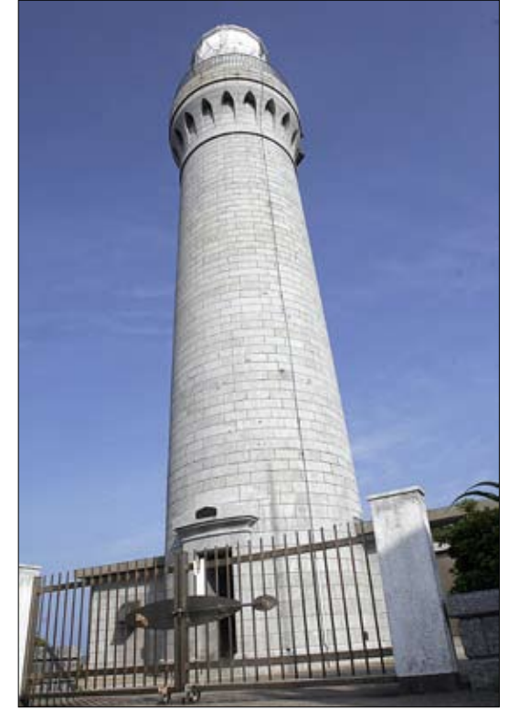
Designated a cultural asset by Shimonoseki City, the Tsunoshima lighthouse has been guiding ships for over 130 years. For a small fee visitors are welcome to enjoy the view from the top of the 141-foot landmark.

4. Turn on Route 275 and follow the signs to reach Tsunoshima Island. To get to the campground, cross the Tusoshima Bridge and stay left on 275 until you see the sign for the Kita Nagto Coast Quasi-National Park.