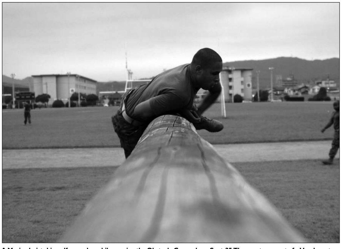
A Marine hoists himself over a log while running the Obstacle Course here Sept. 25. The event was part of a Headquarters and Headquarters Squadron unit physical training session.

Headquarters and Headquarters Squadron warriors build camaraderie, endurance during unit physical training