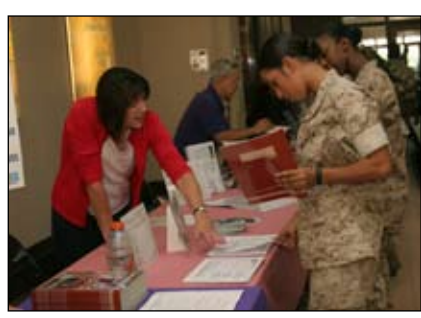
Representatives showcase the benefits of college to Marines during the 2008 College Fair at the Crossroads Mall here Aug. 22.