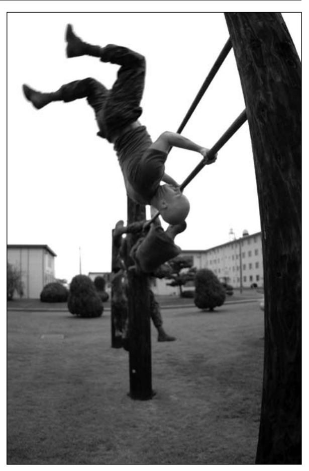
Service members from Headquarters and Headquarters Squadron negotiate the Obstacle Course here Sept. 25.

Bottom line — an effective OPSEC posture is everyone's responsibility.