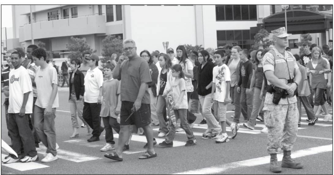
Approximately 750 students and faculty members of Matthew C. Perry Schools here participated in an evacuation drill Sept. 23. Children safely moved to the parking lots of the Kintai Inn and Club Iwakuni for student accountability.

yahoo.com. For more information on the machine, visit http://www.bowflex.com.