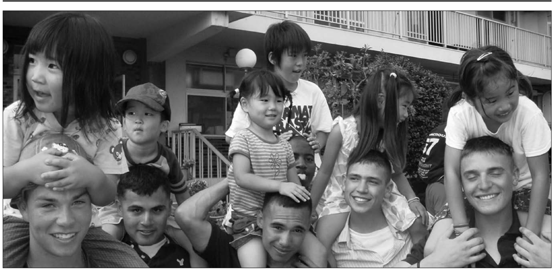
Combat Assault Battalion Marines from 3rd Marine Division interact with local children during their visit to the Shin-sen Orphanage Sept. 14 near the conclusion of an exercise at Camp Fuii.