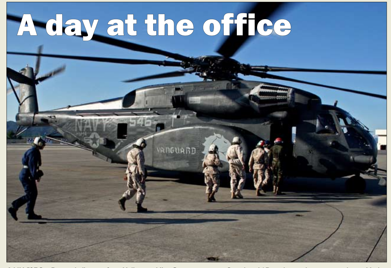
A MH-53E Sea Dragon helicopter from Helicopter Mine Countermeasures Squadron 14 Detachment 1 prepares to depart Marine Corps Air Station Iwakuni on a familiarization flight Oct. 1. Marines and sailors from various station units had the opportunity to experience the aircraft's capabilities during the afternoon flight.

Please submit questions in advance by dropping them off at the Town Hall drop box at the Commissary, sending them via e-mail at iwakuni.pao@usmc.mil, by calling the Public Affairs Office at 253-5551, or by using the Interactive Customer Evaluation (ICE) Web site.