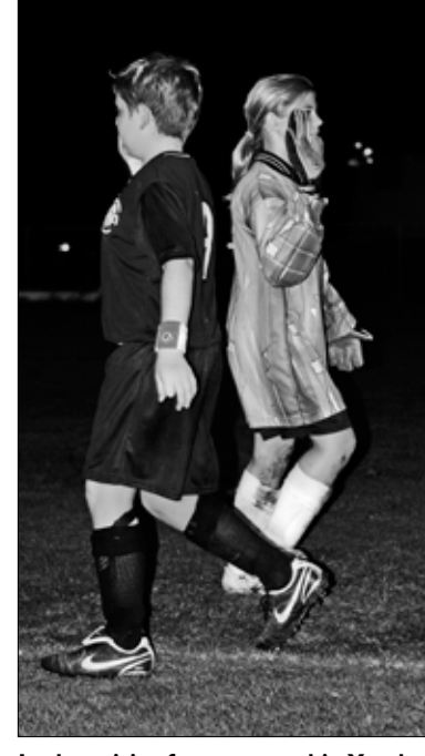
In the spirit of sportsmanship, Youth Soccer teams Nitro and the Roughnecks congratulate each other after a hard fought battle at Penny Lake field here Tuesday.

Collasping on the ball, the Strikers are able to stave off Strike Force's attempt to score during a Youth Soccer League game at Penny Lake Field here Tuesday. Both teams fought fiercely throughout the game for control using the skills their coaches had taught them during practice. The Youth Soccer season has almost come to an end with the doubl ation tournament scheduled to begin Oct. 18.