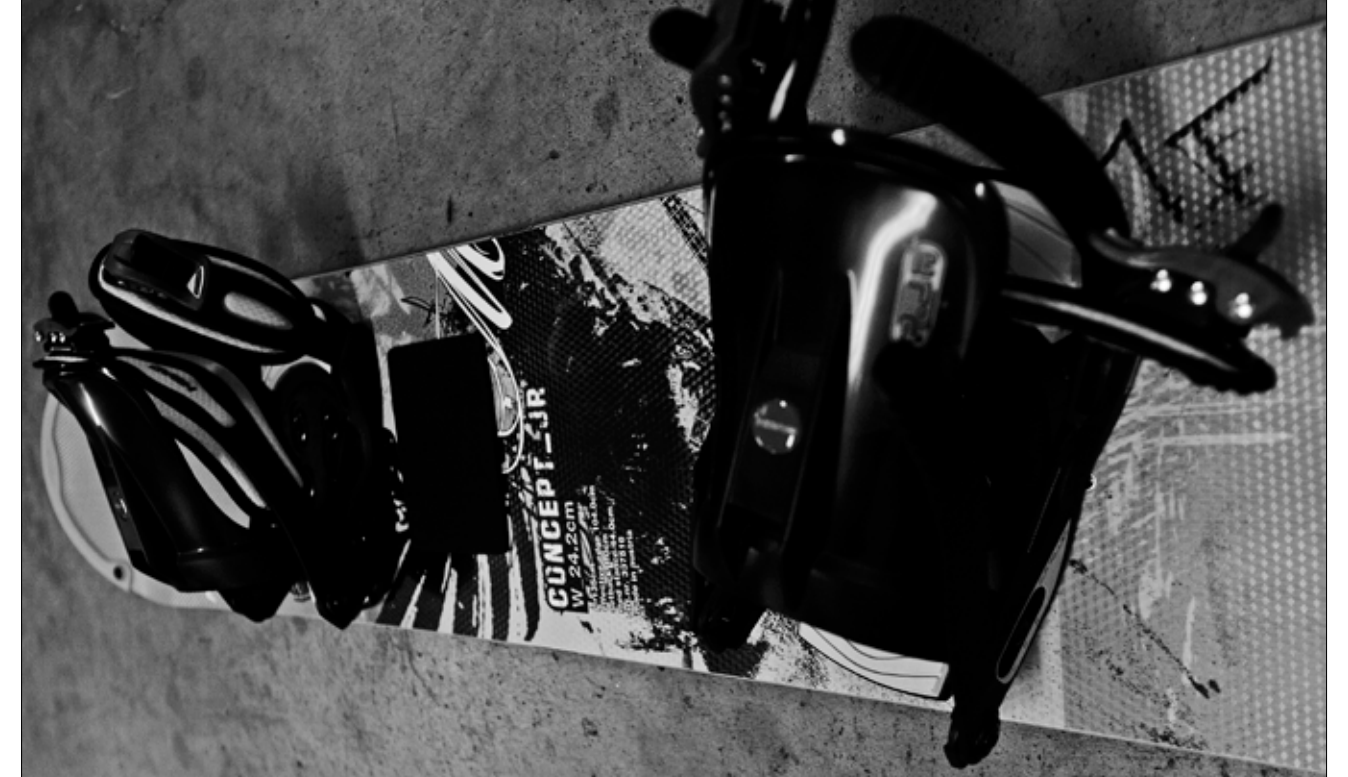
boards, boots and safety gear are all available for check out at gear issue. Check out is generally a two-day agreement, but gear issue plans to allow items like skis, snowboards and related safety equipment to be checkd out for the weekend. Although at present there are no trips planned by Outdoor Recreation, the intent is to have outings with lessons.

2. Details concerning locations and times of OPSEC is keeping potential adversarunit deployments. ies from discovering critical Department of 3. Personnel transactions that occur in large Defense information. As the name suggests, numbers. it protects U. S. operations — planned, in 4. References to trends in unit morale or progress and those completed. Success personnel problems. depends on secrecy, so the military can 5. Details concerning security procedures. accomplish the mission more quickly and Puzzle Pieces with less risk. Enemies of freedom want this By being military family member,