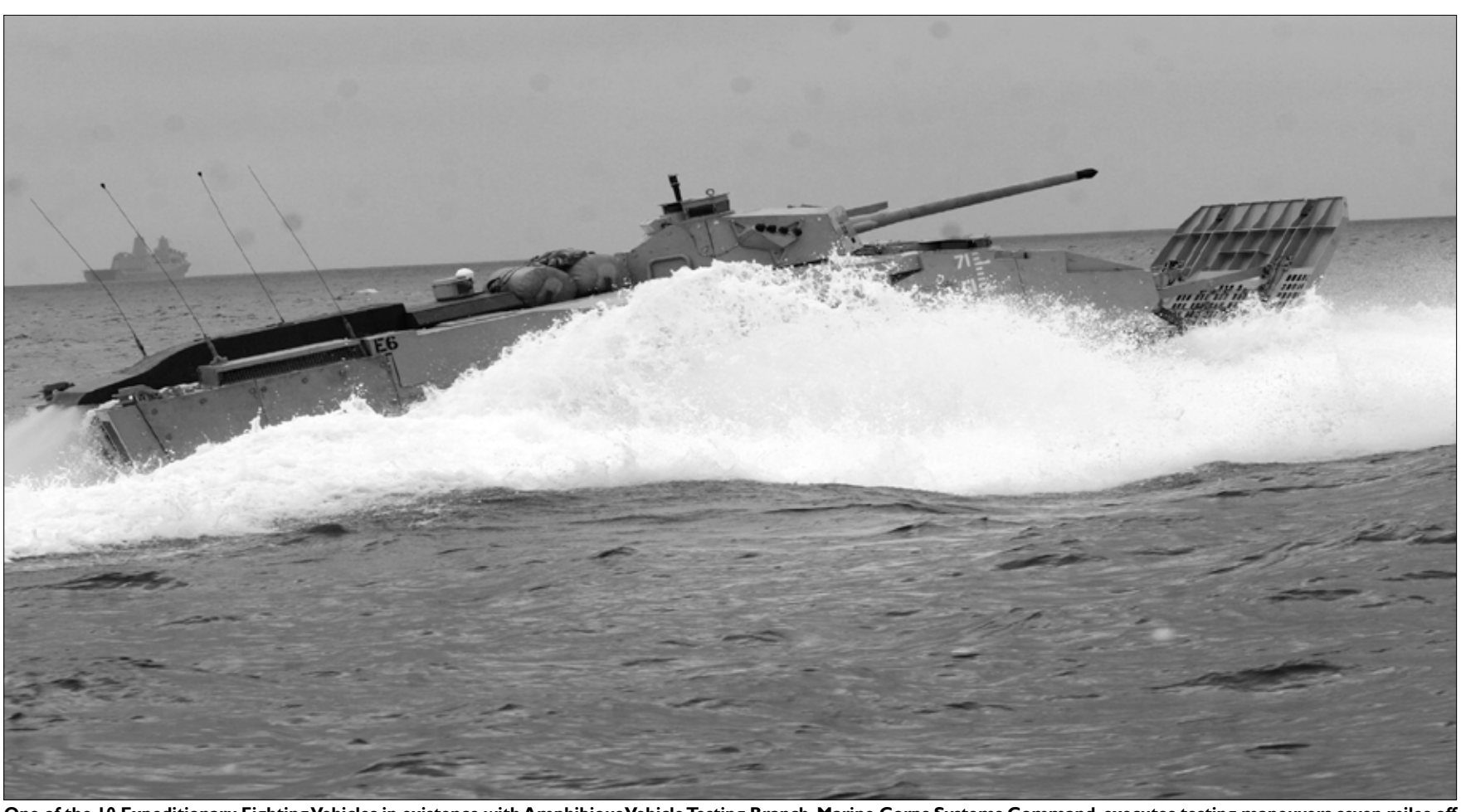
One of the 10 Expeditionary Fighting Vehicles in existence with Amphibious Vehicle Testing Branch, Marine Corps Systems Command, executes testing maneuvers seven miles of the coast of Marine Corps Base Camp Pendleton, Calif.