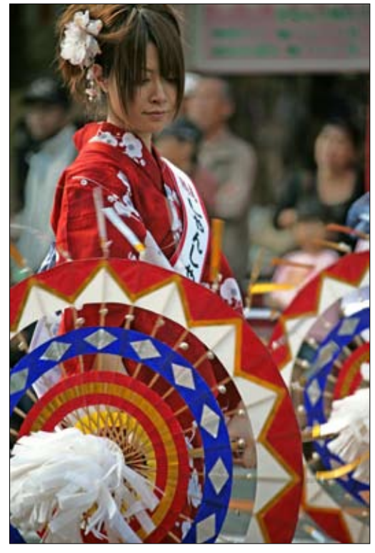
With intricate and brilliant design, a yukata-wearing, umbrella-twirling Japanese dancer parades down the main road of Iwakuni City with precision to the standards of the Silent Drill Platoon during the Iwakuni Festival Oct. 19.