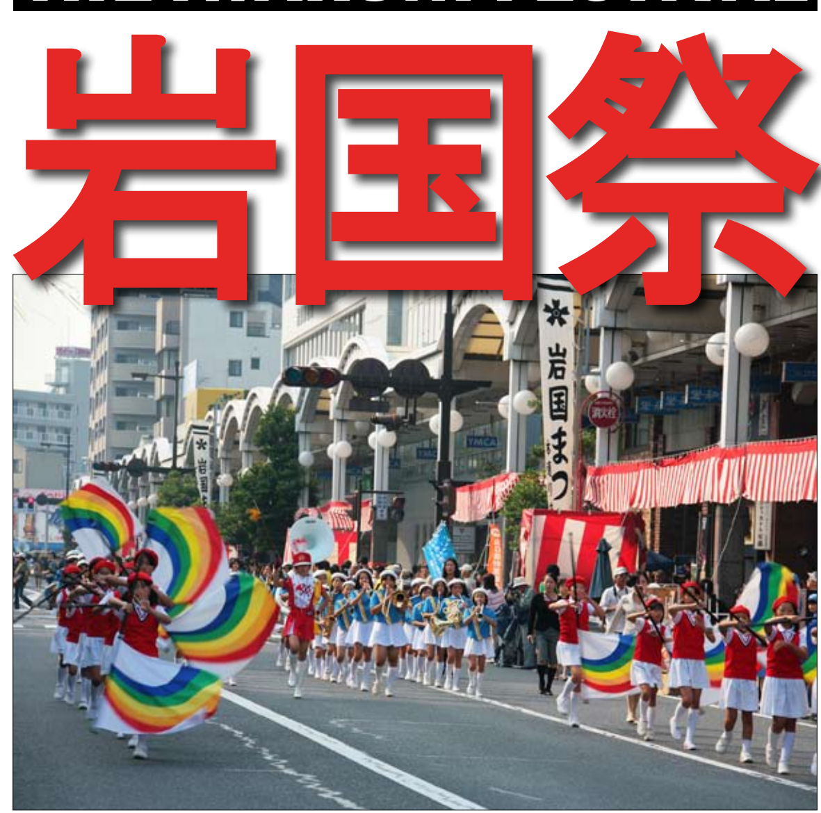
School marching bands parade down Iwakuni City's main road during the annual Iwakuni Festival Oct. 19. The groups that perform during the event aren't just from Iwakuni. Surrounding prefectures make the commute just to strut their stuff. The festival features more than 50 different schools from the region.