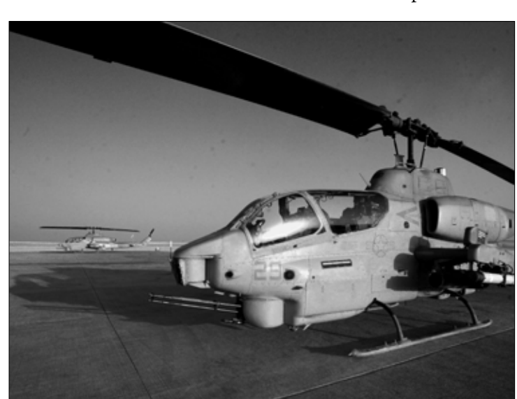
An AH-IW Super Cobra assigned to Marine Light Attack Helicopter Squadron 269 waits on the Camp Bastion flight line to provide support to Task Force 2d Battalion, 7th Marine Regiment, Special Purpose Marine Air Ground Task Force Afghanistan, Sept. 30.