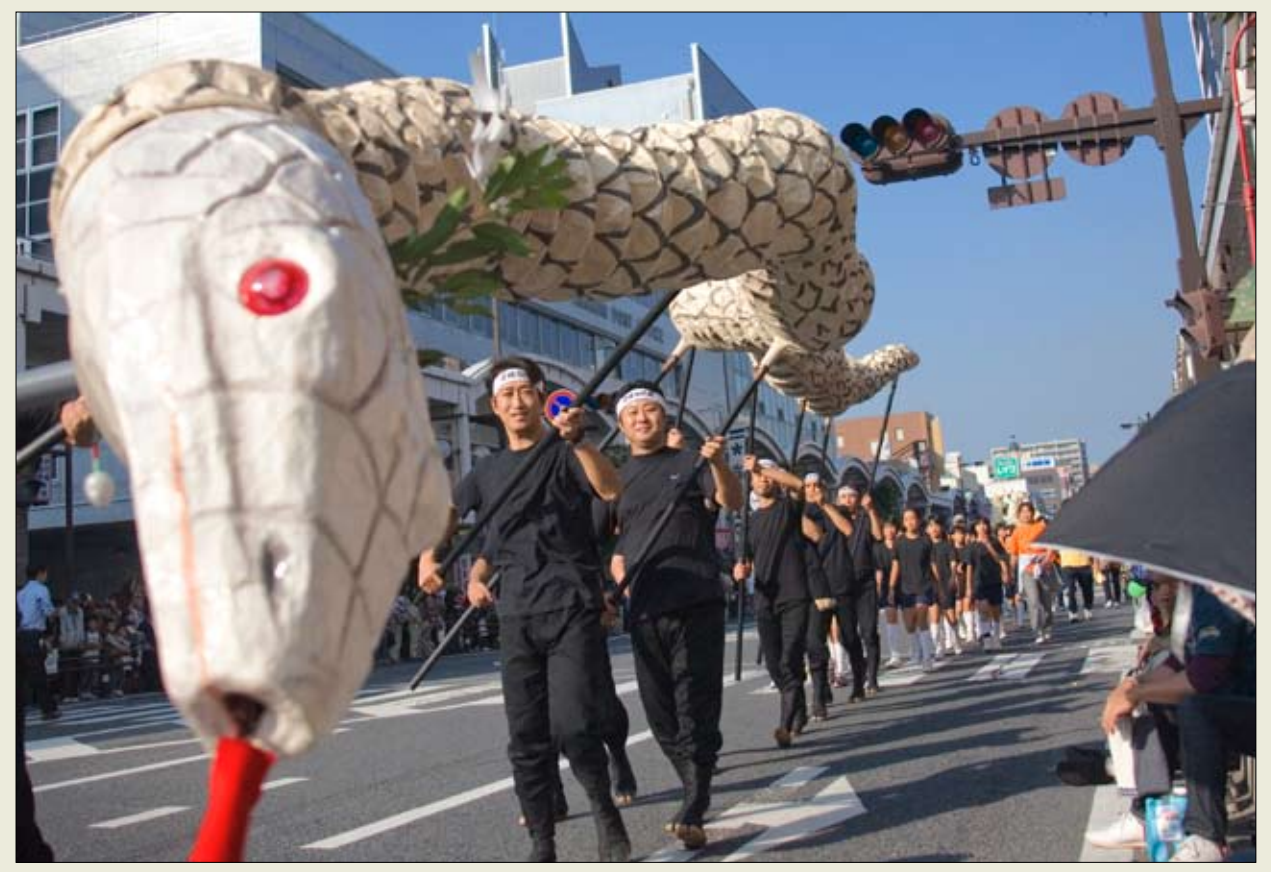
Japanese snake dancers emulate the natural movement of the white snake, a creature unique to the Iwakuni area long told to possess the soul of a god, at the 52nd annual Iwakuni Festival Oct. 19. The dancers paraded down the street as done every second Sunday of October, giving locals a chance to join in the festivities. Read the full story on page 6.