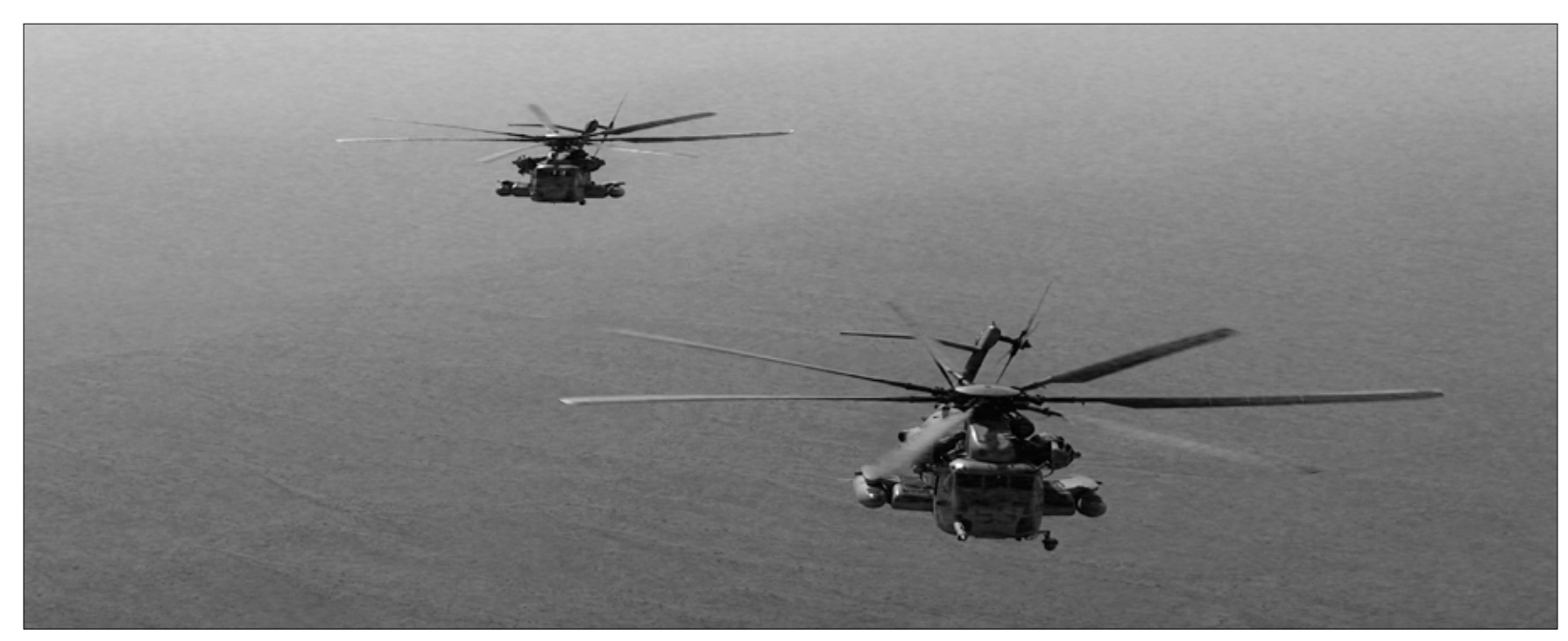
Two CH-53E Super Stallions fly through the skies of Afghanistan as part of the aviation combat element augmenting the Marines and sailors of Task Force 2/7 currently serving in