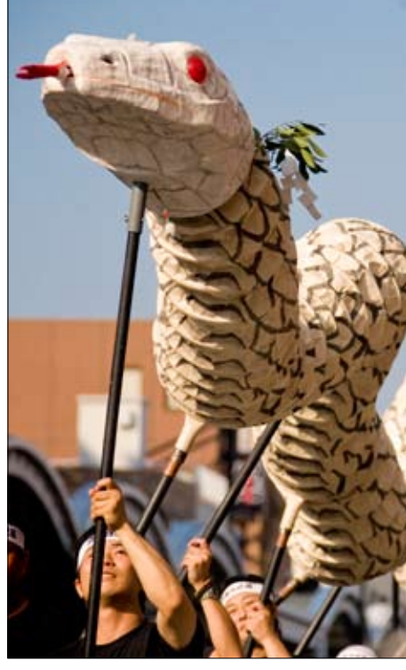
Touching the white snake is a Japanese tradition said to bring good luck. The snake is always a welcomed guest to Iwakuni festivals.