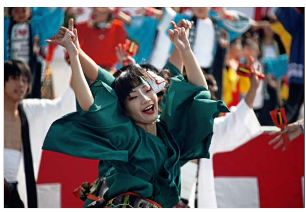
A Japanese lyrical dancer is caught up in the moment as music rumbles the earth on the Iwakuni Festival's main ground Oct. 19. Her dance company traveled here from Shimane Prefecture to perform five dance routines at the event.