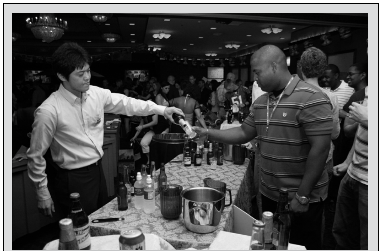
More than 200 station residents and their guests participate in the annual Beer Fest here Oct. 18. The event, held in the Club Iwakuni Ballroom, was sold out. Beer enthusiasts circled the ballroom tasting hundreds of various beverages.

Call your chaplain or friend who can help you get ready, because you can't miss the last deadline.