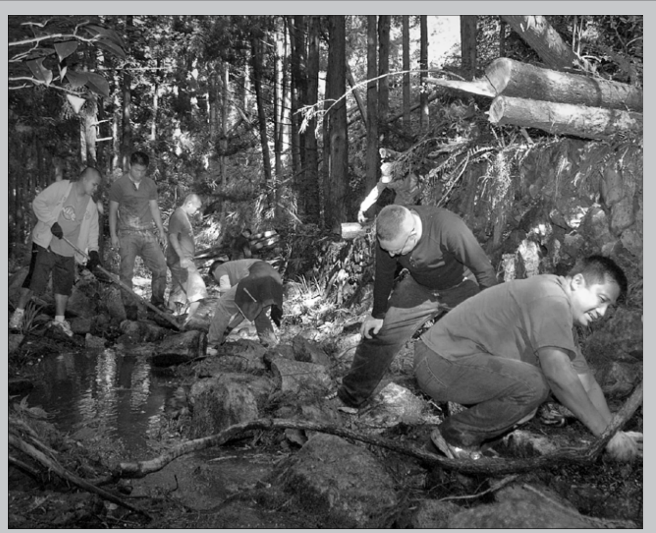
Station Filipino-American Society members clean a mountain stream adjacent to a highway in Iwakuni City Nov. I. At least two hours of work was spent removing hewn logs in the riverbank and the brush that dammed up the flow.

Yet, most of us, it seems, at least much of the time, are incapable of undergoing this revolutionary experience. And the reason for this is simple: Whatever life is about, it can't be about either my agenda or me. To the extent that I try to make it be so, I render myself incapable of experiencing life as it really is, a gratuitous, undeserved act of generosity.