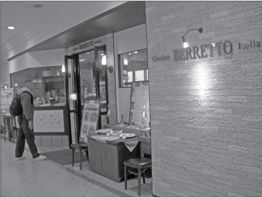
The entrance of the Cucina Italiano Berretto. Past its doors is a relaxing atmosphere and scents of grilled spices permeating the air.

Hidden in a small corner of the 11th floor in the Fukuya Department Store at 9-1 Matsubara Hiroshima, rising high above the city skyline is the rustic Italian-stylized restaurant, Cucina Italiano Berretto. Stepping past its doors into its alcove, one is immediately surrounded by the harmonized scents of sweet bell peppers and Italian spices with hints of garlic cooking on the grill. Any feeling of agitation or apprehension the day may have given you will disappear as the hostess seats you before a window spanning a side of the restaurant with a grand view of the city of Hiroshima below and its forest-covered mountains in the distance. While the well lit floor and low tunes of Japanese and American R&B is in slight contrast to the atmosphere the Berretto tries to present, it becomes balanced out by the low whispers the setting inspires along with the welcoming feeling the staff conveys. The menu set at the table, which the waitress may have to interpret, reads in Japanese with a few Italian words and consists of fresh