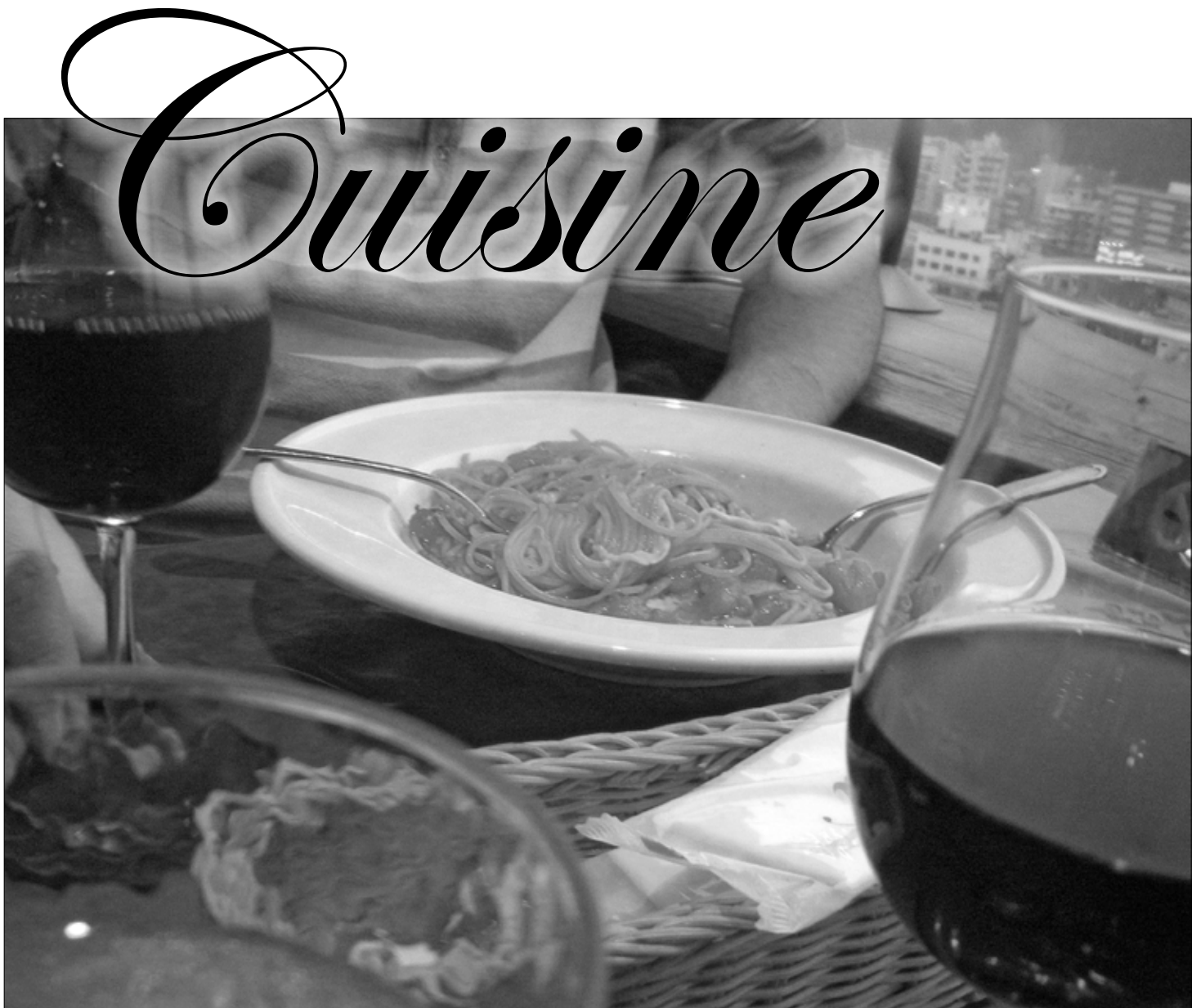
The pasta served at the Cucina Italiano Berretto. It leaves a lingering taste on your tounge infused with garlic, cheese, spices and bacon.