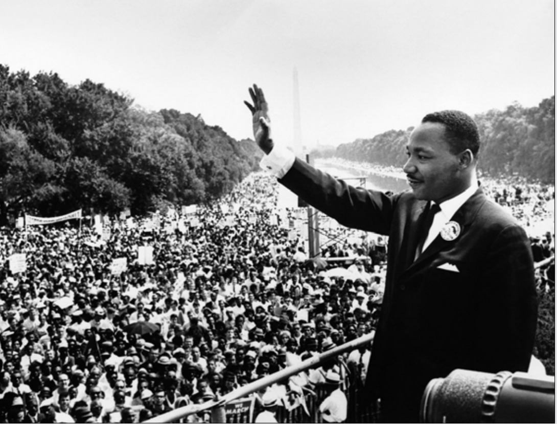
Martin Luther King Jr. addresses a crowd from the steps of the Lincoln Memorial where he delivered his famous, "I Have a Dream," speech during the Aug. 28, 1963, march on Washington, D.C.