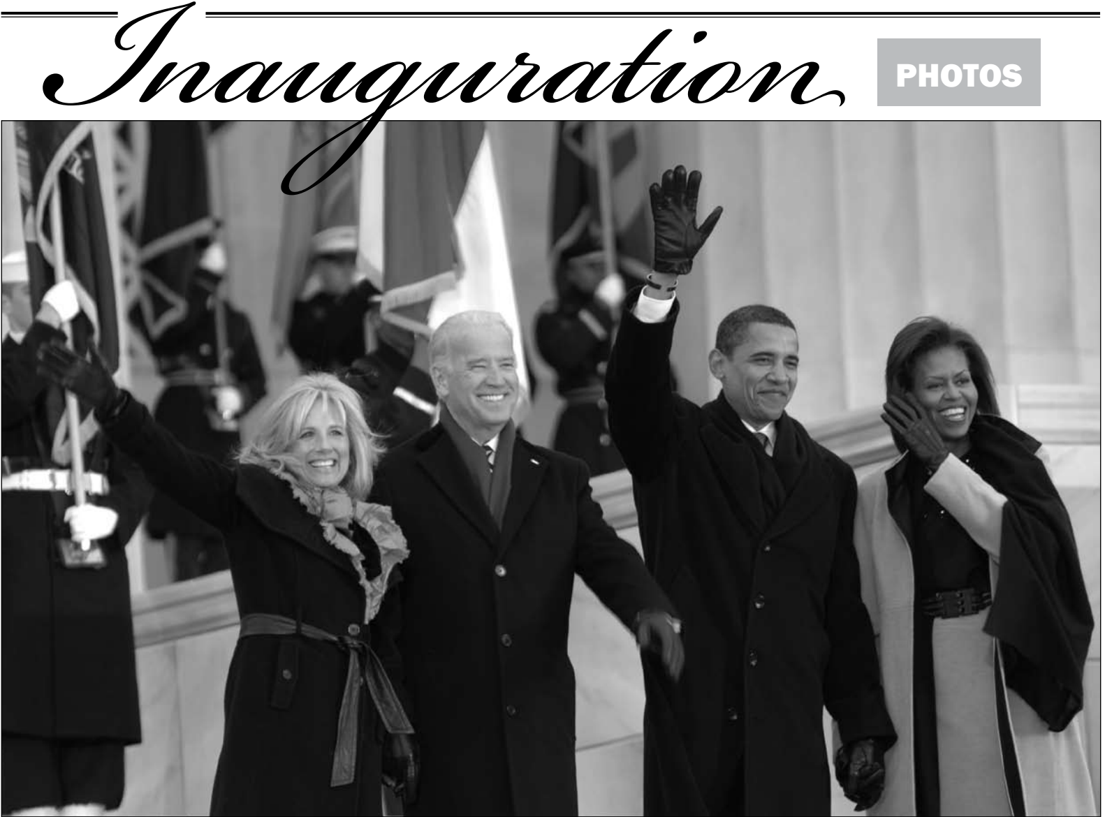
GREETING THE CROWD — (From Left) Jili Biden, Vice President-elect Joe Biden, President-elect Barack Obama, and Michelle Obama wave to the crowd during inaugural opening ceremonies at the Lincoln Memorial on the National Mall in Washington, D.C., Jan. 18. More than 5,000 men and women in uniform are providing military ceremonial support to the presidential inauguration, a tradition dating back to George Washington's 1789 inauguration.