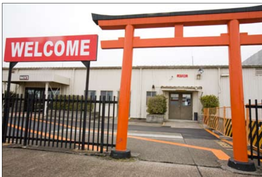
The torii behind the station air terminal welcomes those who pass through it to Iwakuni. On April 2, the torii will welcome back the Patriot Express and its service to Iwakuni.

The following day, the Patriot Express will return to Seattle via