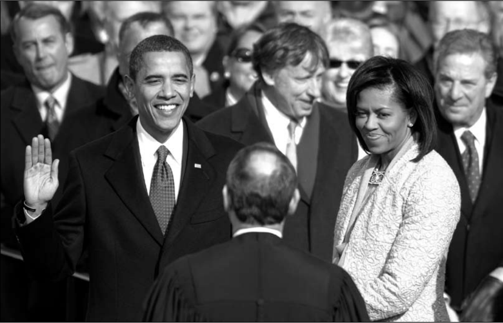
TAKING THE OATH — Barack Obama is sworn in as the 44th president of the United States by Chief Justice of the United States John G. Roberts Jr. in Washington, D.C., Jan. 20. Obama's wife Michelle stands by his side.

"As I take the sacred oath of the highest office in the land, I am humbled by the responsibility placed upon my shoulders, renewed by the courage and decency of the American people, and fortified by my faith in an awesome God." Barack Obama, 44th President of the United States of America