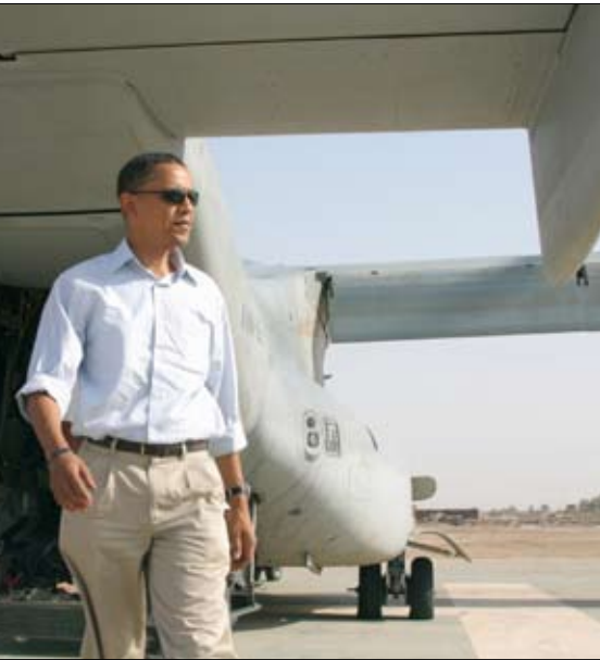
RAMADI, Iraq — Then-senator Barack Obama exits an MV-22 Osprey during the congressional delegates visit to al Anbar Province, Iraq in July 2008. Marine Medium Tiltrotor Squadron 162, Marine Aircraft Group 16, 3rd Marine Aircraft Wing (Forward), transported Obama and other senators to several stops throughout the province.

of four. He led his march on Washington with more than a quarter million people, befriended President John F. Kennedy and Mahatma Gandhi. He became the heart and soul of all minorities in America and stood up against injustice and violence. He was eventually assassinated for what he stood for. All this happened before his 40th birthday. In the end, it is men like Martin Luther King Jr. who cannot die. He is alive to us in memory as he was in flesh and blood. Every year service members observe a 96-hour holiday in his honor, school children learn of him in their textbooks and his spoken words echo in eternity.