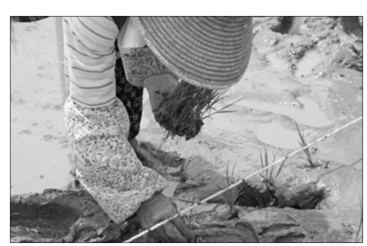
ers line up and down the rice patty with Japan nts during a Youth Cultural Program rice-planting trip in Tenno June 12. The white rope had red hash