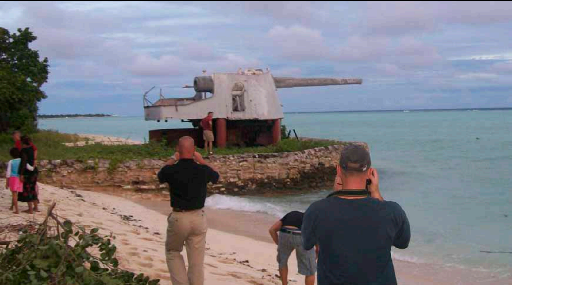
Iwakuni Marines photograph a coastal artillery gun on Tarawa Aug. 8 during their island-hop trip. The nine Marines were afforded the chance of a lifetime experience to witness firsthand what was left of seven historic battle sites including Saipan, Guadalcanal, Tarawa, Peleliu, Guam and Iwo To, formerly known as Iwo Jima.