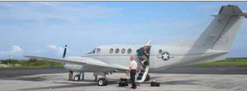
Marines stop off at Truk Atoll in the C-12 they used throughout the entire 11-day trip. The Marines covered 10,409 miles using 6,500 gallons of fuel in 11 days during their trip.