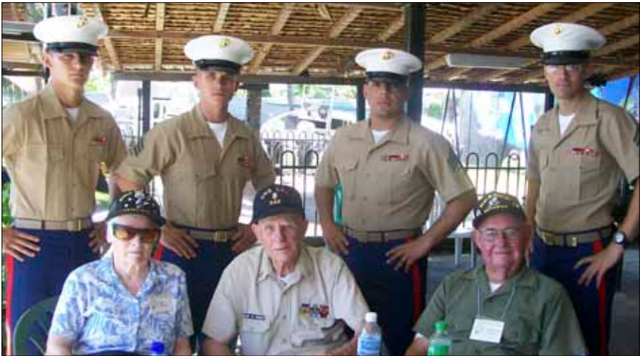
Iwakuni Marines pose for a picture with World War II veterans while visiting Guadalcanal Aug. 6 during their island-hop trip. The Iwakuni Marines traveled to 10 islands across the Pacific to commemorate the 67th anniversary of Guadalcanal.