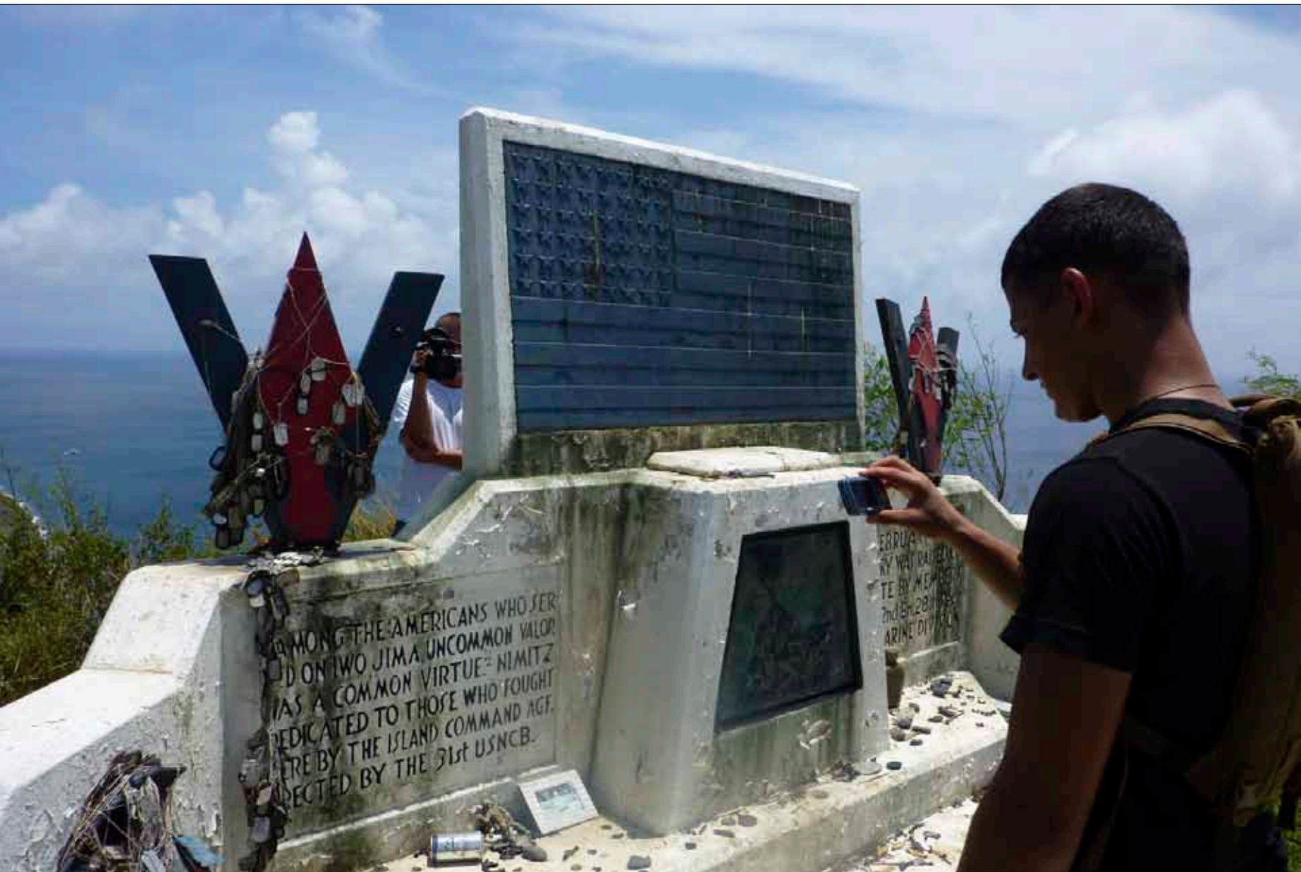
An Iwakuni-based Marine photographs a memorial constructed on Iwo To, formerly known as Iwo Jima, Aug 13 during their island hop trip. Iwakuni Marines embarked on an 11-day expedition Aug. 3 to various locations across the Pacific to commemorate the Marine Corps 67th anniversary of World War II's Guadalcanal Campaign.