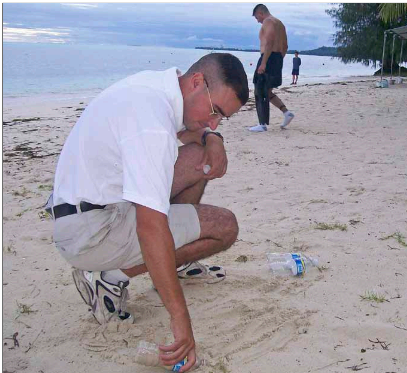
An island hopper scoops sand into a bottle from the beach on Saipan Aug. 5 during the island-hopping trip. Nine Marines had the opportunity to journey to seven historic battle sites including Saipan, Guadalcanal, Tarawa, Peleliu, Guam and Iwo To, formerly known as Iwo Jima. Read the full story on pages 6 & 7.

Mama mia! Italian meal wins chef top honors