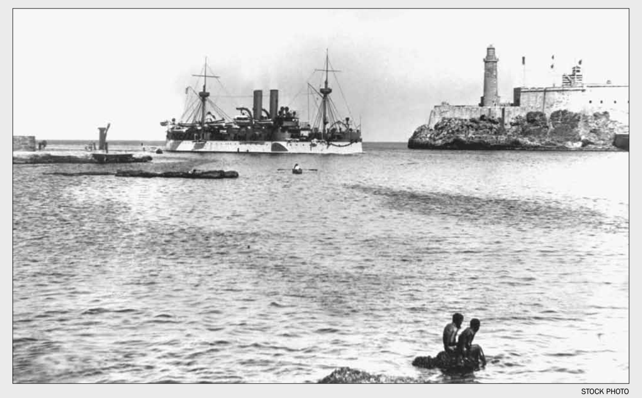
ring Havana Harbor, Cuba, on Jan. 25, 1898, where the ship would explode three weeks later.

Feb. 15, 1898: 28 Marines and 232 seamen lost their lives when the battleship USS Maine was mysteriously sunk by an explosion in the harbor of Havana, Cuba. Though no definitive evidence linked the Spanish with the sinking, the cry went up, "Remember the Maine!", and by late April, the U.S. and Spain were at war.