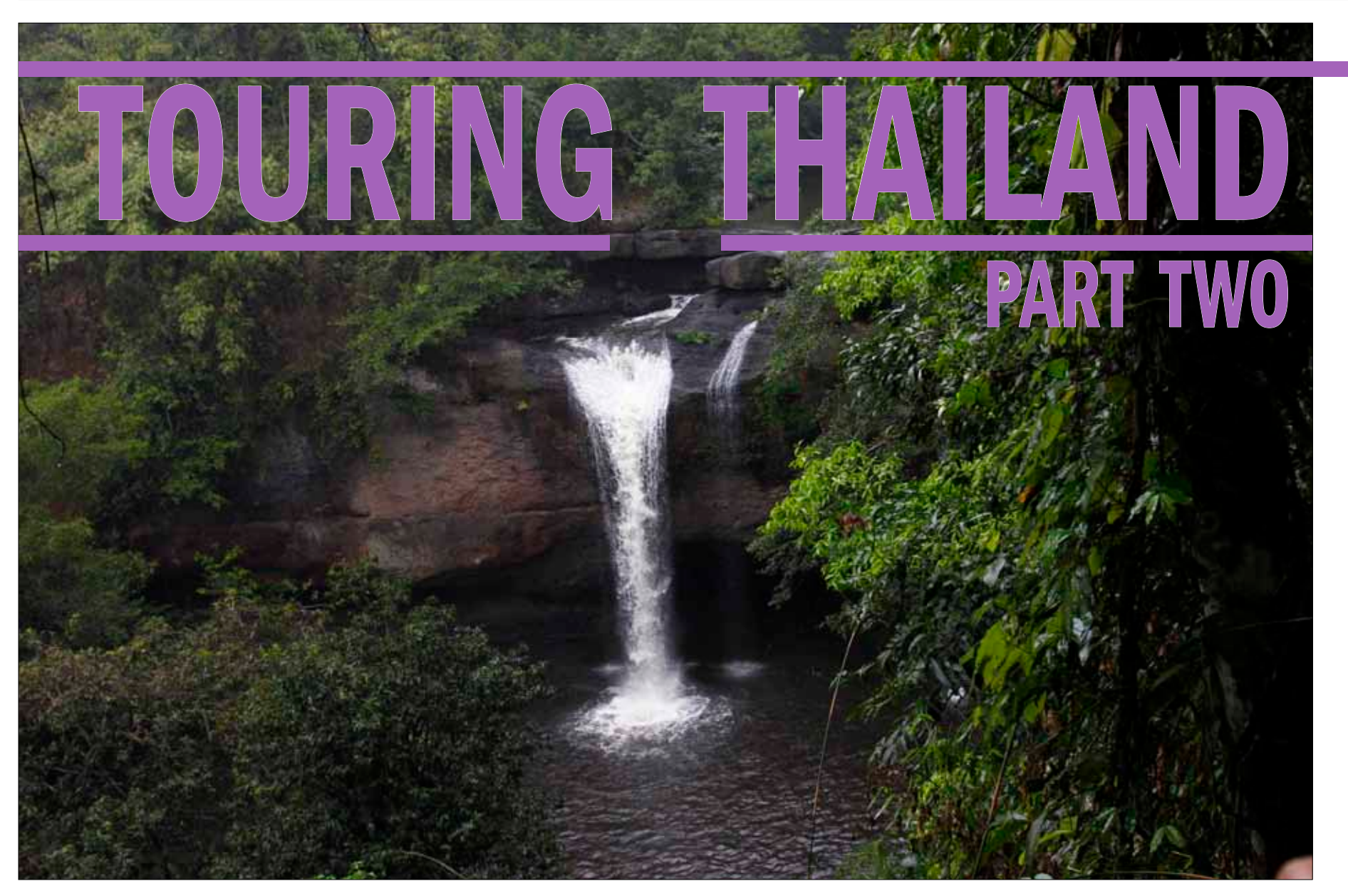
A view of the Haew Suwat Waterfalls in the Khao Yai National Park in Thailand. The Marines were allowed to hike to the bottom of the waterfall to take pictures and explore the jungle during the Single Marine Program trip to the Khao Yai National Park Jan. 24.