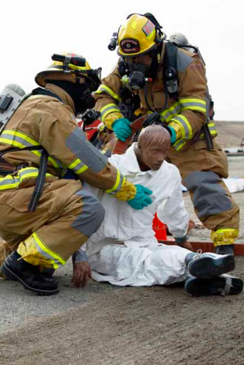
Two station firefighters decontaminate a chemically contaminated civilian casualty during an Exercise Total Shield 2010 scenario on the northwest sector of the station Feb. 25. The scenario tested the station's reaction to a chemical attack.

"In the past half century, we recognized the differences between our two armed forces, made compromises and accomplished our missions, said Ide. "Mutual understanding at the unit level requires constant work; therefore, I consider this exercise important not only to improve our security capabilities but also as a great opportunity to reinforce mutual understanding. and I do think there is a definite need to continue this exercise in the future.