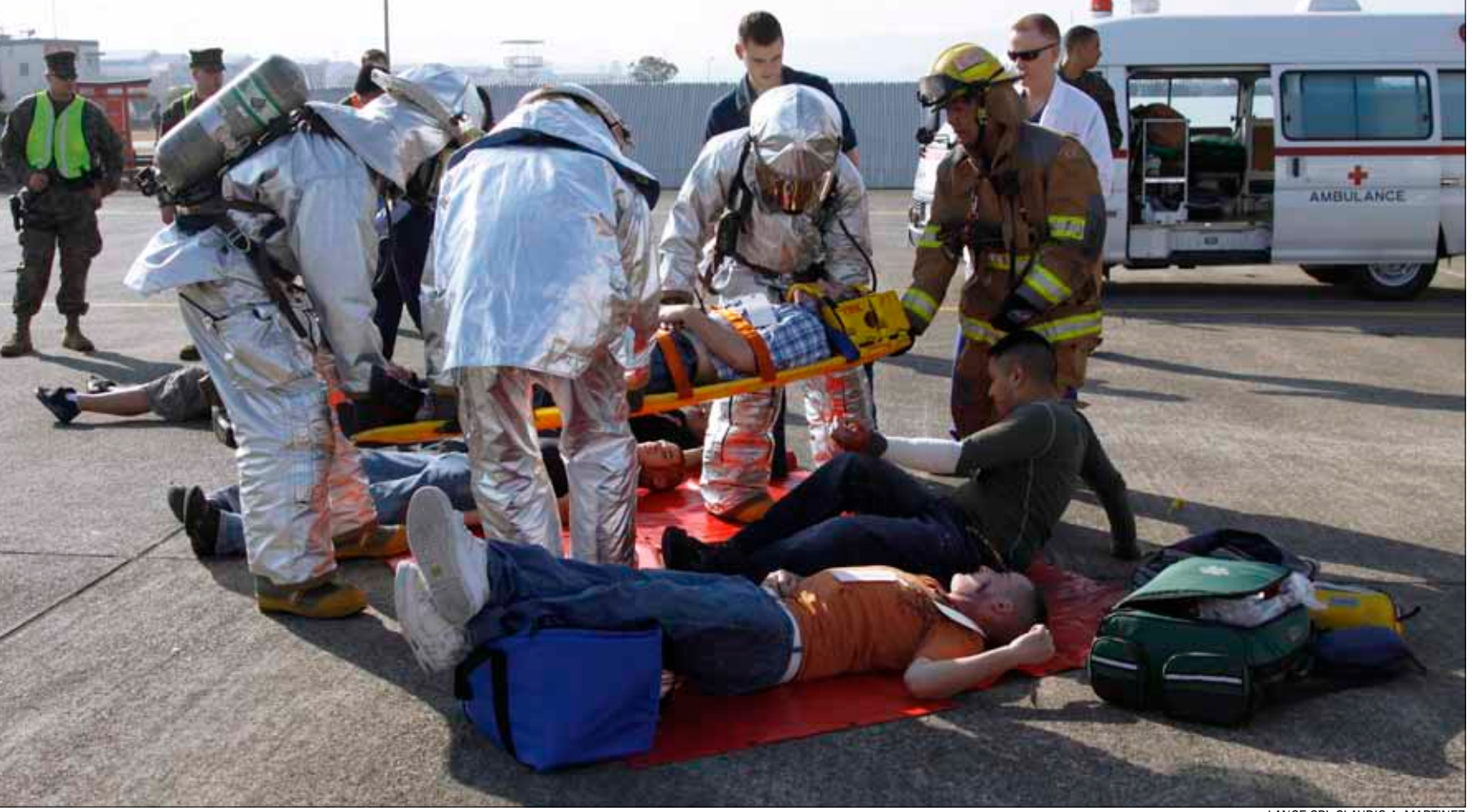
Aircraft rescue firefighters, station firefighters and Robert M. Casey Medical and Dental Clinicservice members work together to save the lives of injured civilians and service members during an Exercise Total Shield 2010 scenario at the flight line here Feb. 24. The scenario was one of many during the exercise which was designed to test the station's ability to defend itself against terrorist attacks while successfully continuing