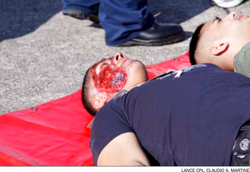
2010 mass-casualty scenario at the flight line here Feb. 24. The scenario, which involved a simulated ed aircraft on the flight line, tested the reaction time and effective response of emergency units