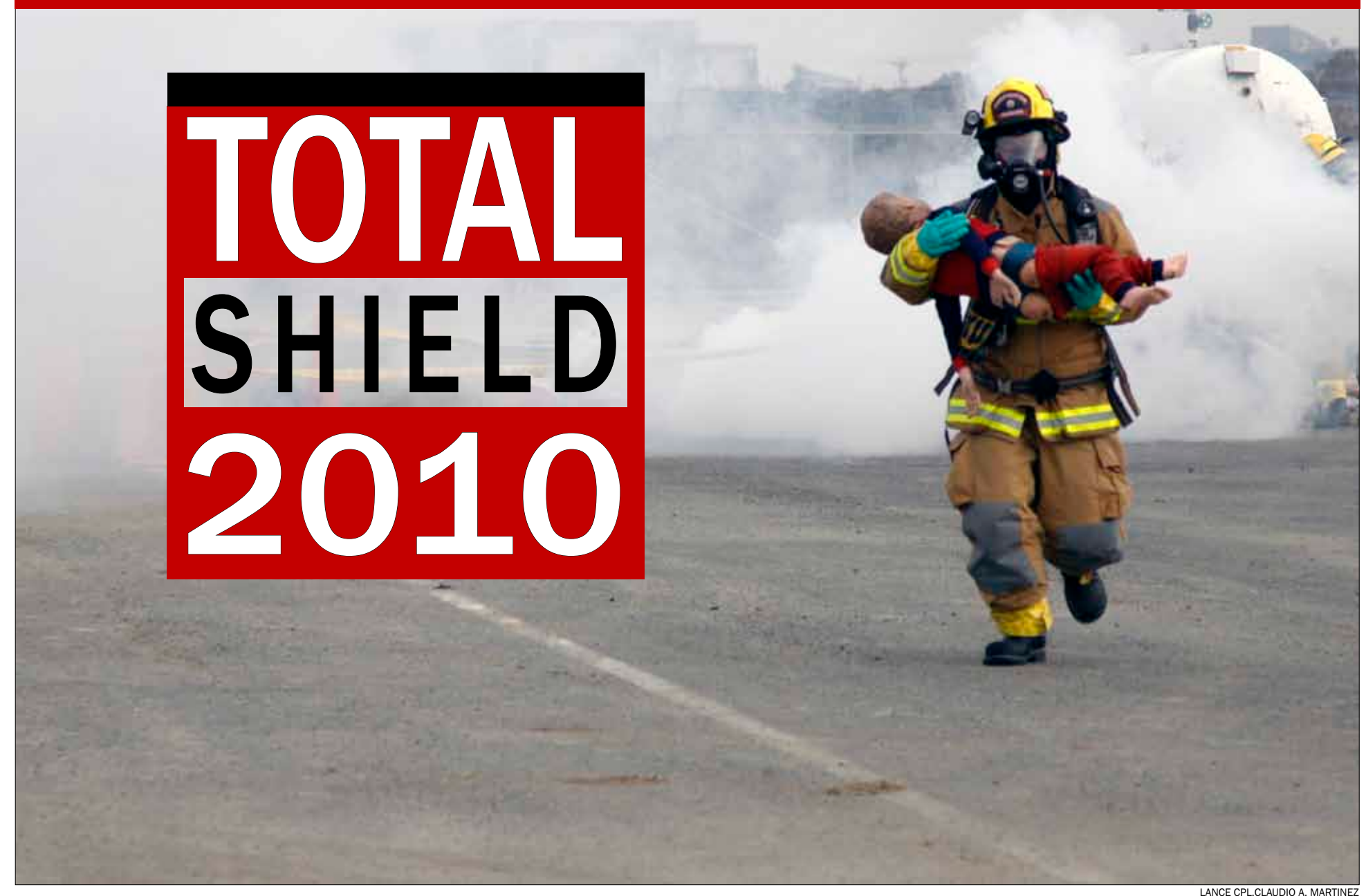
A station firefighter carries a dummy child away from a chemically contaminated area on the northwest sector of the station during an Exercise Total Shield 2010 scenario Feb. 25. Plastic dummies and a smoke machine were used during the