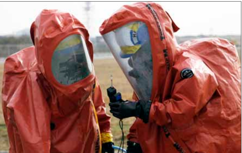
Two station firefighters clad in anti-chemical and biological suits test the air quality of a "chemically contaminated" area on the northwest sector of the station during an Exercise Total Shield 2010 scenario Feb. 25. Marines and sailors around the station also suited up in their mis ar during the scenario in response to the simulated chemical attack