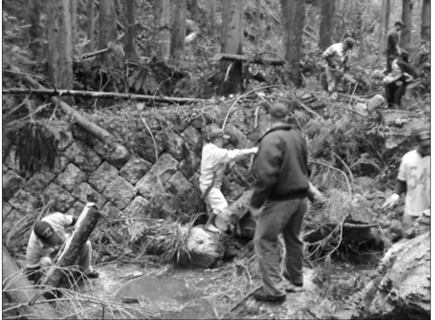
Six Japanese volunteers led by Katsuhiko Fujimori used chain saws to cut the trees blocking the flow of munity relations project March 1. The USS Rentz sailors ther

Most community relations projects, whether they involve cleaning up a stream; painting a building; or visiting orphanages, schools and hospitals; help foreign countries like our