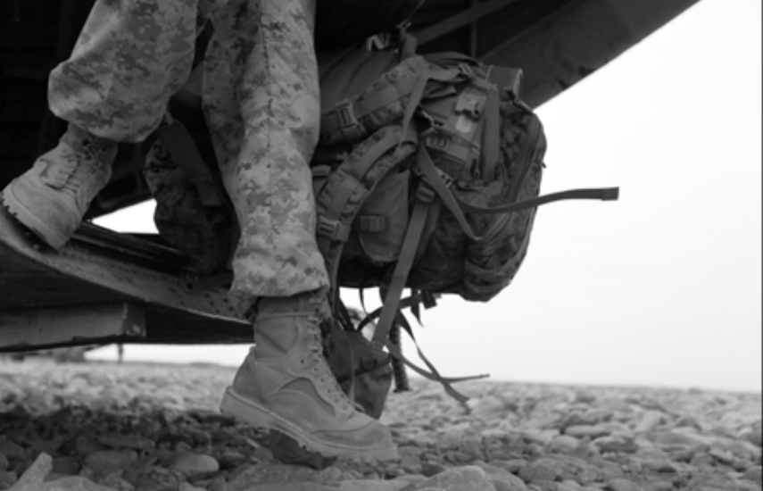
CAMP DELARAM II, Afghanistan - As the last Marine departs the CH-53 D, Regimental Combat Team 2 begins its 12-month deployment in Helmand province. The RCT provides support to its subordinate ns, enabling them to fight the enemy with every advantage.

not only wires the base for phone lines and computer connectivity, but ensures infantry battalions and artillery batteries have the same capabilities, according to