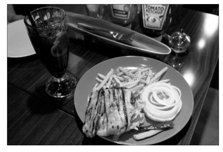
The bacon cheeseburger at Upper Café Diner New York, New York in Hiroshima. With a simple presentation, it surprises the senses with a savory taste you'll think about well after you finish.

You can find the Upper Café Diner New York, New York within the Hiroshima Namiki-dori shopping streets at 7-2 Fukuromachi Naka-Ku. Anyone who's been to New York will feel the city's vibe within this small open-spaced café. Although their bilingual menu changes from time to time, it's filled with a variety of salads, appetizers, pastas, meats, pizzas and desserts. You can also count on finding that full-flavored American gourmet burger you've been looking for. The American-like flavors and lively music beats in the background will take you back to New York City. With good-sized portions, the prices are on par with the taste and friendly service staff. Prices range from approximately \(\pm\)1,000 to \(\pm\)1,500 per dish. There is no non-smoking area.