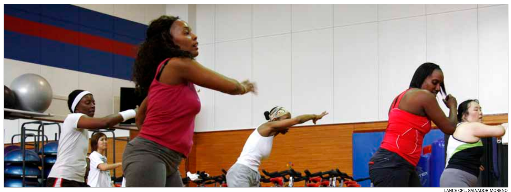
ives in sync to the beats of the music during the Zumba class held at the IronWorks Gym here March 3. Zumba is an aerobic fitness program with music based on salsa, meringue, cumbia, reggaeton, calypso, samba, African, cha cha, hip hop and other music.