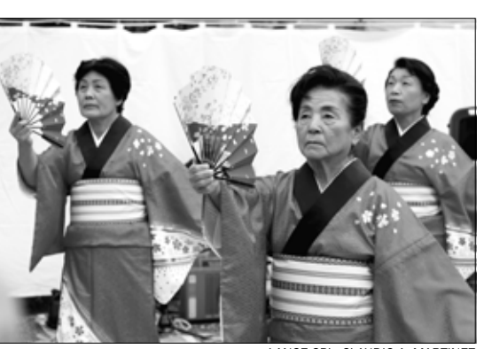
Local dancers put on a traditional dance performance in front of the

Tagata Shinto fertility shrine in Komaki, Japan during the Hounen Matsuri, or abundant year festival, March 15. Several musical nces take place in front of the shrine as part of the festival,