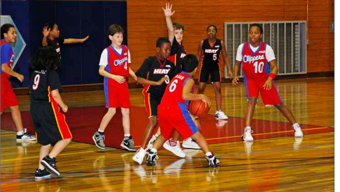
A player from the Clippers looks for an open teammate to pass and set up a shot during a youth basketball game at the IronWorks Gym here March 6. A total of 32 teams are ready for action with three cheer squads ready to cheer them on this season