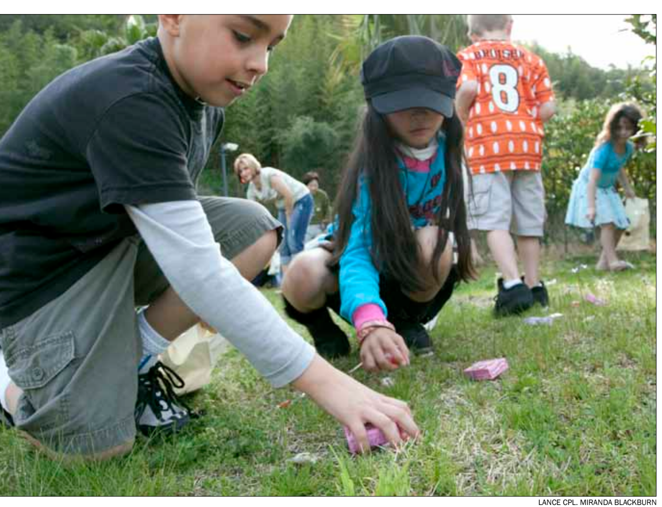
Children rush to pick up as much candy as they can during a treasure hunt at the 2010 Oshima Camp Meeting in Katazoe Saturday and Sunday. Later that evening, adults had their share of fun during the arm wrestling contest.

the campsite during the 2010 Oshima Camp Meeting in