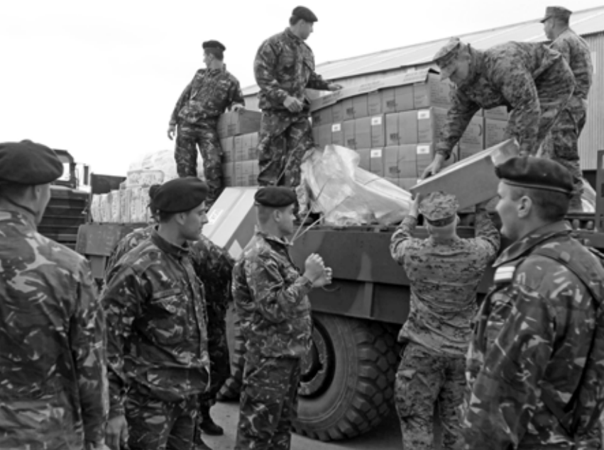
Training Area, Romania, May 17. Scout platoon, based out of Marine Corps Air-Ground Combat Center ynine palms, Calif., serves as the ground combat element of the Security Cooperation Marine Air-Ground Task Force deployed to Eastern Europe for Black Seas Rotational Force. The force is Marine Corps Forces Europe's commitment to a rotating presence of Marines in Eastern Europe to meet U.S. European and's theater security objectives.