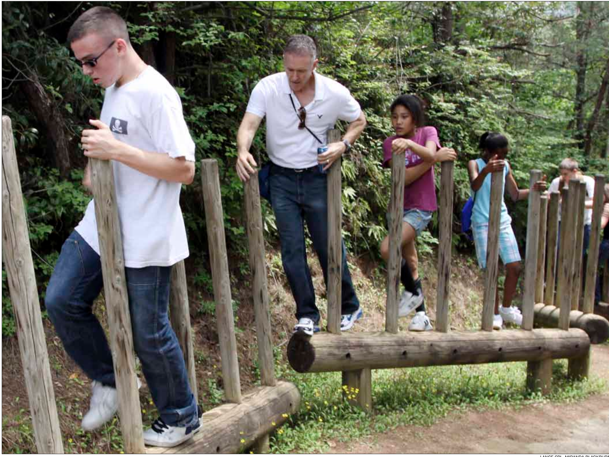
One team makes their way through one of the obstacles during the leadership retreat at Hachagamine Park Saturday. The Youth and Teen Center, adolescent substance abuse counselor and Marine Memorial Chapel provided this opportunity to teens from 7th to 12th grade. Marines and sailors from Marine Wing Support Squadron 171 and Combat Logistics Company 36 also volunteered for the event to act as mentors for the students and to make sure that the correct safety precaution