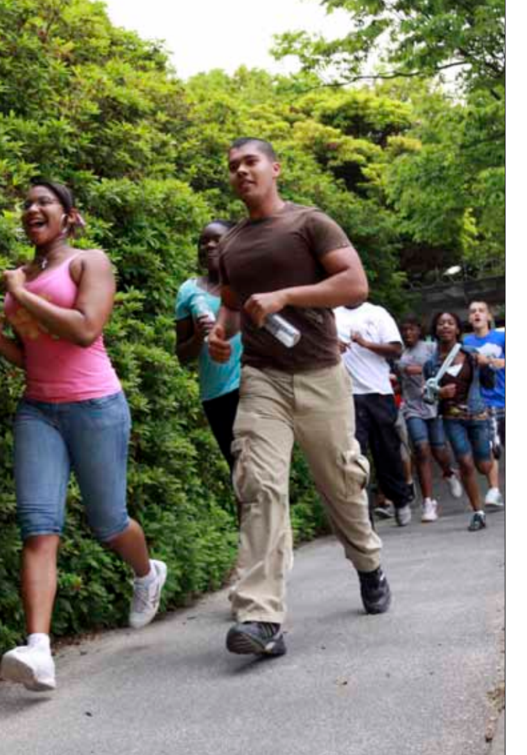
A team sings cadence as they run to the next obstacle during the leadership retreat at Hachagamine Park Saturday. The obstacle course was a timed event. During the second time through the course each team had an injured member, requiring each team to use