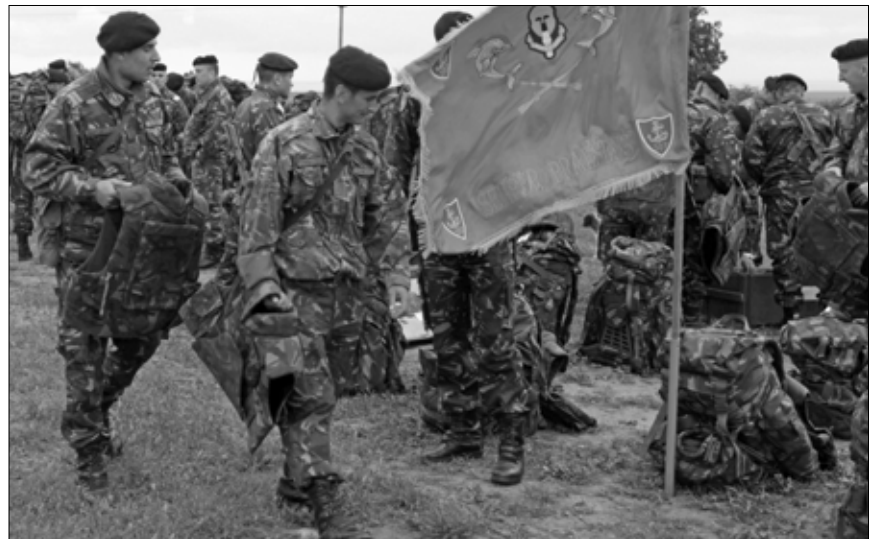
unload their gear after arriving at Babadag Training Area, Romania, May 17.