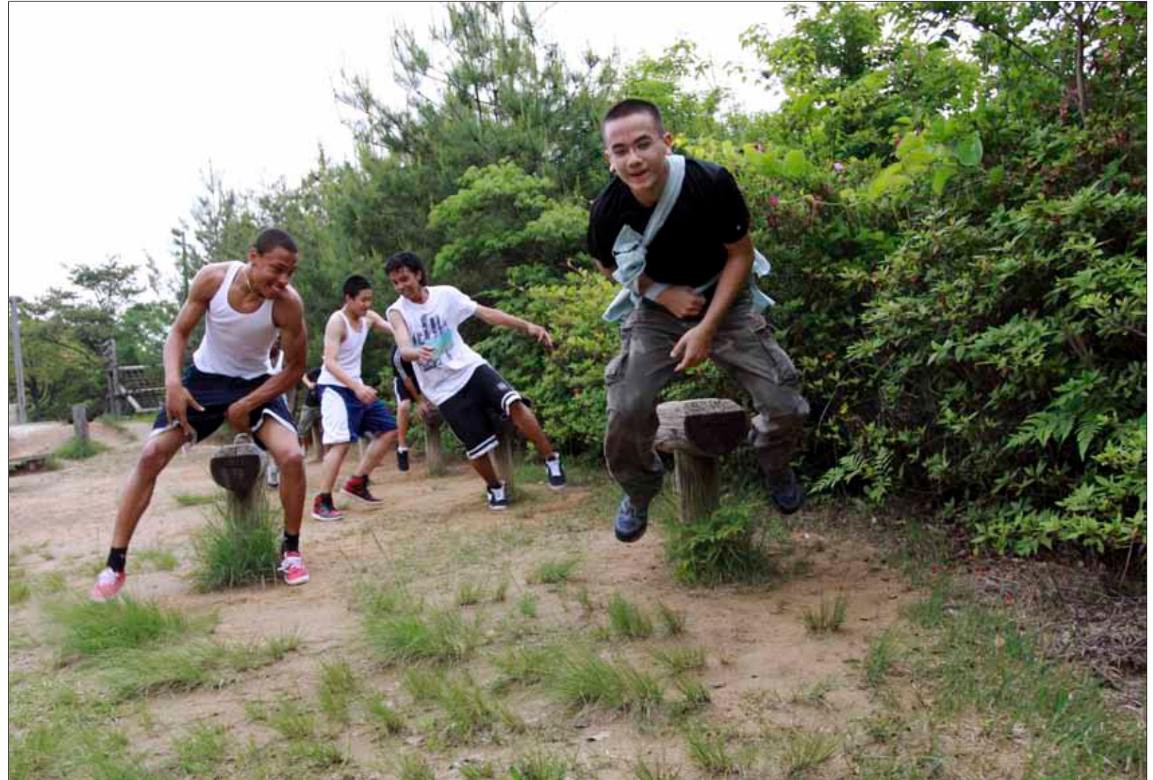
One of eight teams fly through the leapfrog portion of the obstacle course at the leadership retreat at Hachagai

After discussing how they performed throughout the course, the students were dismissed to enjoy the rest of their day at the park.