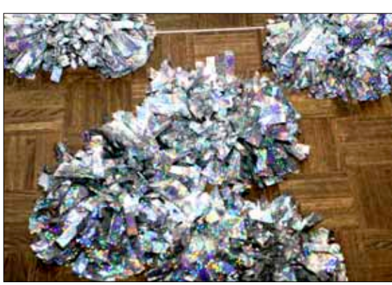
cheerleaders' performance included a country theme dance routine, a