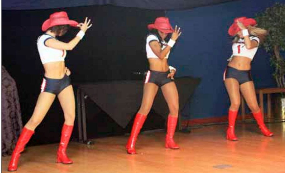
The Houston Texans cheerleaders perform a Texan style dance routine during their dance performance at the club lwakuni ballroom June 5. For this routine, the cheerleaders were cowboy hats and performed country style dances to