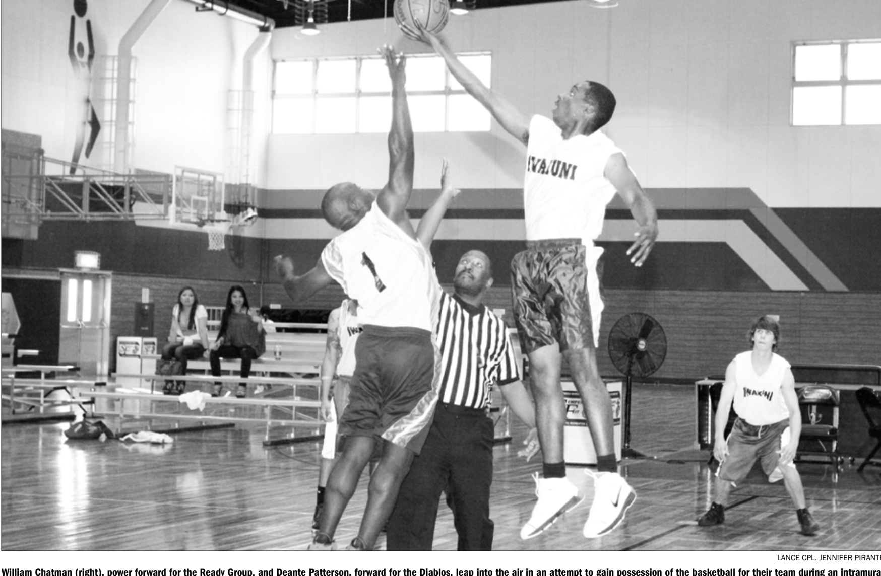
basketball game at the IronWorks Gym here June 2. The Ready Group lived up to their name as they defeated the Diablos 35-27.

Thank you all very much. God speed and Semper