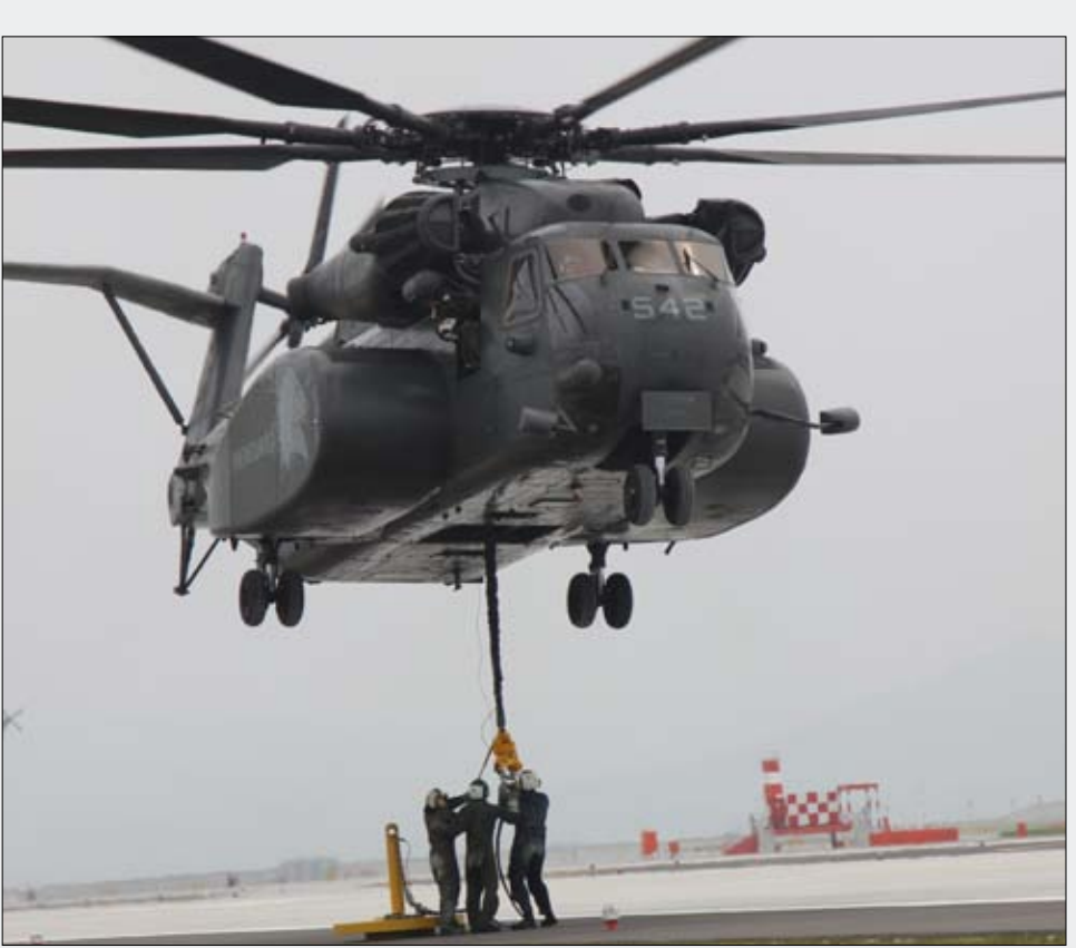
CPL. KRISTIN E. MORENO

Sailors with Helicopter Mine Countermeasures Squadron 14 Detachment 1 out of Pohang, Korea, hook simulated cargo onto an MH-53E Sea Dragon during an external vertical replenishment exercise at the airfield here July 8. The training was held here due to the lack of resources in Pohang.