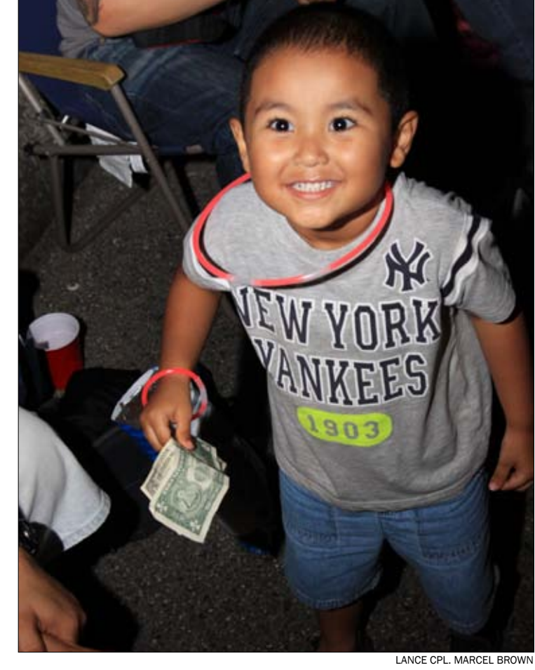
A young Japanese child smiles after receiving a dollar from his father during the 2010 dence Day fireworks display at Penny Lake, July 4