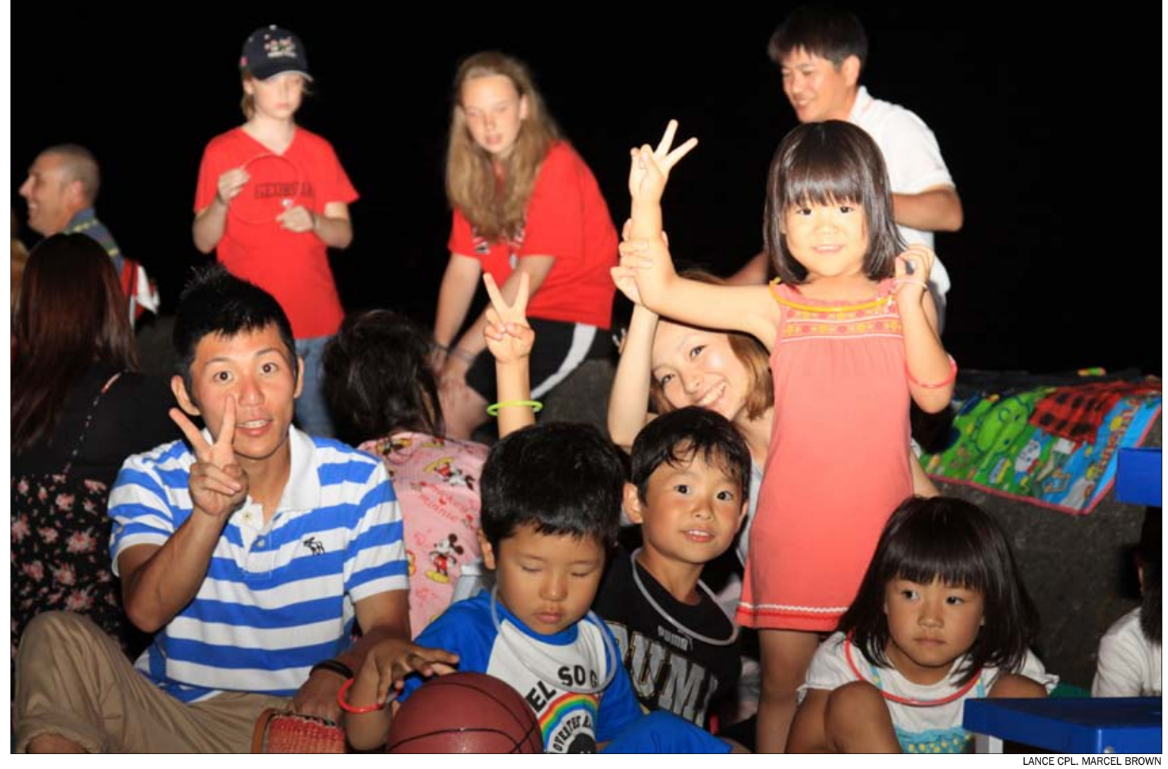
A Japanese civilian family poses for a picture during the 2010 Independence Day fireworks display at Penny Lake July 4. For the celebration of an American holiday, the attendance of Japanese spectators was ironically about double the amount of American spectators.

nce away inside a bounce-house before the start of the 2010 Independence Day fireworks display at Penny Lake July 4. Young children were given the opportunity to stay inside any of the four available bounce-houses free of charge