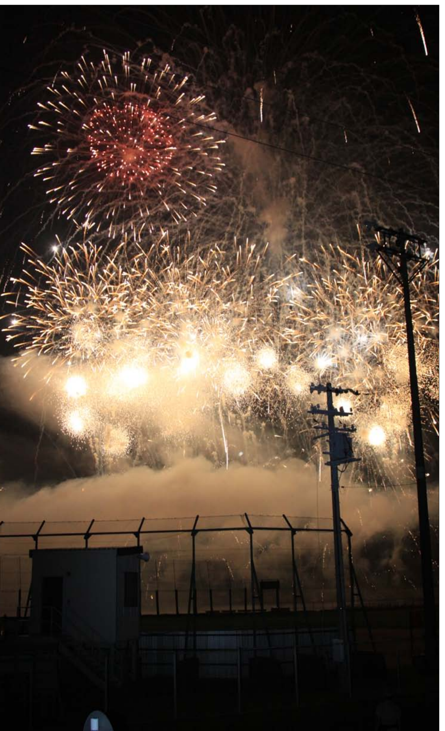
LANCE CPL, MARCEL BROW

Orchestrated explosions of fireworks explode over the Penny Lake skies during the 2010 Independence Day fireworks display July 4. Spectators watched in amazement as the grand finale lit up the entire Penny Lake.