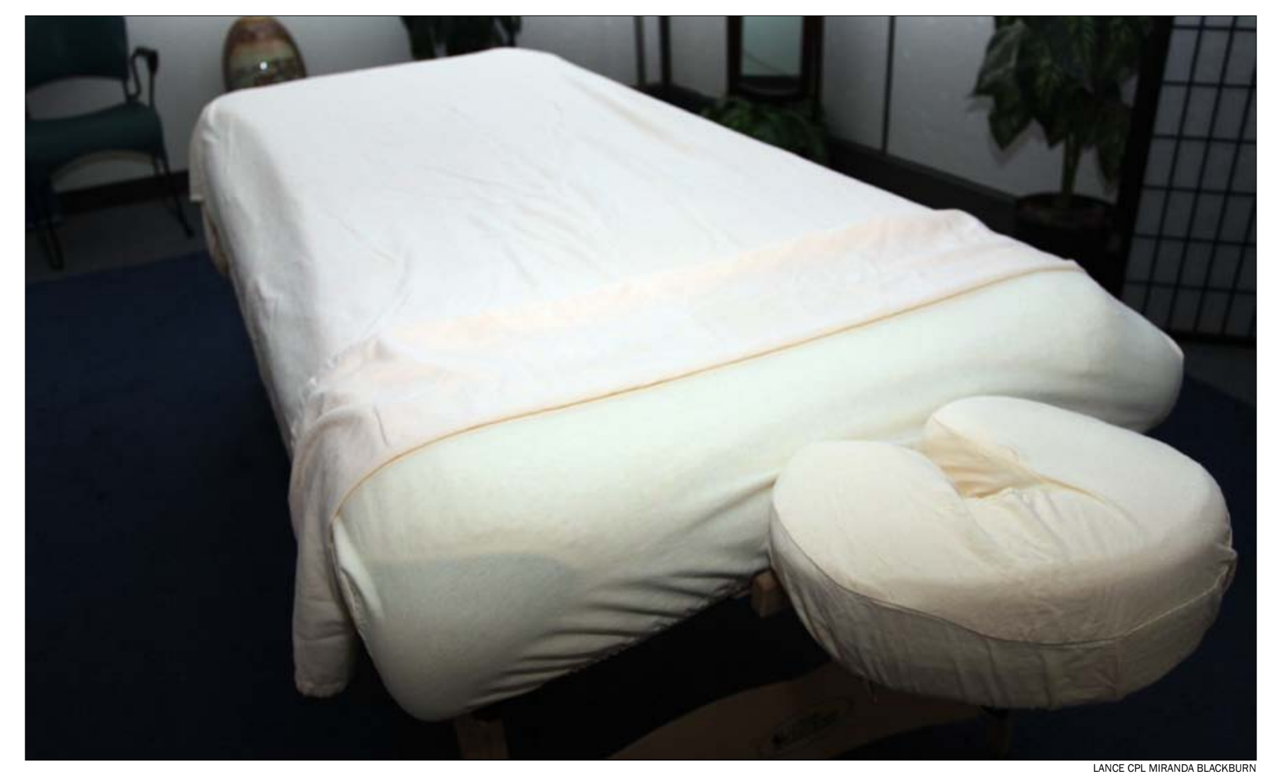
prenatal, sports, reflex