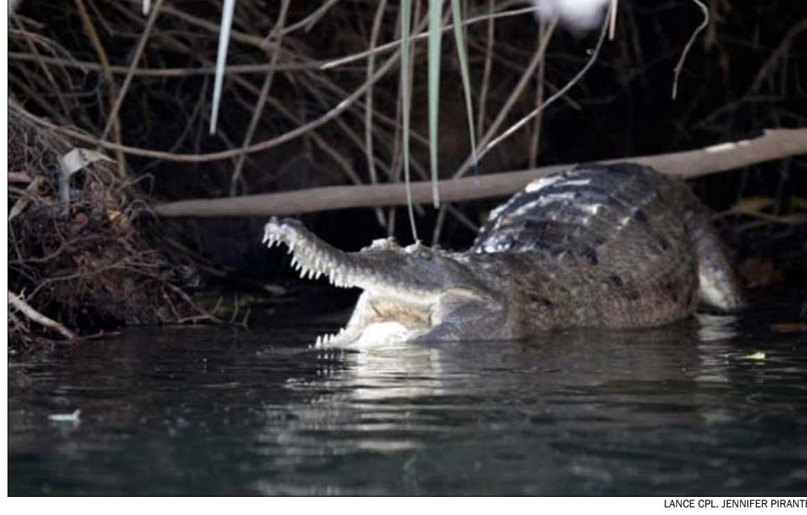
NITMILUK NATIONAL PARK, Australia — A freshwater alligator, approximately four feet in length, rests near the bank of the river as Marines kayak down the Katherine Gorge here in Australia's Northern Territory Aug. 29. The national park is home to many freshwater alligators and nesting

Marines paddled past rocky, sandstone cliffs and freshwater alligator nesting grounds, which warned tourists to stay away from