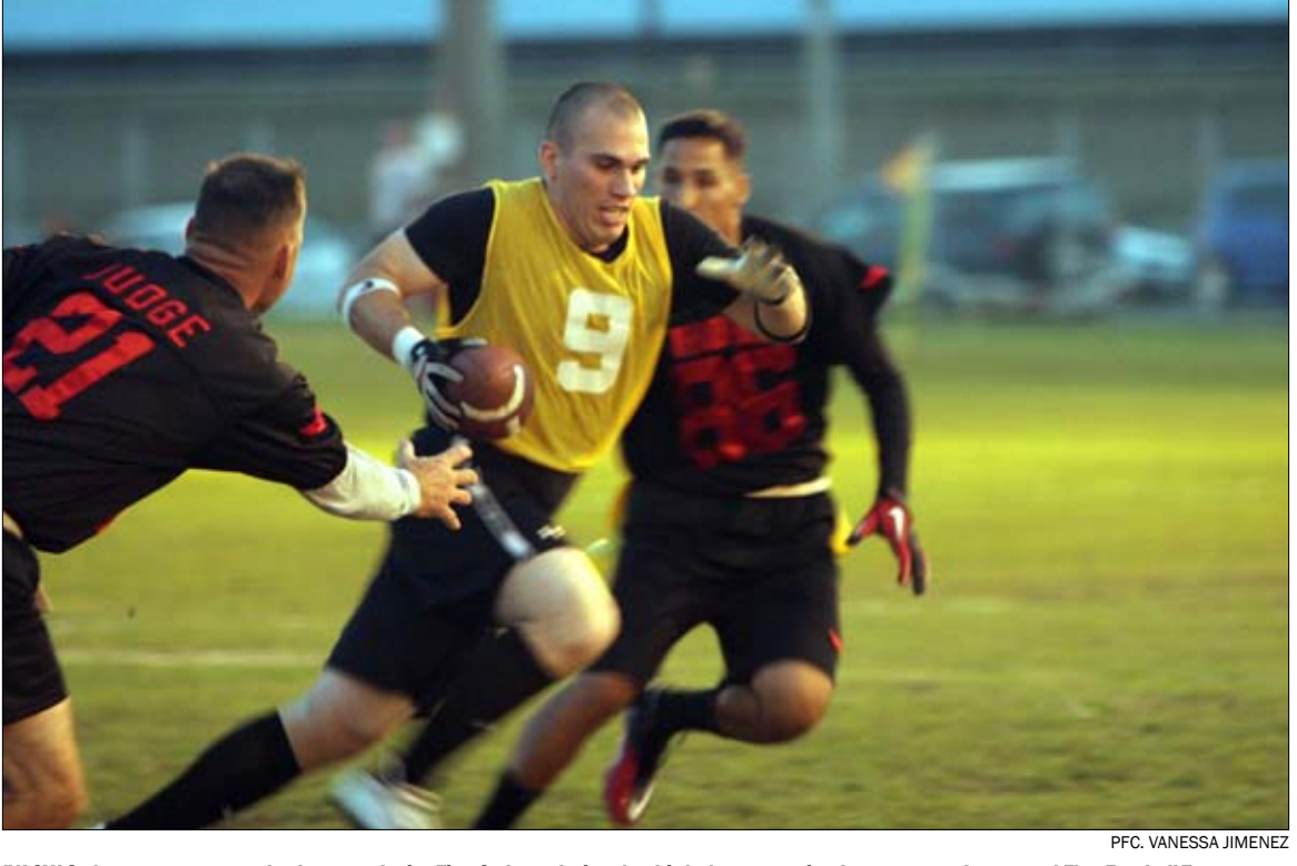
IYAOYAS players attempt to take down an elusive Five-O player during the third-place game for the preseason Intramural Flag Football Tournament at the Penny Lake fields here Sept. 28. Five-O went on to lose in the championship to the All Stars 33-12.

Regular season flag football begins Oct. 18.