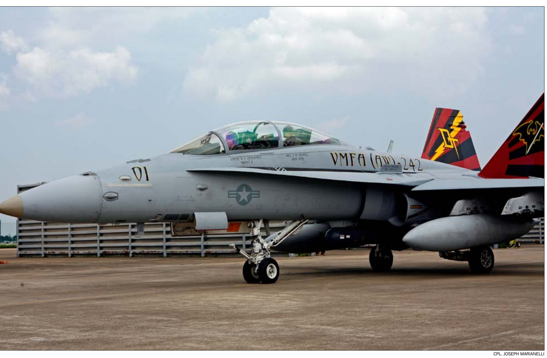
POHANG AIR BASE, Republic of Korea – Marine All-Weather Fighter Attack Squadron 242's flag plane is taxied in preparation for a sortie during exercise Invincible Spirit here July 27. Invincible Spirit was a joint combined exercise where the Navy, Air Force, Marine Corps and Republic of Korea forces worked together to demonstrate solidarity and a commitment to work togethe

By conducting exercises with various countries and keeping good relationships with its host country, MAG-12 has purposefully positioned itself in a constant stance of readiness for today and tomorrow.