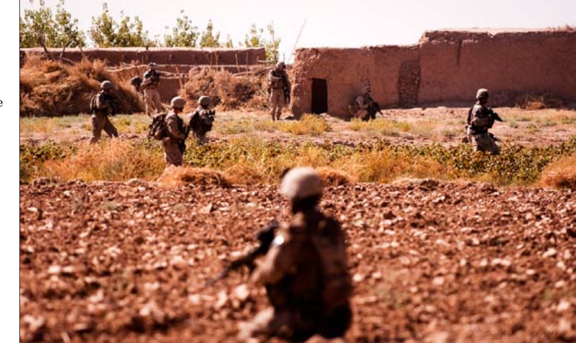
COMBAT OUTPOST SHABU, HELMAND PROVINCE, Afghanistan - Marines from India Company, 3rd Battalion, 3rd Marine Regiment, patrol through Trek Nawa, Afghanistan, during Operation Mako, Sept. 21, 2010. Mako was a one-day clearing mission to disrupt enemy activity.

For India Company's leadership, the discipline of their Marines was among the largest