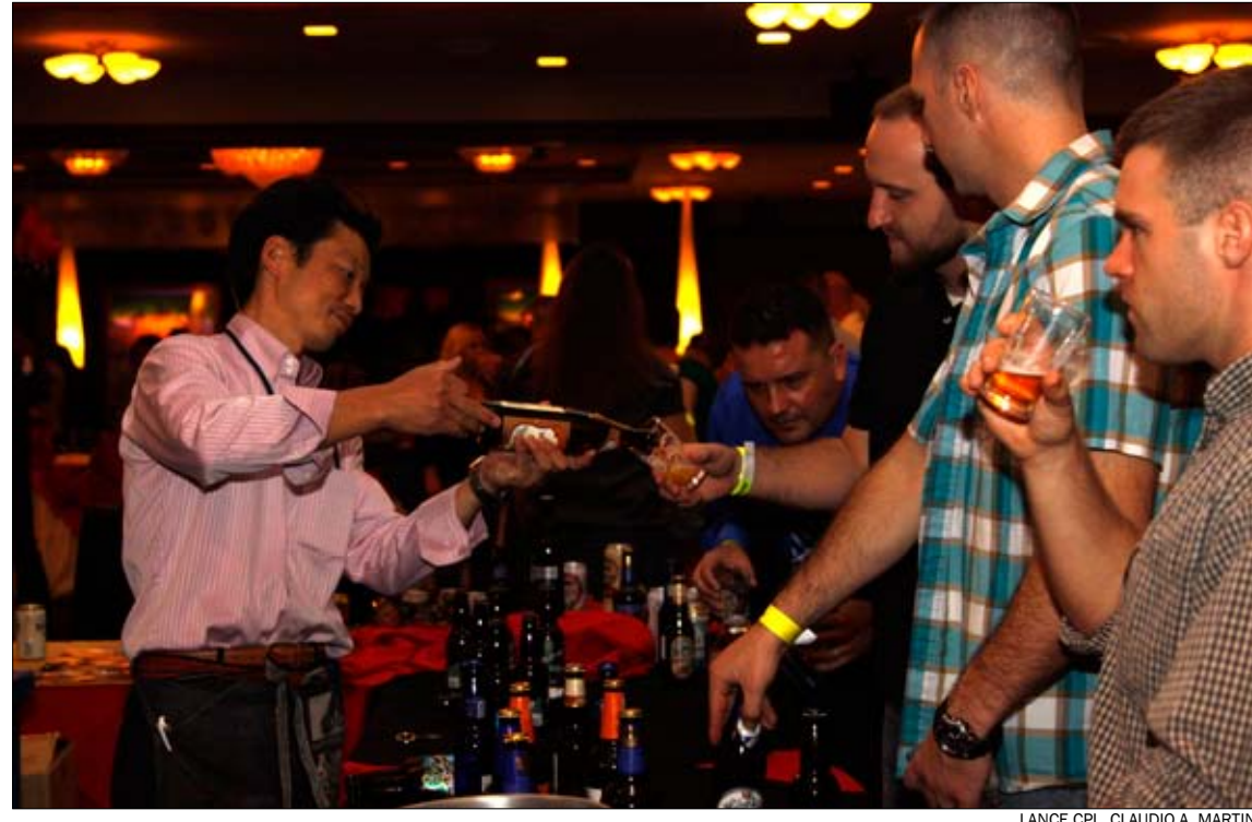
A Club Iwakuni worker serves drinks to club patrons during the 5th annual Iwakuni Fall Harvest Festival hosted at the Club Iwakuni ballroom here Saturday. The festival attracted approximately 500 community members who were able to enjoy a variety of foods and beverages from Mexico, England, Ireland, Germany, Japan and the United States.