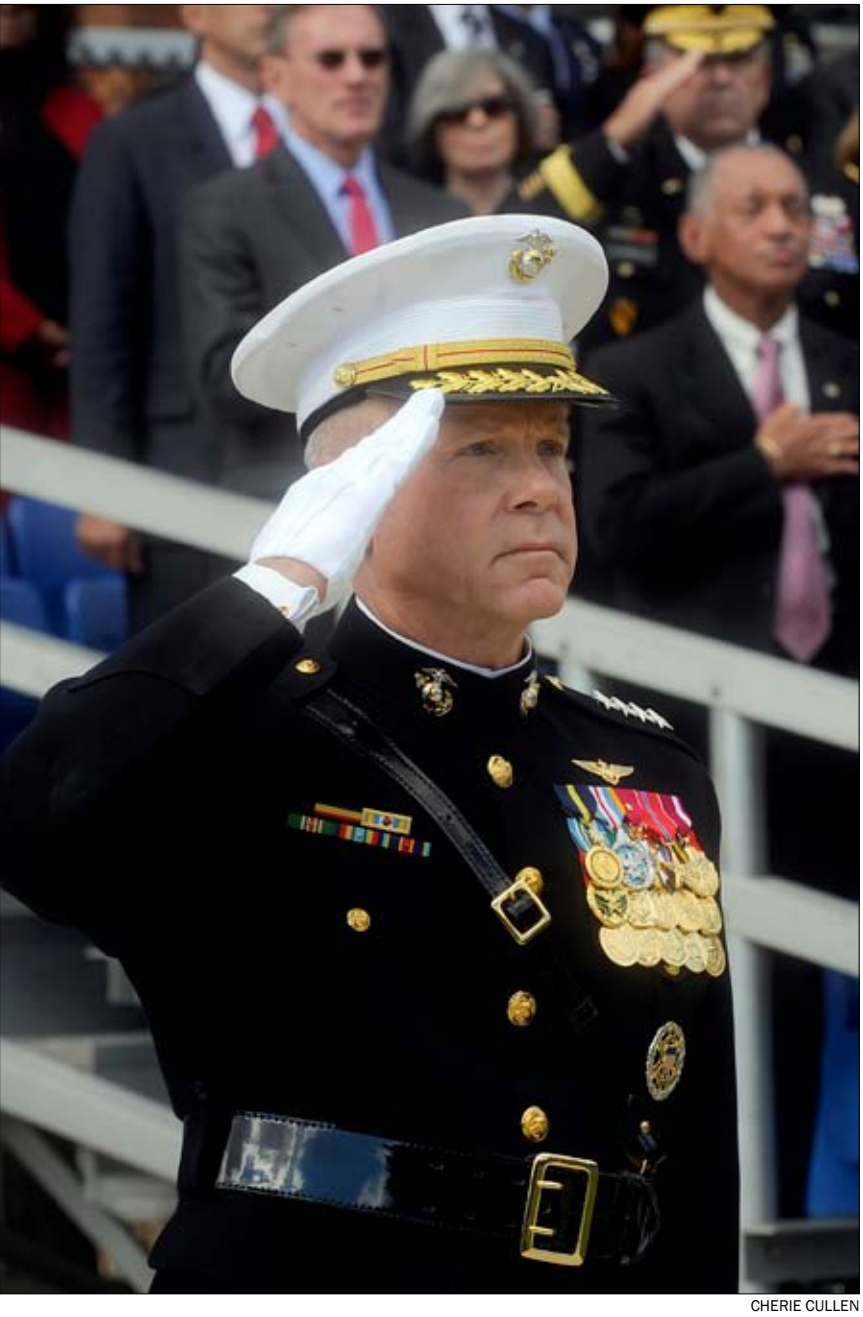
WASHINGTON — The 35th Commandant of the Marine Corps Gen. Games F. Amos salutes during a passage-of-command ceremony at the Marine Barracks here Oct. 22.

PAGE 6&7 THE IWAKUNI APPROACH, OCTOBER 29, 2010 FEATURES