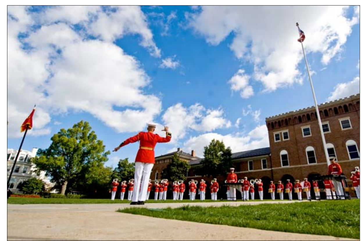
WASHINGTON — The United States Marine Corps Drum and Bugle Corps performs during a passage-of-command ceremony at Marine Barracks