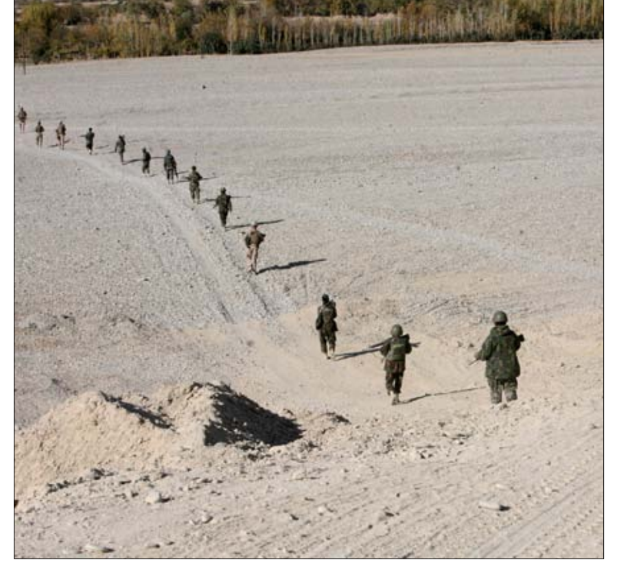
MUSA QAL'EH, Afghanistan - Afghan soldiers patrol alongside Marines with 1st Bn., 8th Marines during the practical application section of the platoon tactics course in Musa Oal'eb. Nov. 30. During the course ived classes on small unit leadership and counter insurgency then applied those lessons over ers recei several patrols through villages around Musa Qal'eh.