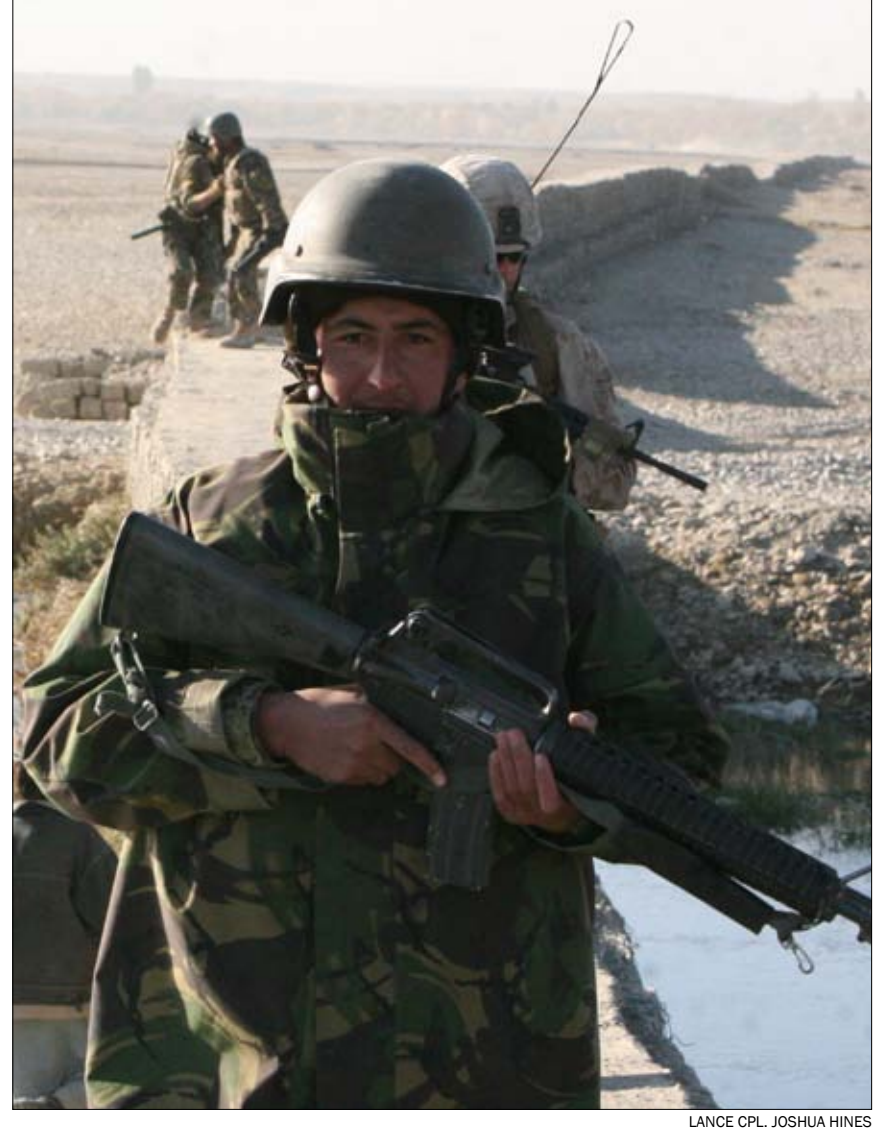
MUSA QAL'EH, Afghanistan - An Afghan soldier walks across a stone wall trough the wahdi during a patrol during the practical application section of the platoon tactics course in Musa Qal'eh, Nov. 30. During th course soldiers were taught proper weapons handling and maintenance