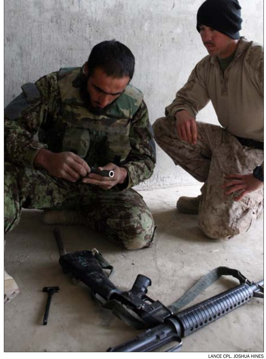
MUSA QAL'EH, Afghanistan - An Afghan National Army soldier disassembles an M16A2 rifle during the weapon maintenance practical application section of the platoon tactics course at the ANA compound in Musa Qal'eh, Dec. 5. During the course soldiers competed to see who could disassemble and reassemble their weapon fastest. Soldiers learned to maintain many different weapons during the 10-day course.