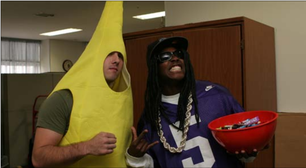
After their poorly planned debut album “I Want Candy” debuted and was roundly rejected by critics as the worst collaboration of all-time, rivaling Yoko Ono’s involvement with The Beatles, Bananaman and Lil Jon agreed they should never work together again. While a minor setback in Lil John’s career, Bananaman never recovered and was last seen panning for change and turning brown. Think you can write a better caption or have your own funny photo to submit? Submit your ideas or photos to the Public Affairs Office by e-mailing them to iwakuni.pao@usmc.mil, calling 253-5551 or submitting your idea in person at the office in Building 1 Room 216. Entries will be judged by the Iwakuni Approach Staff and the top selection will run in the next edition of the Iwakuni Approach.

Roman Catholic Saturday 4:30-5:15 p.m. Confession 5:30 p.m. Mass Sunday 8:30 a.m. Mass 9:45 a.m. Religious Education Tues. – Fri. 11:30 a.m. Weekday Mass Wednesday 6 p.m. Inquiry Class for adults Protestant Saturday 9:30 a.m. Seventh-Day Adventist Sabbath School 11 a.m. Seventh-Day Adventist Divine Worship Sunday 9:30 a.m. Sunday School, Adult Bible Fellowship 10:30 a.m. Protestant Service 11 a.m. Children’s Church 4:30 p.m. Lutheran Holy Communion Service (Small Chapel) Wednesday 6 p.m. Awana (Bldg. 1104) 6:15 p.m. Adult Bible Study (Capodanno Hall Chapel) Church of Christ Sunday 9:30 a.m. Bible Study (small chapel) 10:30 a.m. Worship Service Latter Day Saints Weekdays 6:30 a.m. Youth 12-17 Activities Teen Programs • High School Meetings (Club – grades 9-12) • Junior High Meetings (Club JV – grades 7-8) • HS&JR Bible Studies • Retreats • Service Projects • Missions Trip • Special Events Volunteer Training & Mentoring • Parent Support Group Call 080-4177-2060 or e-mail jletaw@ClubBeyond.org For information regarding divine services, religious education or any other command religious program or chapel activity, call the Marine Memorial Chapel at 253-3371.