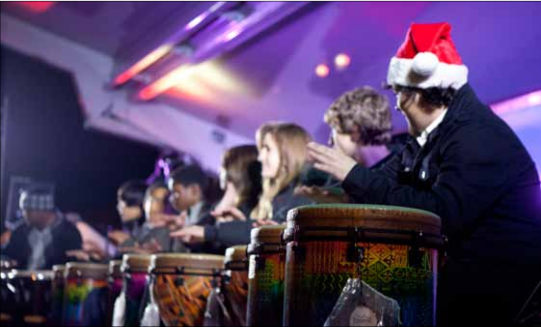
Matthew C. Perry High School drum ensemble plays holiday music during the 10th Annual Holiday Tree Lighting Ceremony here Saturday. The performers brought out the holiday spirit as they played. If you would like to submit your own photo, you can submit to the Public Affairs Office by e-mailing them to iwakuni.pao@usmc.mil or submit them in person at the Public Affairs Office in Building 1, Room 216. Entries will be judged by the Iwakuni Approach staff and the top selection will run in the next edition of the Iwakuni Approach. For more information call 253-5551.

For information regarding divine services, religious education or any other command religious program or chapel activity, call the Marine Memorial Chapel at 253-3371.