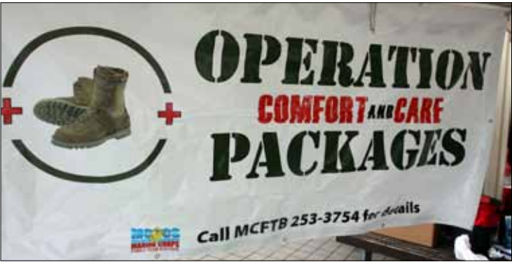
LANCE CPL. CAYCE NEVERS