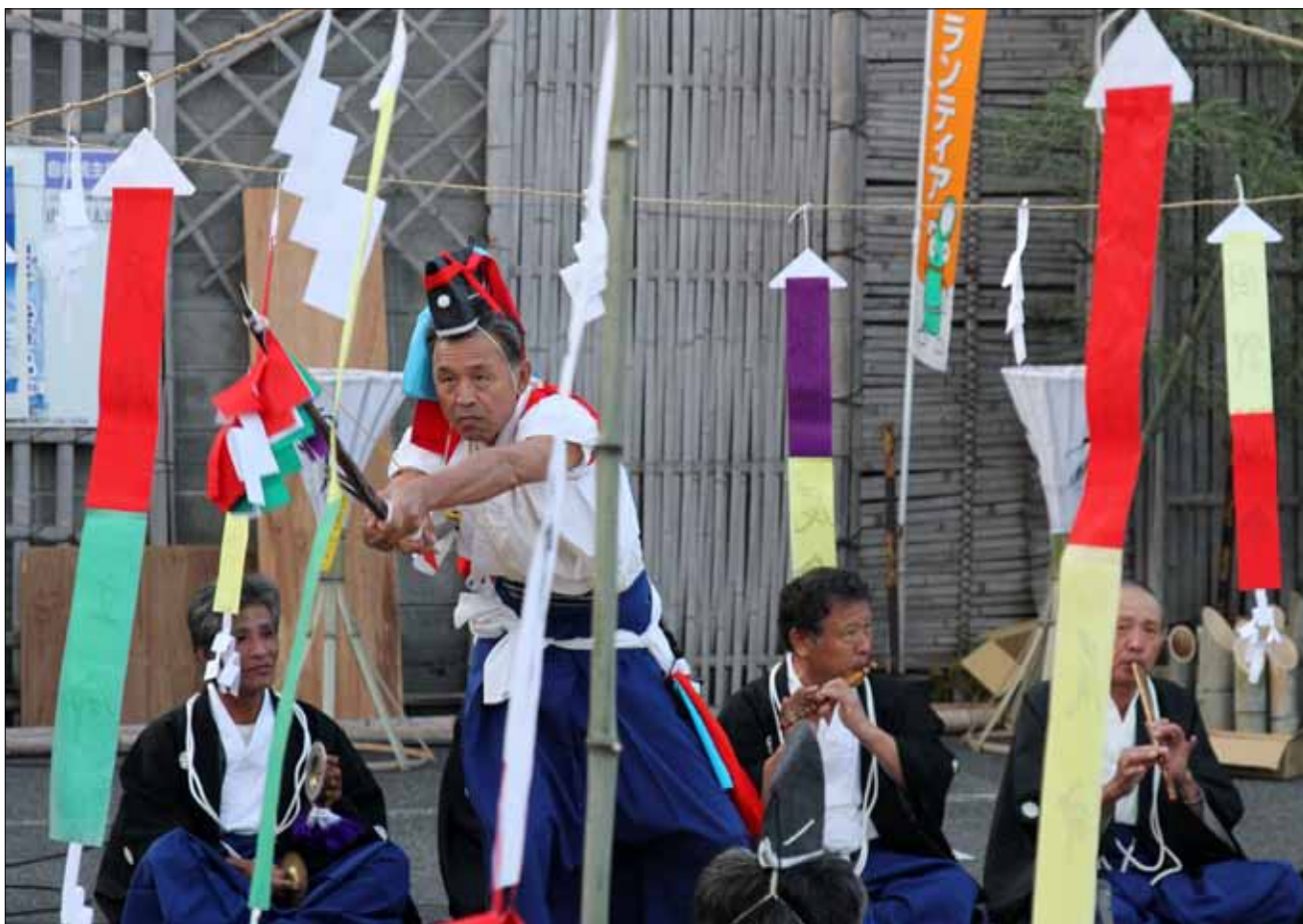
A Japanese man dressed in ceremonial attire performs for a crowd during the Kintai Art Festival near the Kintai Bridge Nov. 3, 2012. When the dance finished, the same location was later used to display a congratulatory monument to the completion of the Iwakuni Kintai-kyo Airport.

Imagine hailing a taxi from the station and making its way to the Kintai Bridge. As the cab arrives, the passenger gets out, and grabs a bite to eat at one of the nearby restaurants to pass some time or pays the 300 yen toll to cross