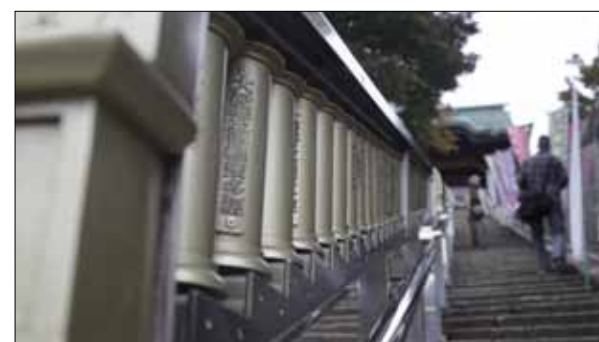
Prayer wheels line the center of the stairway leading to one of the Itsukushima Shrines, Nov. 4, 2012. According to the Buddhist religion, a person who spins all the prayer wheels will be blessed with good fortune.