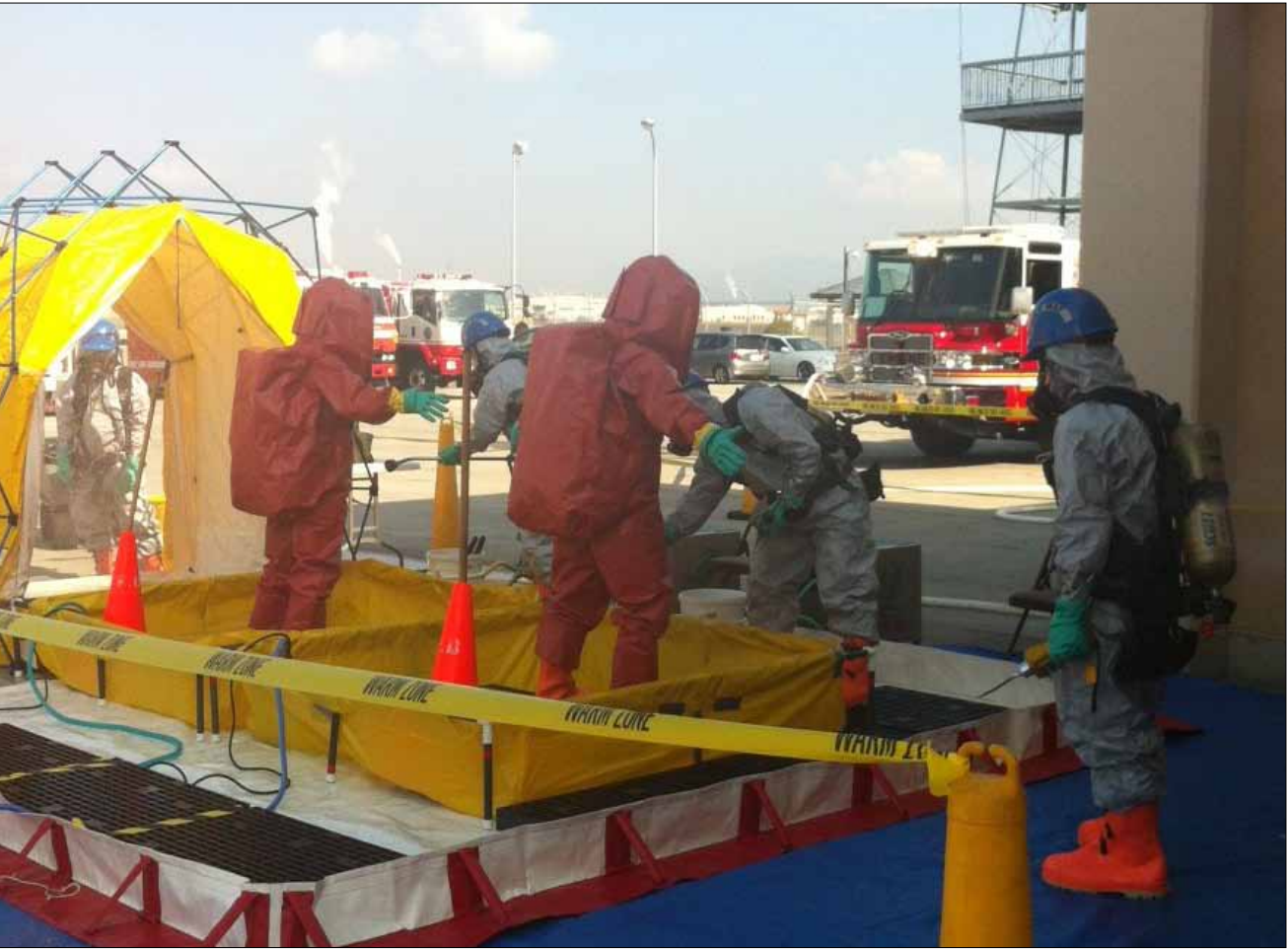
Marine Corps Air Station Iwakuni Fire Department firefighters verify other firefighters are clean after completing the technical decontamination portion of a hazardous-materials training exercise here Oct. 25, 2012. Twenty four of the fire department’s 41 fire fighters completed the course.