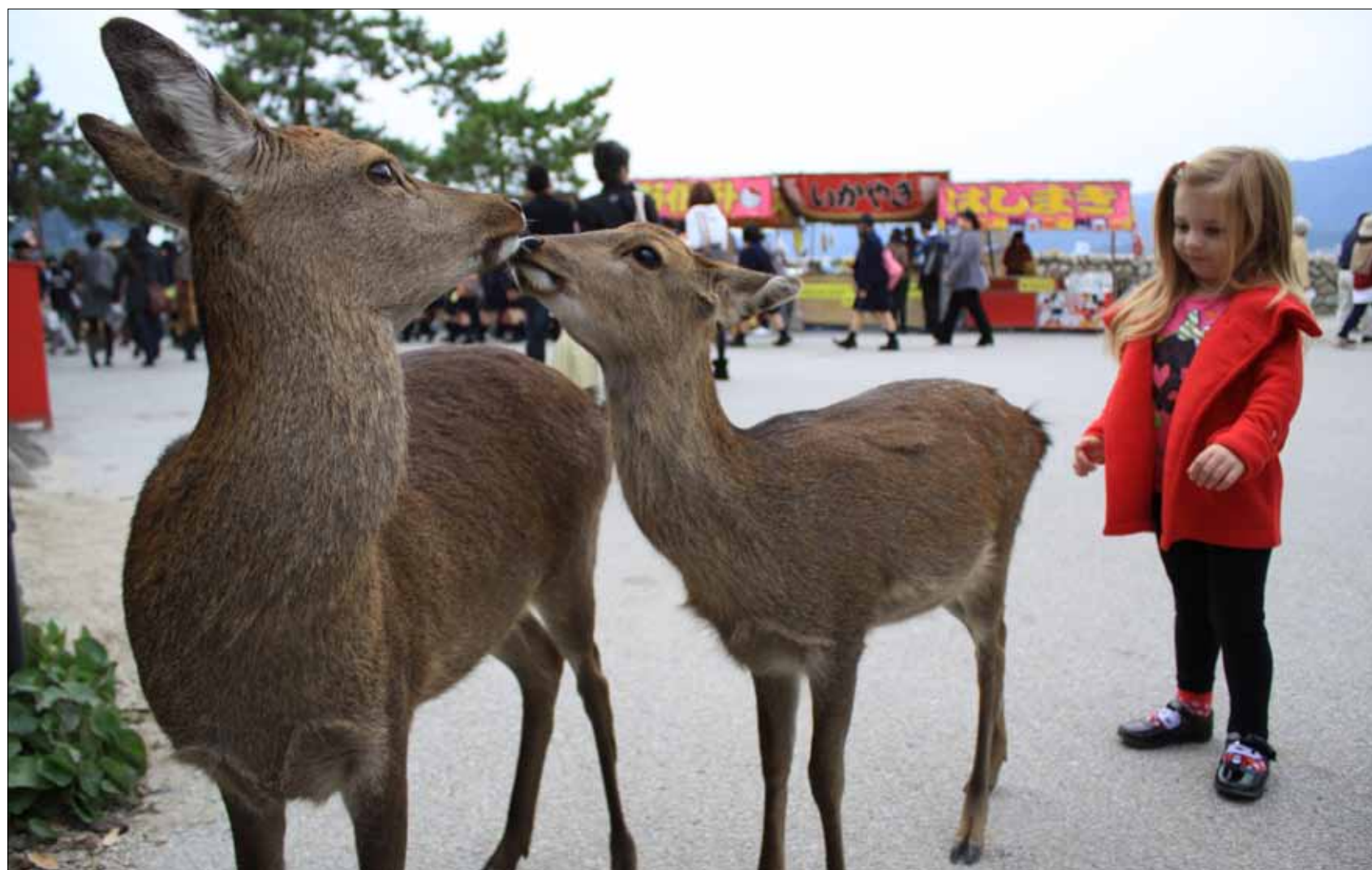
A child watches as two Sika deer play among the crowd on Itsukushima, Nov. 4, 2012. Made tame through continual human interaction, the deer have a tendency to approach and follow any persons who show too much kindness in supplying treats.

With so much tradition and history embedded into such a small, yet lively island, there is little to no reason for anyone to not visit Itsukushima, more commonly known as Miyajima Island.