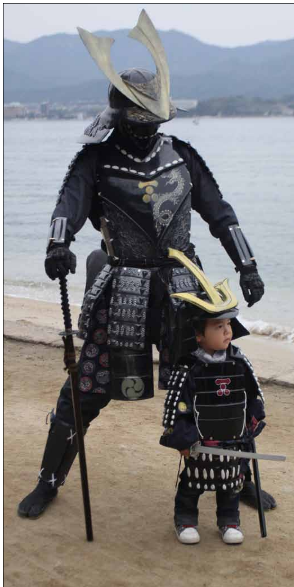
Two Itsukushima visitors, dressed as Samurai, stand together on the shore of Itsukushima, Nov. 4, 2012. Itsukushima, more commonly known as Miyajima Island, has many sights, scenic routes for locals and tourists and many opportunities to taste the local Japanese food.