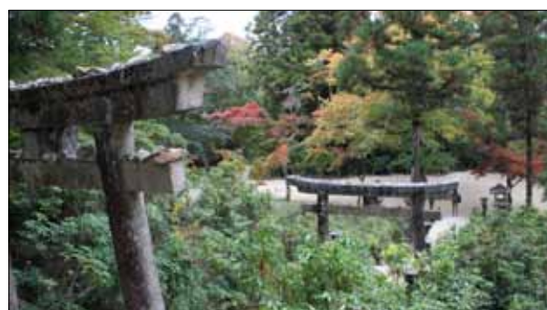
Stone torii gates stand over a path on the island of Itsukushima, Nov. 4, 2012. The island is famous in part for its abundance of maple leaves.