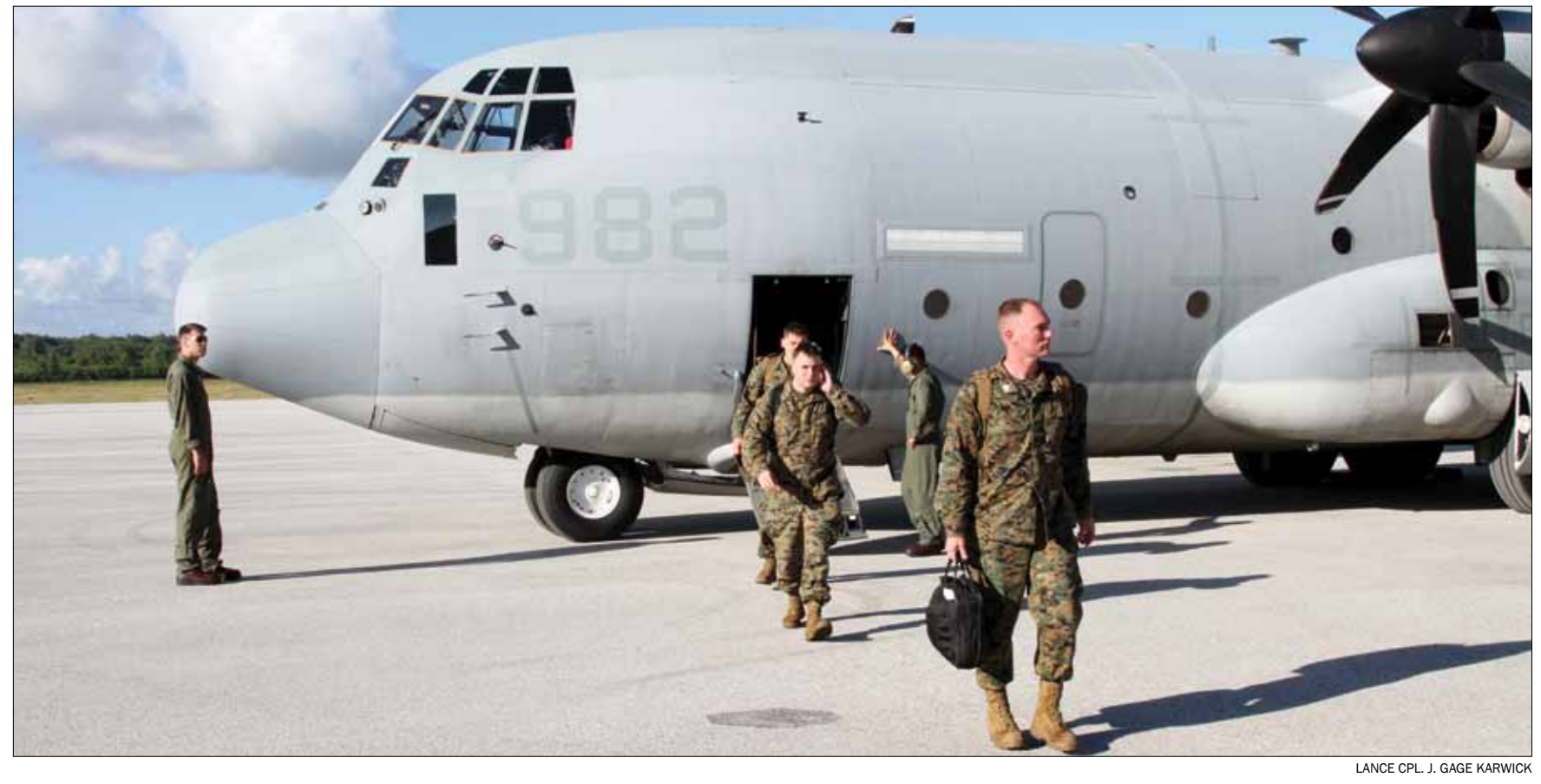
Narines with Marine Wing Support Squadron 171 disembark from a KC-130J Hercules aircraft Nov. 27 at Tinian's West Field in preparation for Exercise Forager Fury 2012. The Marines consist mainly of exped airfield technicians and aircraft recovery Marines and are preparing for upcoming exercises taking place on Guam and Tinian, with Tinian serving as a refueling site for Marine Aircraft Group 12 aircraft. Training on Tinian's West Field includes emplacement of arresting gear and fuel storage/distribution for purposes of extending aviation training throughout the Mariana Island Range Complex.