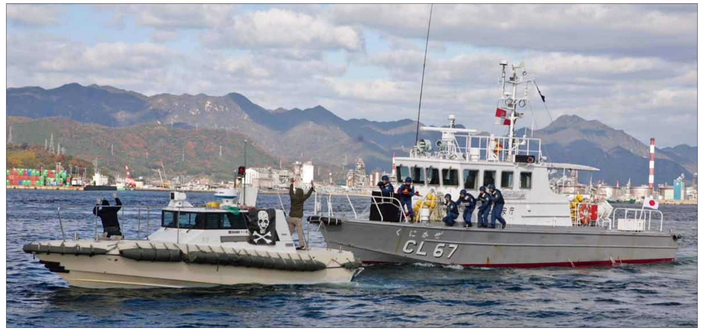
A boat loaded with Iwakuni Coast Guard members closes in on a hostile ship during an antiterrorism exercise, at Iwakuni Harbor, Nov. 27, 2012. Members from Marine Corps Air Station Iwakuni's Antiterrorism and Provost Marshal's Office were on hand to visit the training performed by the Iwakuni Coast Guard. Police and Customs