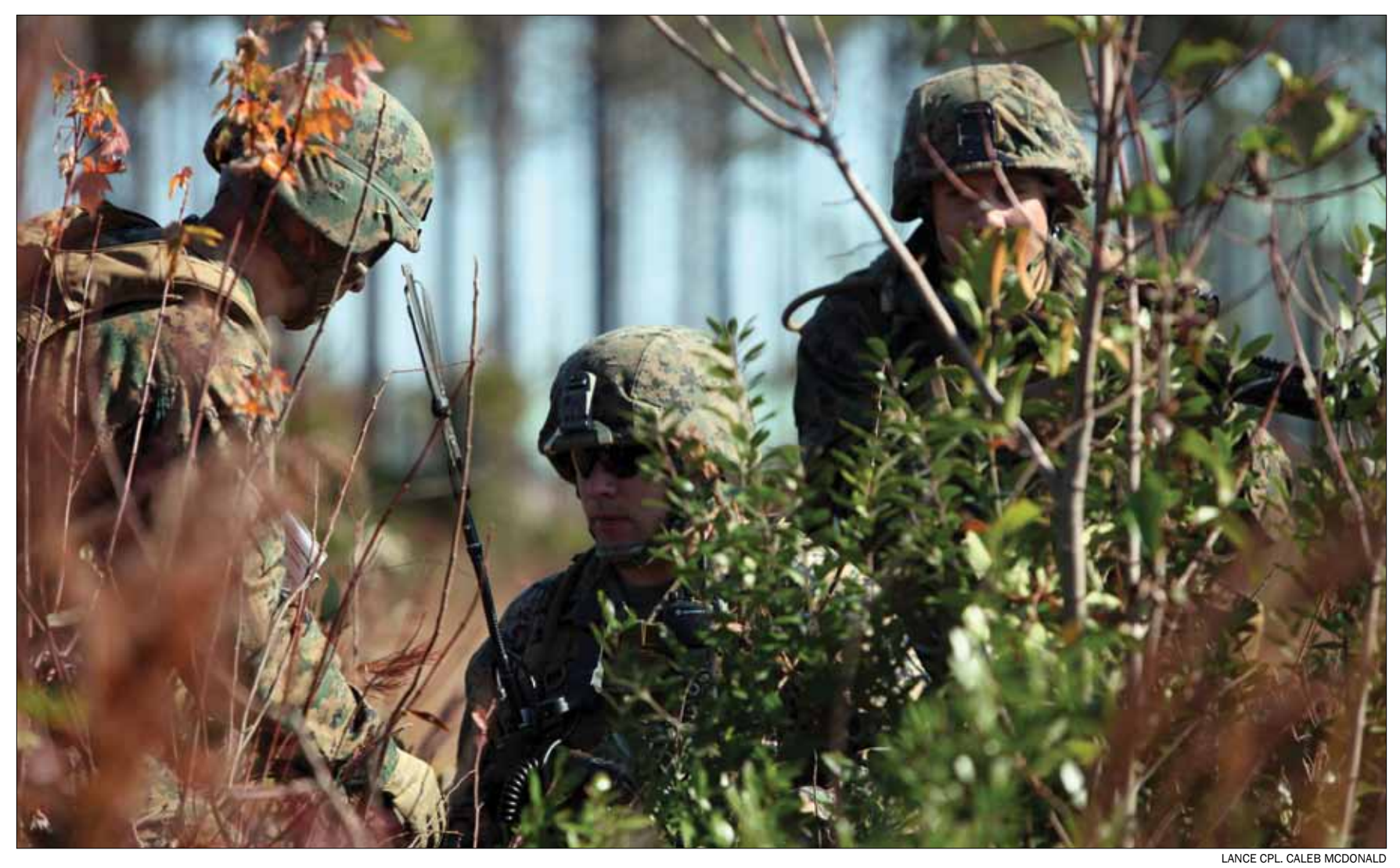
Marines with Special-Purpose Marine Air-Ground Task Force Africa radio an inbound MV-22 Osprey during a field training exercise aboard Marine Corps Base Camp Lejeune, N.C., Nov. 16, 2012. Special-Purpose MAGTF Africa is training for their uncoming deployment