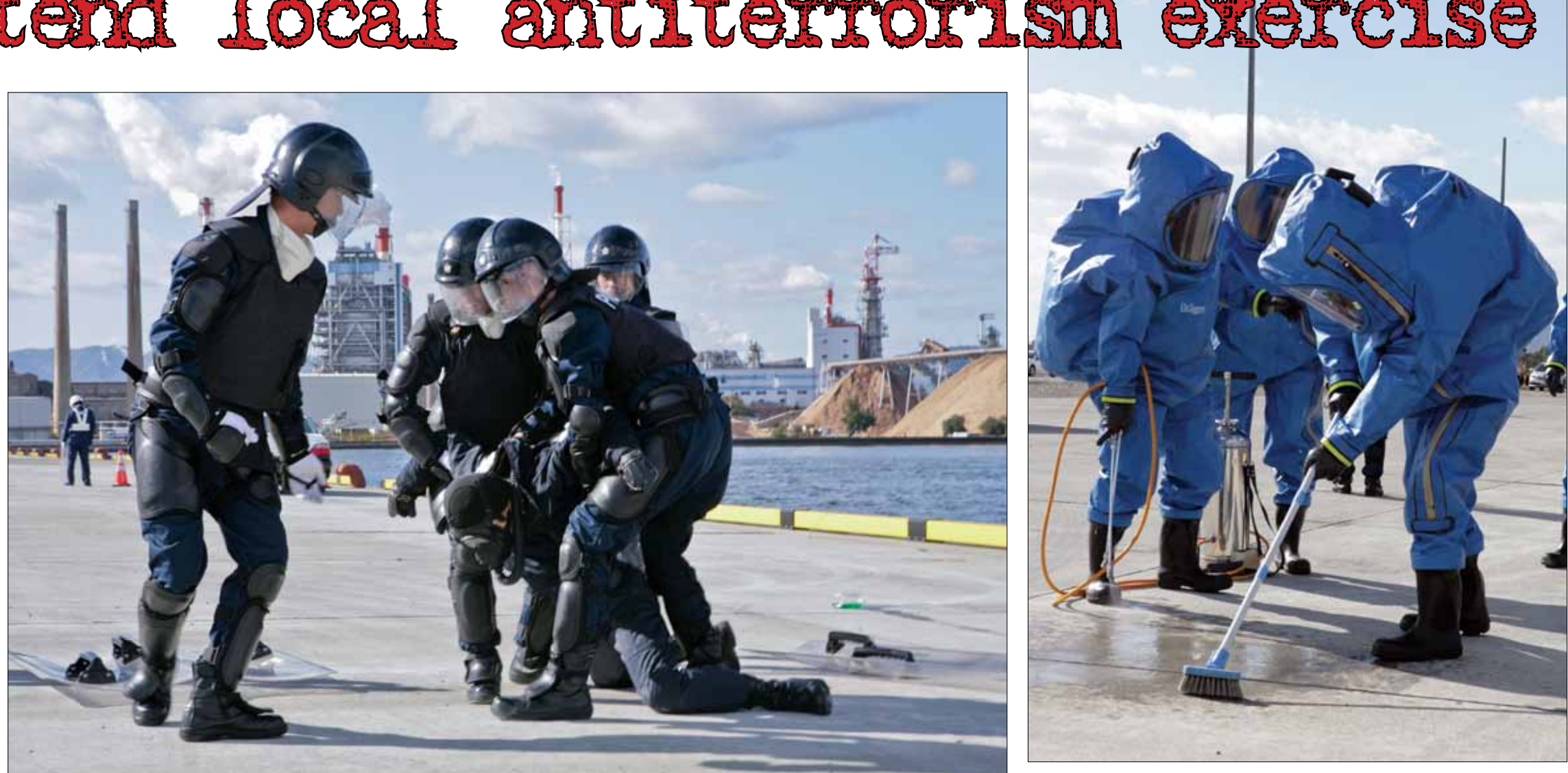
Iwakuni policeman dressed in riot control gear wrestle with a hostile attacker during an antiterrorism exercise in the Iwakuni Port, Nov. 27, 2012. The police ability to subdue an armed assailant using non-lethal tactics during the exercise