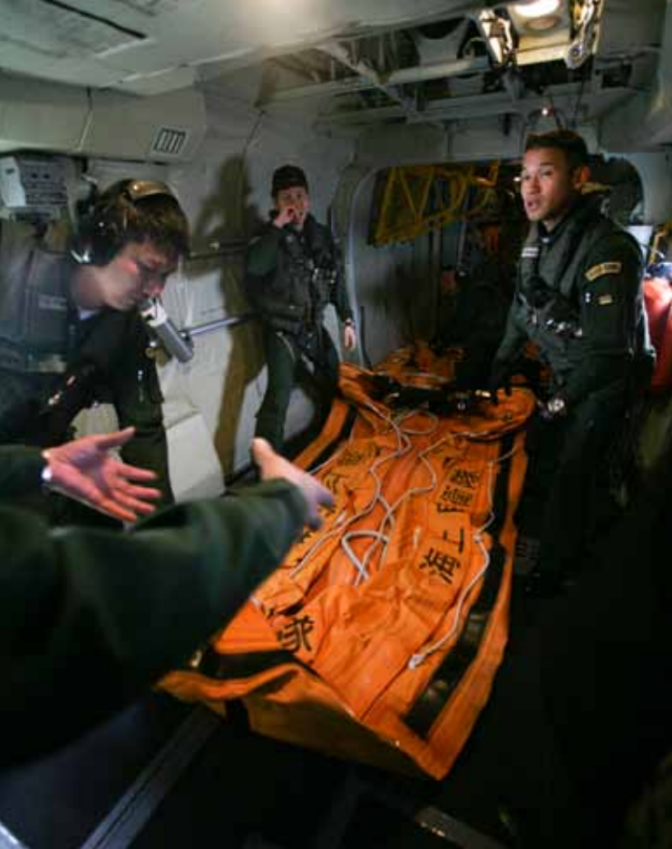
and rescue raft aboard a US-2 aircraft here as part of training Jan. 8, 2013. The training included the squadron's first flight of the year and a search and rescue sim

27 times in 2012. US-1A and US-2 remain prepared and ready both on JMSDF Iwakuni Air Base and Atsugi Air Base seven days a week and 24 hours a day. This is so people located on remote islands and on ships have confidence that JMSDF search and rescue teams are ready to assist them.