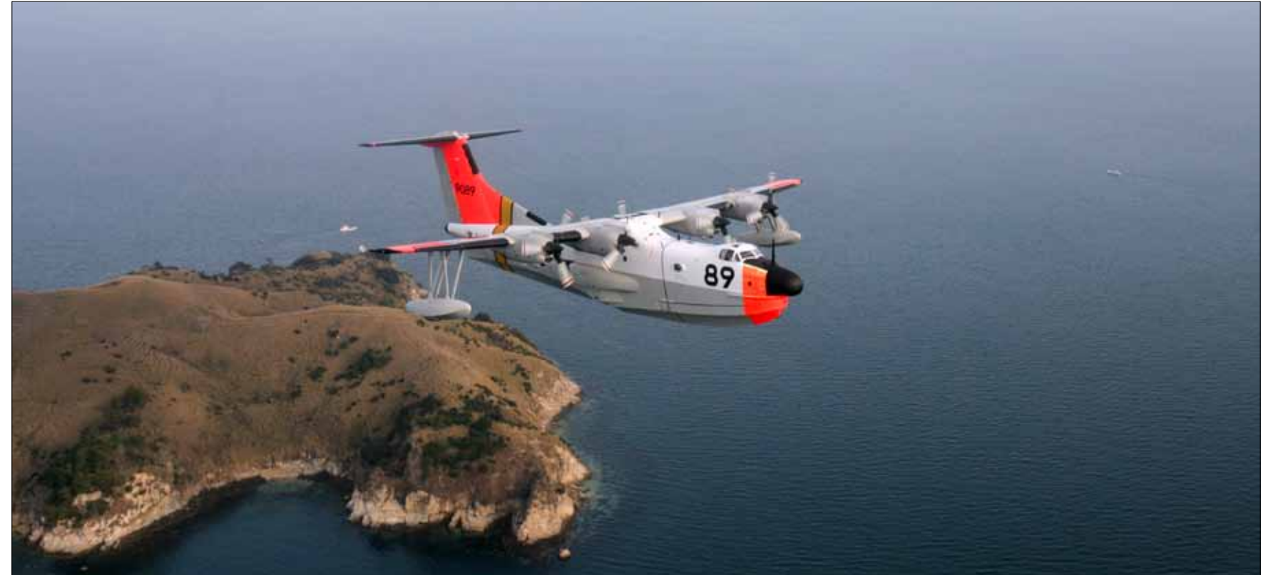
A Japan Maritime Self-Defense Force, Air Rescue Squadron-71 US-1A aircraft prepares for a water landing before a simulated search and rescue here Jan. 8, 2013. The US-1A and US-2 are large, short takeoff and landing aircraft designed for search-and-rescue work.