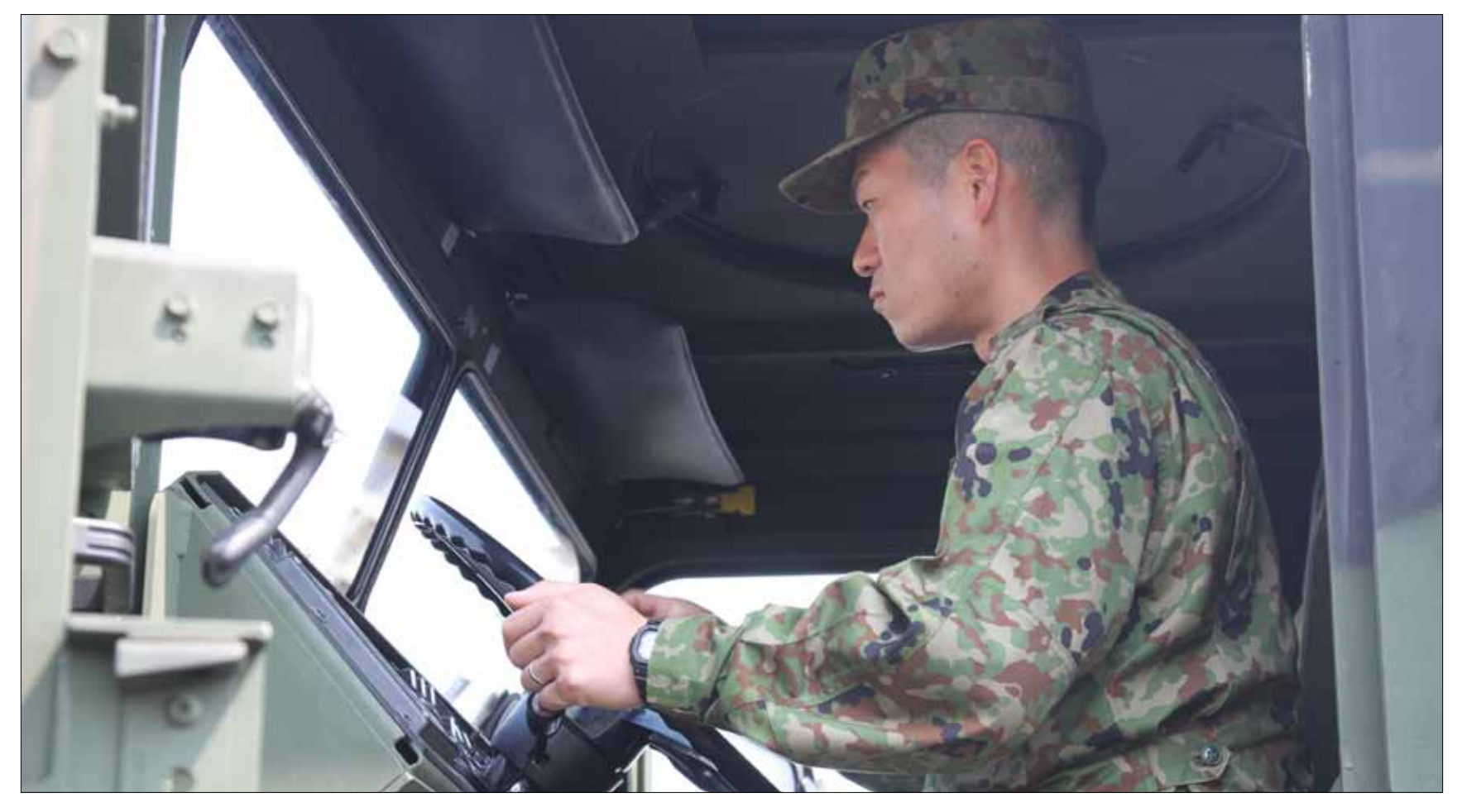
A Japan Ground Self Defense Force Member sits inside a AMK36 Wrecker here, April 12, 2013. Combat Logistics Company 36 is planning a trip to Hiroshima to visit the JGSDF base