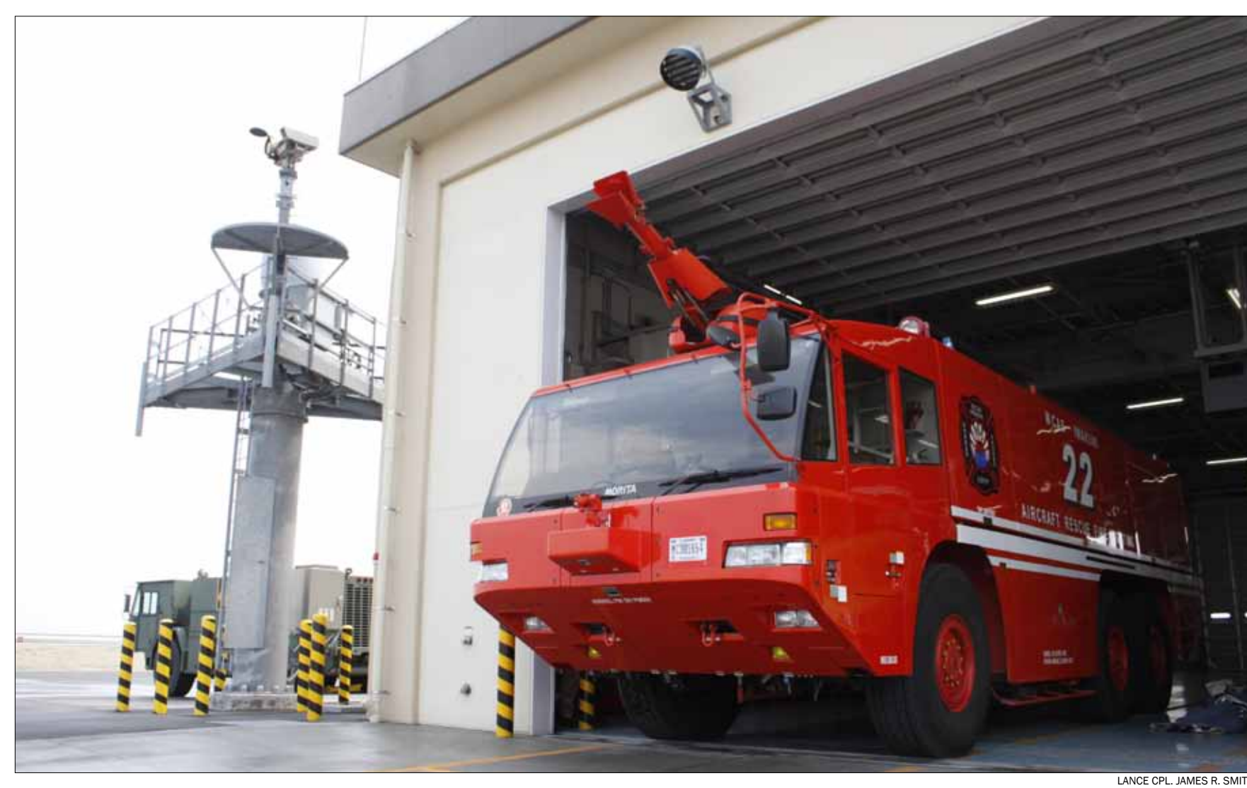
Station Aircraft Rescue Fire Fighting's Morita Airport Crash Tender MAF-125 exits the ARFF warehouse after undergoing a maintenance check at Marine Corps Air Station Iwakuni, Japan, April 11, 2013.

Failure to pay road tax can result in the impoundment of your vehicle.