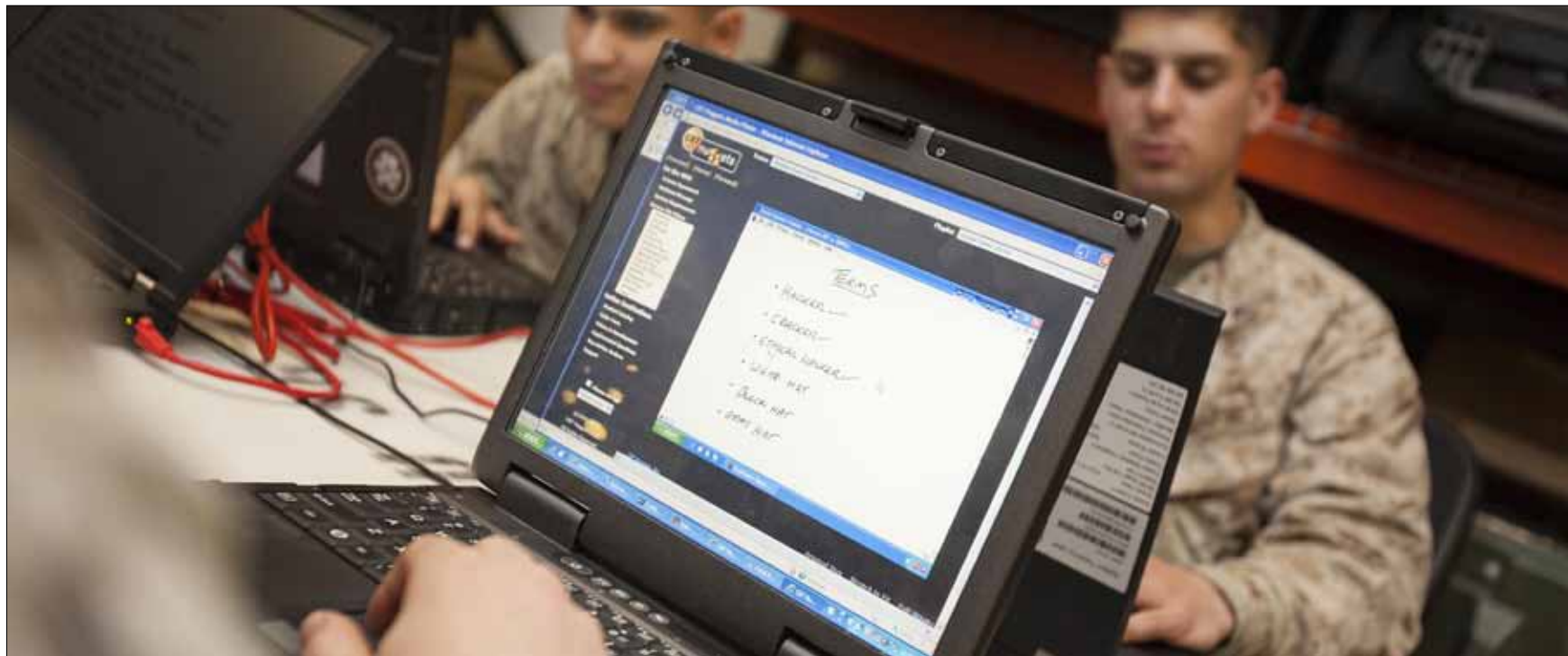
GT. AUSTIN HAZARD

Data network technicians with 22nd Marine Expeditionary Unit test a network server, loaded with training courses to provide professional development during deployment, at the unit's communications facilities at Marine Corps Base Camp Lejeune, N.C., April 4, 2013. The unit is constantly training to maintain a high state of readiness.