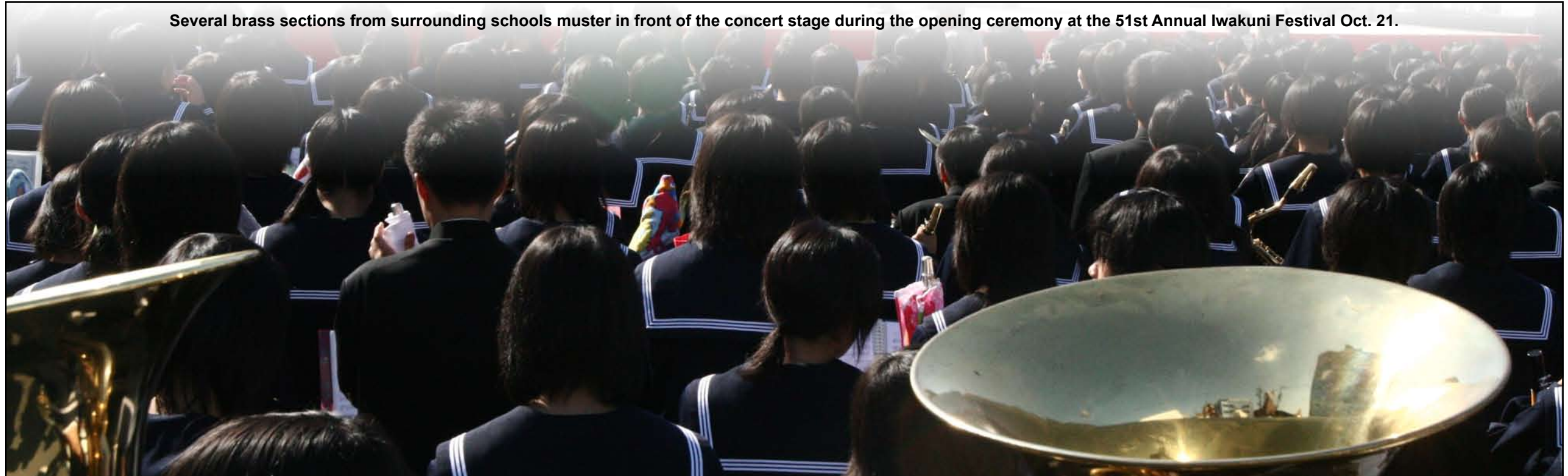
Several brass sections from surrounding schools muster in front of the concert stage during the opening ceremony at the 51st Annual Iwakuni Festival Oct. 21.

“I always love serving at the Iwakuni Festival,” said Seuehiro. “The weather is always perfect and you get to party and drink with your whole neighborhood, and their neighborhood.”