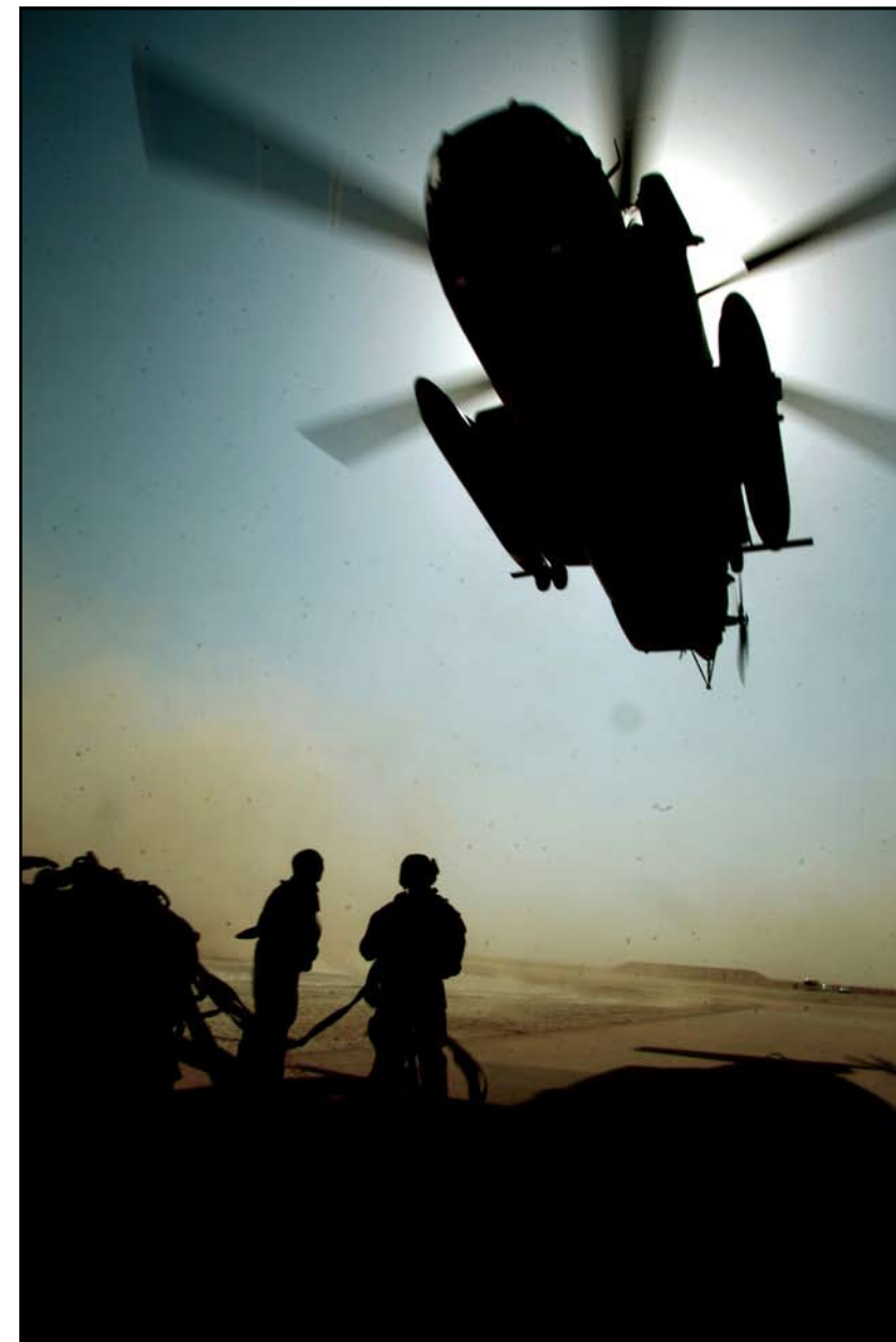
Cpl. Wayne Edmiston

A group of Marines watch as a CH-53D Sea Stallion helicopter flies inbound to pick up a load of supplies. The landing support Marines with Combat Logistics Battalion 4 ensure vital supplies get out to units at various combat outposts. Combat outposts like COP Timberwolf rely heavily on helicopters to airlift vital supplies to their position.