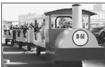
The holiday train only rolls around once a year and it was one of Hometown Saturday's most popular activities. The train took residents on a cheerful ride around the base.

Services special event director. "It's a great way to bring a piece of home to Japan for Marines and Sailors."