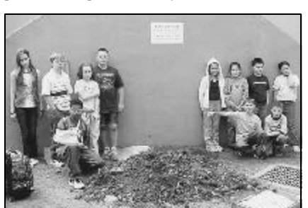
The students who participated in burying the time capsule stand beside their piece of history. The time capsule won't be touched for 100 years.

"I gave the students a list of many possible unit options, and they