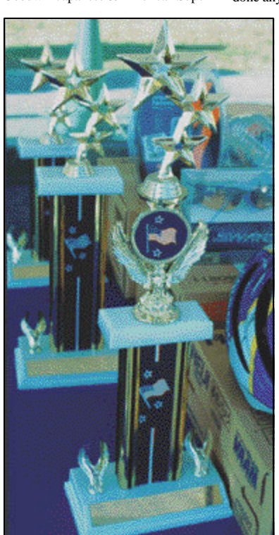
Most competitors were striving for a trophy but others simply enjoyed the experience of physical training with friends.

"I am always proud of the fact that Japanese and Americans can come together for a day of healthy competition," said Tadamasa. "What I like about the competition is that it is nondiscriminatory. The young, the old, males and females can all come out and participate."