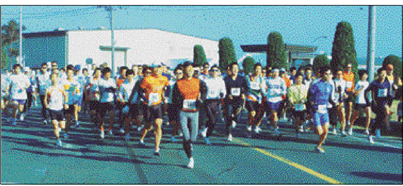
Only the strong survive... or those who have the most endurance at the Marine Corps Community Services 16th Annual Goodwill Japanese and American Super Duathlon. The event began and ended with a five-kilometer run.

PAGE12 TORII TELLER, DECEMBER 10, 2004 SPORTS