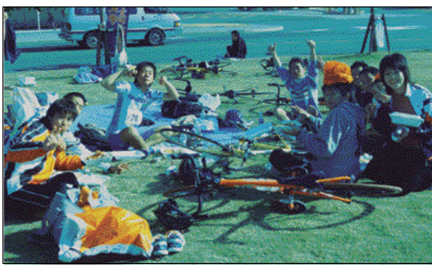
phy but others simply enjoyed the experi- After the event, everyone relaxed with family and friends and ate some not-so-healthy food.