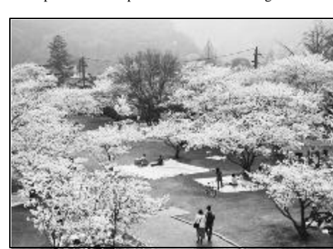
The festival was filled with patrons sitting on tarps enjoying a barbecue with good friends, family and food and drink. The festival is all about relaxing under a Sakura Tree and celebrating nature's

The Sakura Tree only blossoms for a couple of weeks in spring and fills the Japanese landscape with a