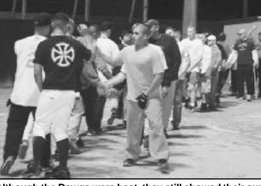
Although the Dawgs were beat, they still showed their support to the Midgets when the game ended with the mercy

The hitting started soundly enough for the