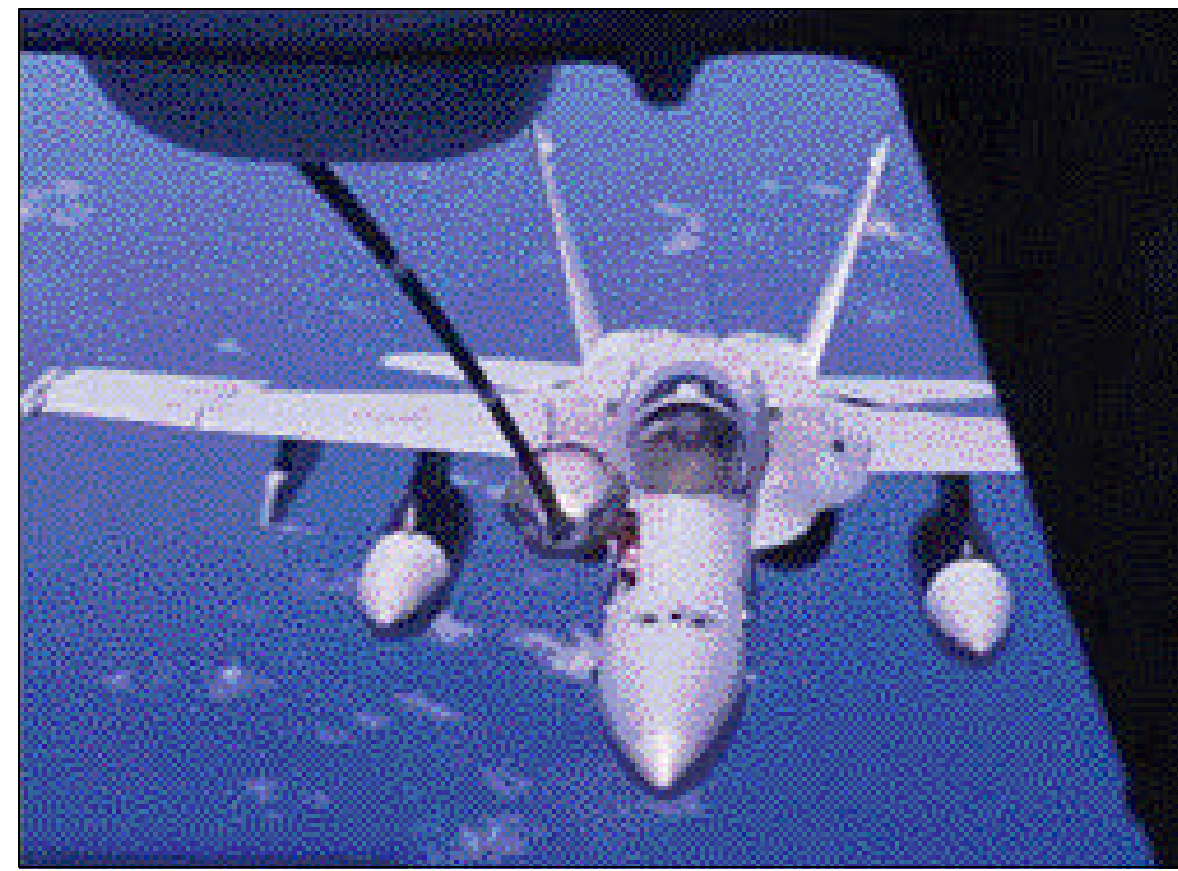
Official Torii Teller photo