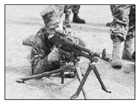
A Marine Aviation Logistics Squadron 12 Marine looks down the site of a M240G during a weapons familiarization and tactical emplacement class, recently.

Feedback from aviation Marines deployed to these combat zones serves as a reality check for those currently serving in rear operations. Once on the ground in Iraq or Af-