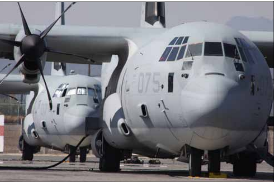
LANCE CPL. CAYCE NEVERS