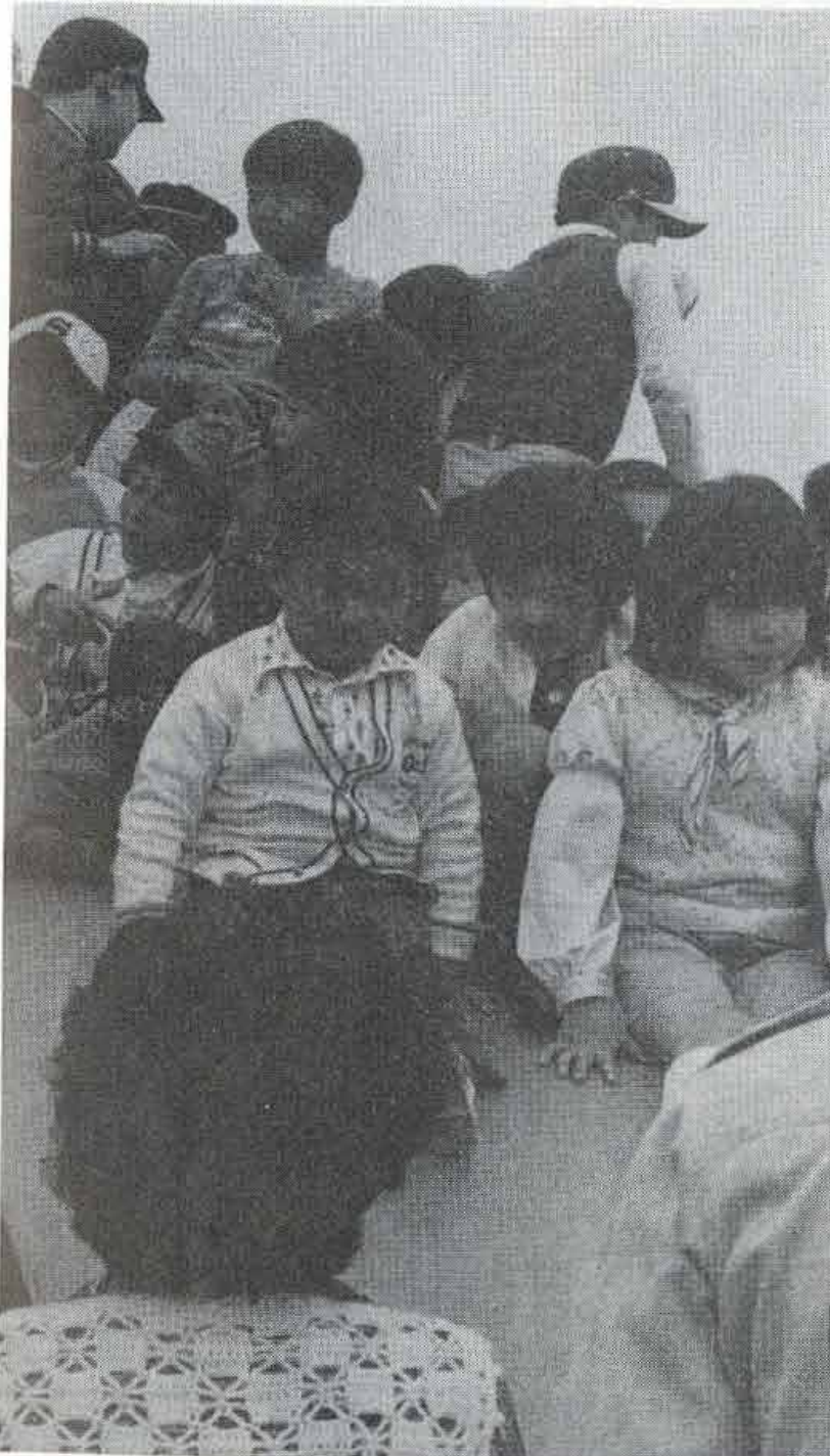
BEST THING SINCE BUBBLE GUM - Japanese children found the air inflated fuel bladders a source of constant joy as they bounced around on them on the parade field in front of Station headquarters.