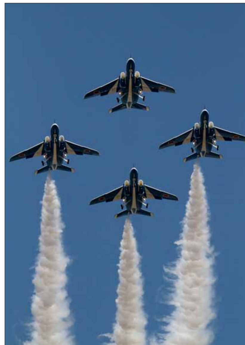
LANCE CPL. TODD F. MICHALEK

Blue Impulse planes fly over Marine Corps Air Station Iwakuni while performing aerobatic stunts during Friendship Day here, May 5, 2012. The events for the day also included static displays, bouncy houses and other attractions for children and a plethora of booths placed around the airfield.