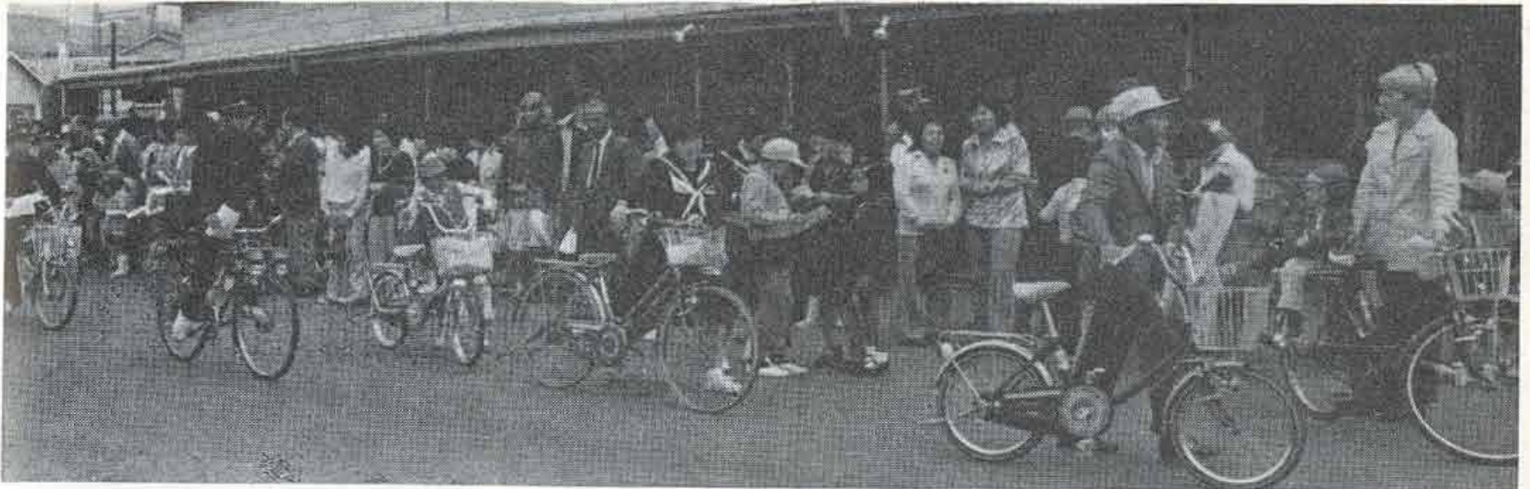
CROWDS STREAMING IN - When the gate opened, the first increment of the more than 70,000 Japanese visitors to come aboard the Air Station began to flow in.

In the May 14, 1976, issue of the Torii Teller, Marines reported on the fourth annual Friendship Day drawing in approximately 70,000 spectators, station Marines attending a ceremony to honor 11 American airmen who died in a mid-air collision in 1945, the first annual arm-wrestling tournament aboard station and servicemembers having three additional months to use accrued leave in fiscal year 1977.