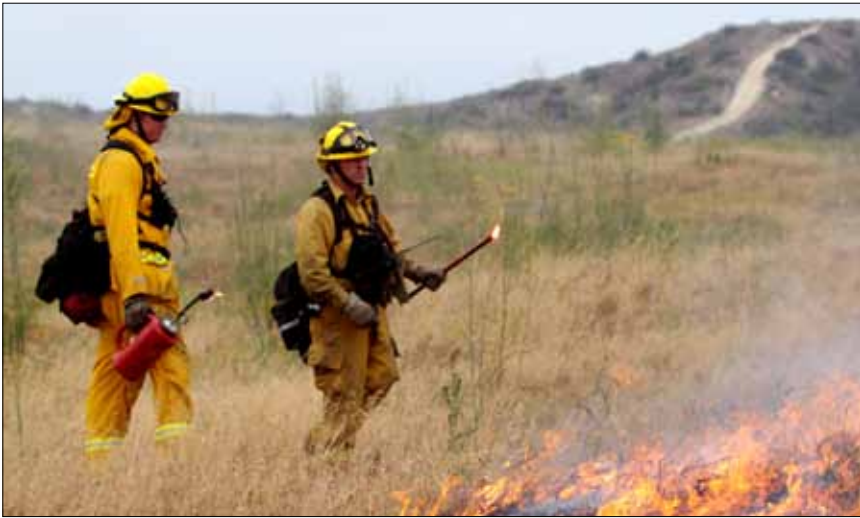
MARINE CORPS BASE CAMP PENDLETON, Calif. — Instructors watch a controlled burn's behavior during this year's wild land fire training exercise on Camp Pendleton, June 15, 2012. The training not only affected those battling the fires on the ground but also gave an opportunity for the fire departments' chiefs and commanders, who were supervising the training procedures from on top of hills, to practice where to disperse their men and study how the fires spread aboard the base.

important that we practice these procedures now so we can find our weakness before it's too late." During the training, instructors started small controlled fires, and had each crew focus on working together to surround the fire and contain it from spreading outwards. "Our goal is to prepare the men and women for the unpredictability that the fires on Pendleton possess," said Wilkerson. "The fires here on base can get out of control fairly easily, so it's important we join together and practice our techniques so we can study its behavior firsthand." The training not only affected those battling the fires on the ground but also gave an opportunity for the fire departments' chiefs and commanders, who were supervising the training procedures from on top of hills, to practice where to disperse their men and study how the fires spread aboard the base.