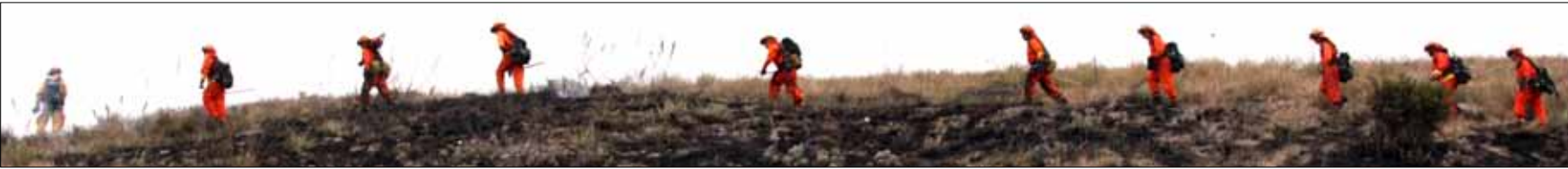
MARINE CORPS BASE CAMP PENDLETON, Calif. — Fire fighters from across San Diego walk the perimeter of a controlled burn to ensure it is extinguished during this year's wild land fire training exercise on Camp Pendleton, June 15, 2012. During the training, instructors started small controlled fires, and had each crew focus on working together to surround the fire and contain it from spreading.